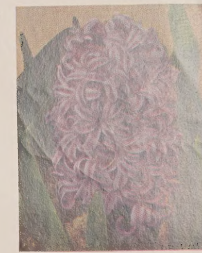
KING OF THE BLUES