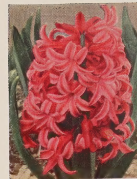
QUEEN OF THE PINKS

Our bulbs are grown in Holland and shipped to us directly from our grower. We offer only top size bulbs and varieties which have proven as the best in their class for color, form and hardiness.