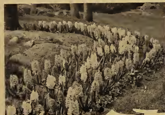
Extra-selected Exhibition Hyacinths

Tulips should be planted 5 to 6 inches deep, not less than 5 inches apart, in deep, fertile soil. A half inch of sand beneath any bulb amply repays the trouble, providing drainage during wet weather.