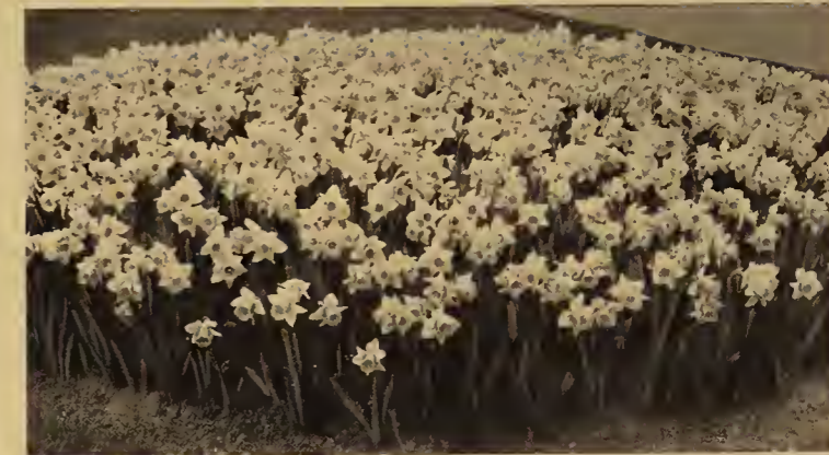
Bed of Large-trumpet Narcissus