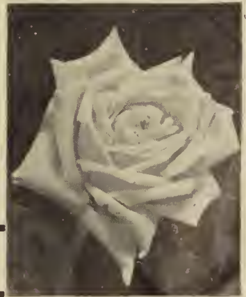
Mme. Jules Gravereaux