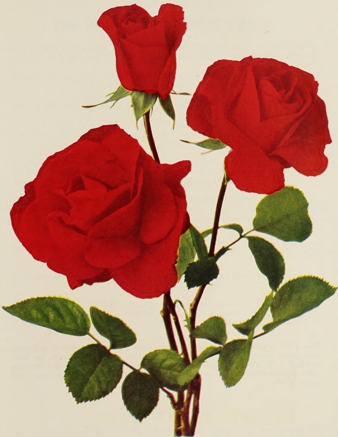
Carrousel Pat. 1066 (Described preceding page)