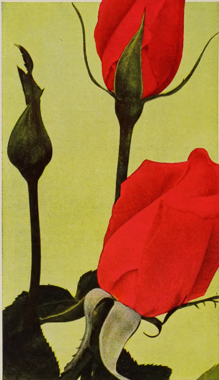
Charlotte Armstrong Pat. 455 (Described Page 3)