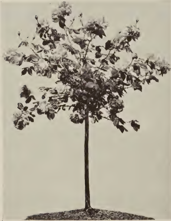
The Tree Rose as an Accent Item in the Garden