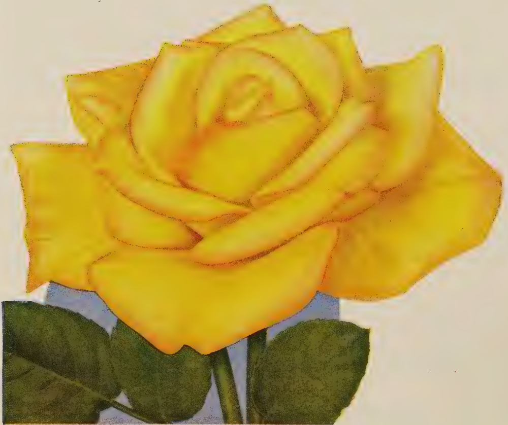
Fred Howard Pat. 1006 (Described Page 8)