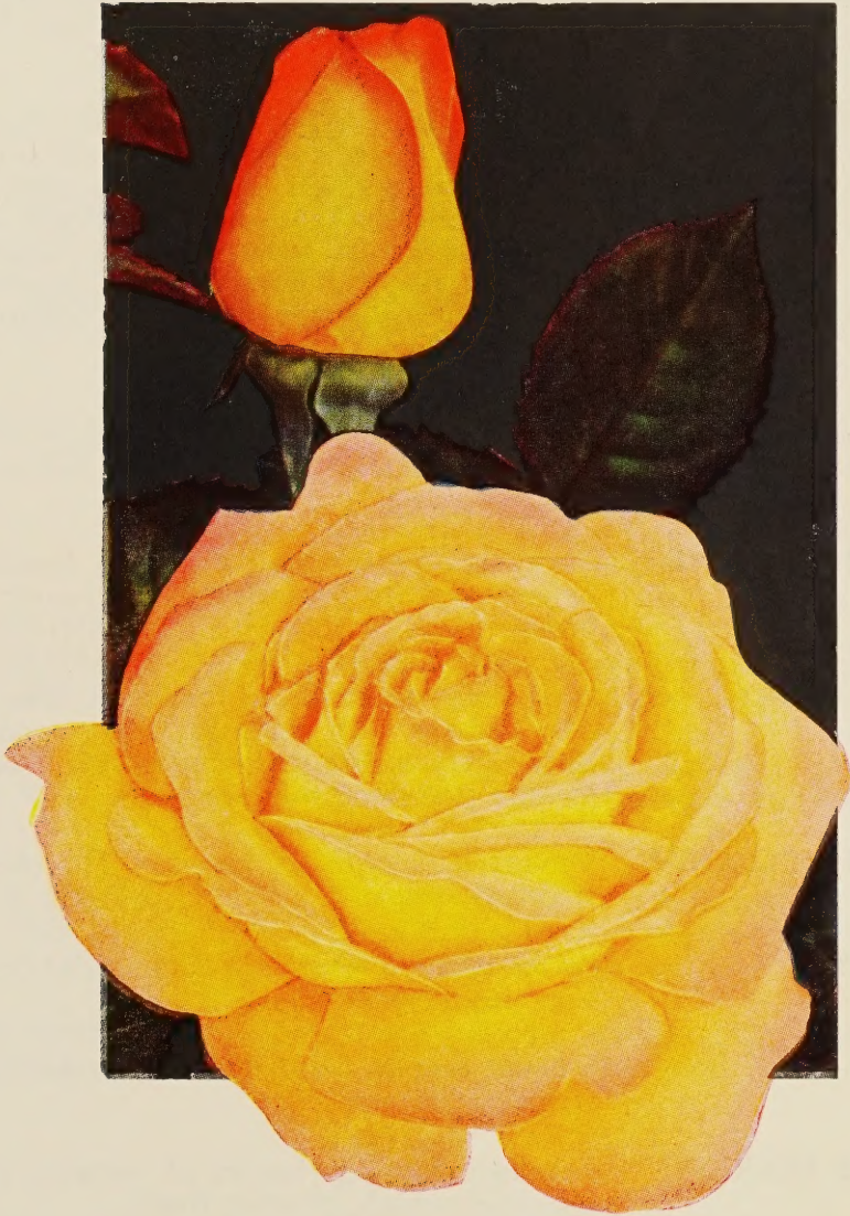
Peace Pat. 591 (Described Page 9)