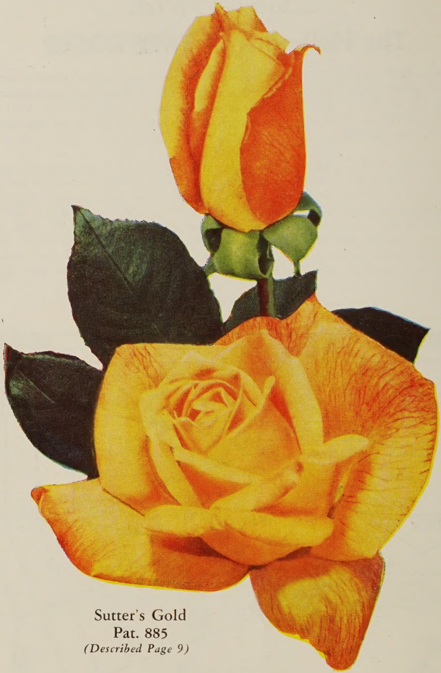
Sutter's Gold Pat. 885 (Described Page 9)