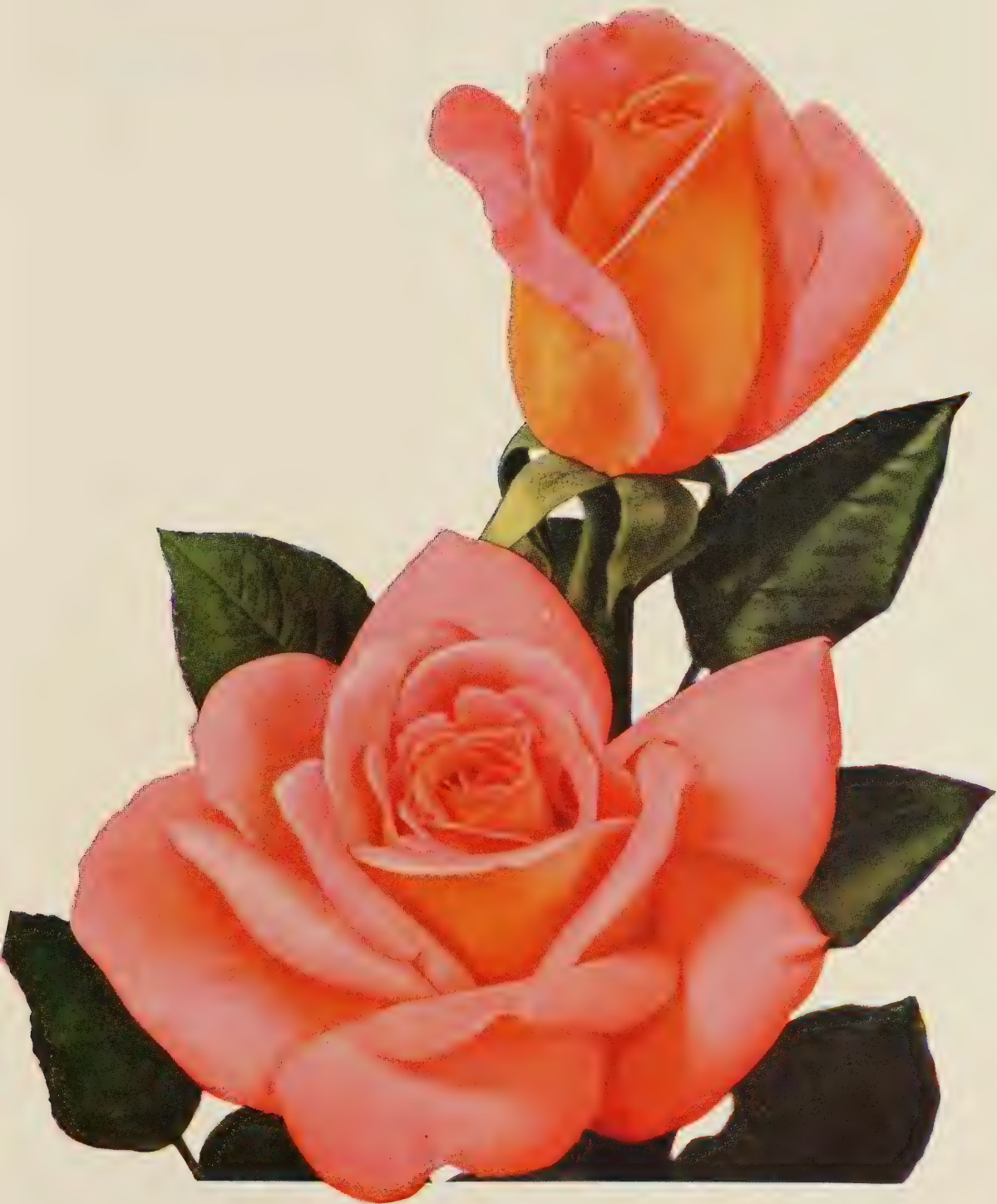
Helen Traubel Pat. 1028 (Described Page 7)