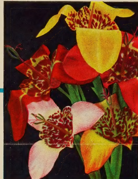
TIGRIDIA, MIXED COLORS. 25 for $1.90