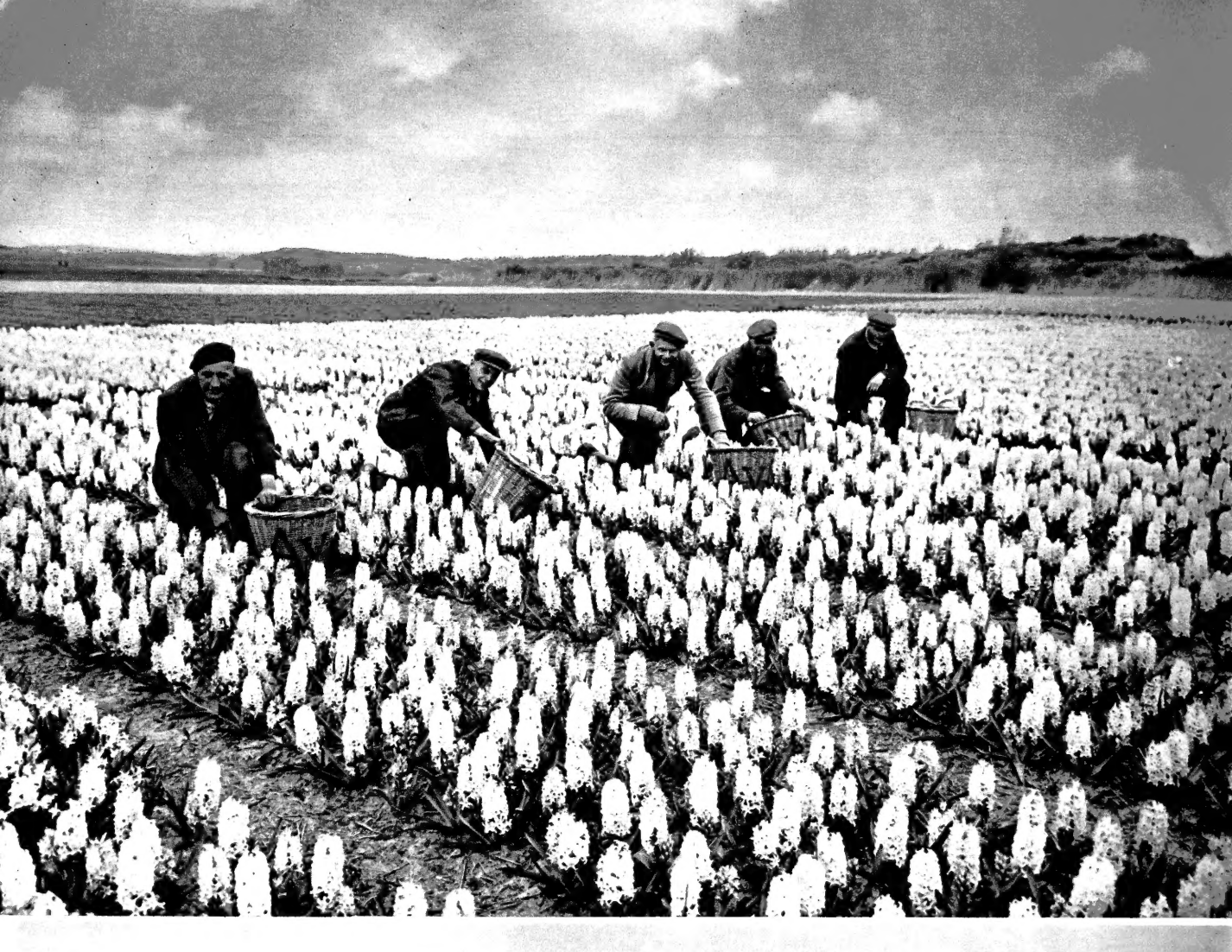
Our Hyacinths are grown on pure sandy soil. We produce them by the million.