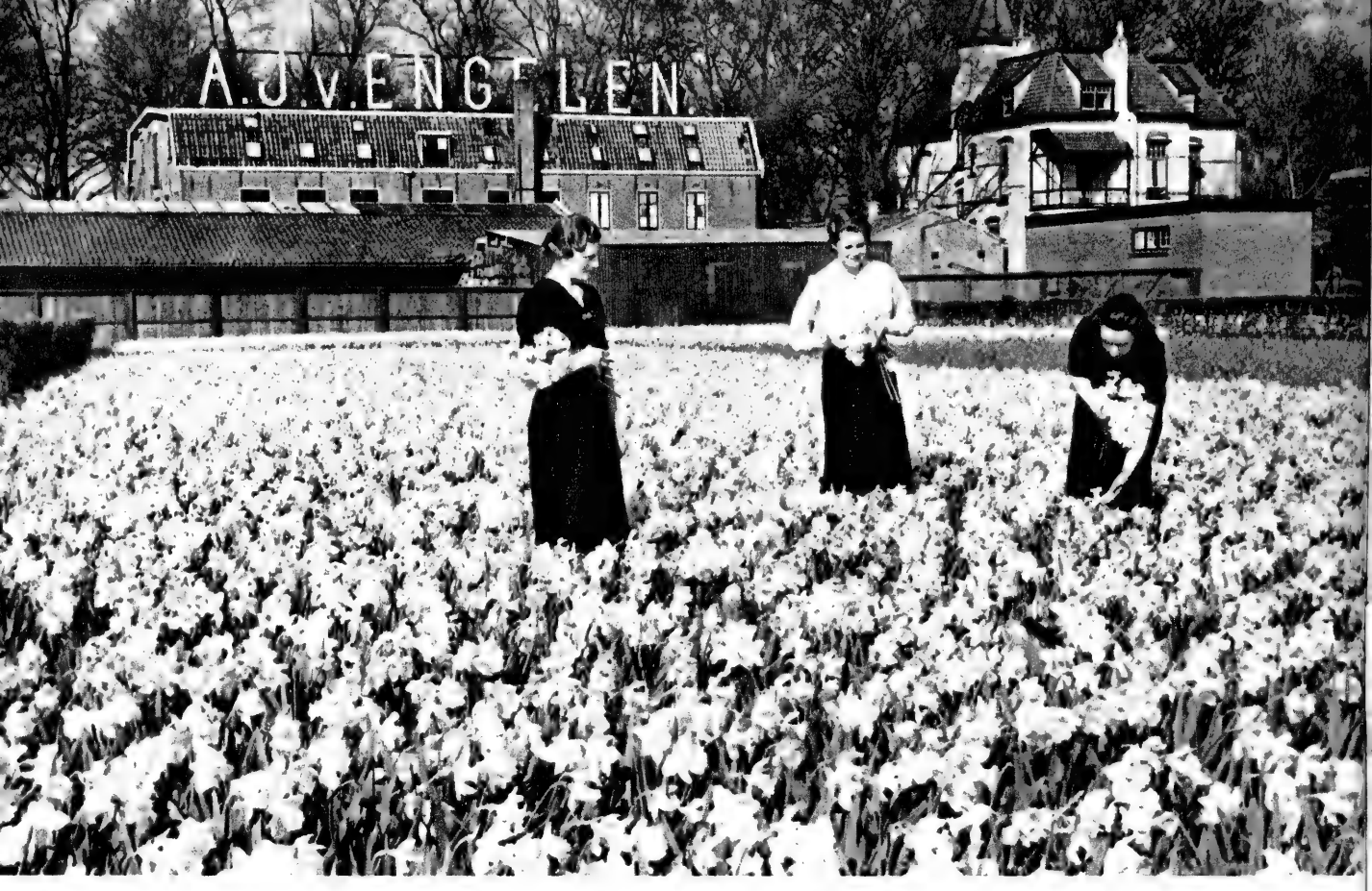
"Springtime in Holland". Datfodils King Alfred in full bloom