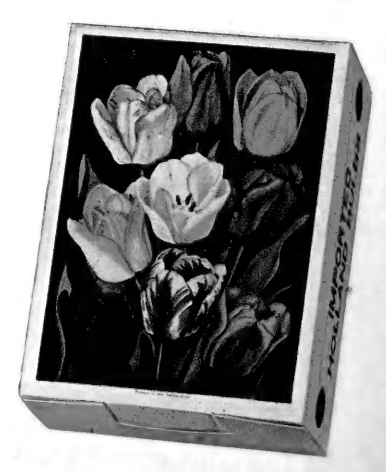
OUR PARROT SPECIAL

We also have attractive packages with beautiful Parrot tulips, a mixture of 4 of the finest varieties.