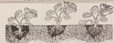
Too Deep Too Shallow Just Right