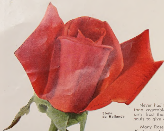
Etoile de Hollande

"To Cultivate a Garden is to Walk with God" - Bovee