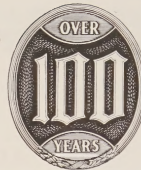
OF FAIR DEALING

"To Cultivate a Garden is to Walk with God" - Bovee