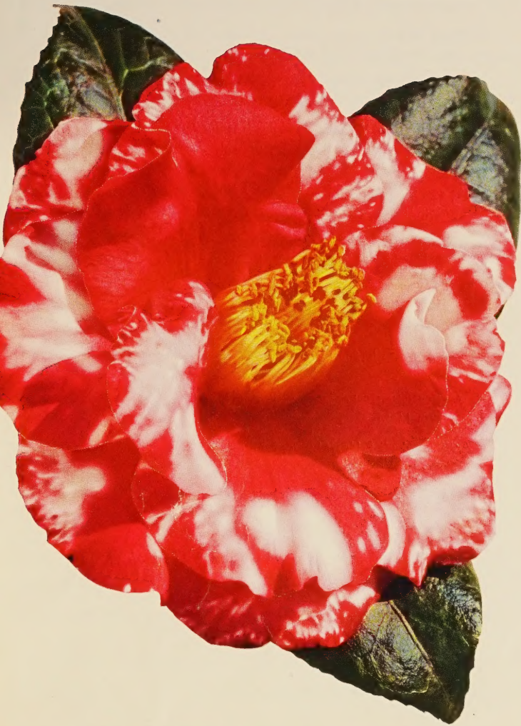
ADOLPHE AUDUSSON VARIEGATED

This list briefly describes only a small portion of the standard and rare varieties which we have growing in our nursery.