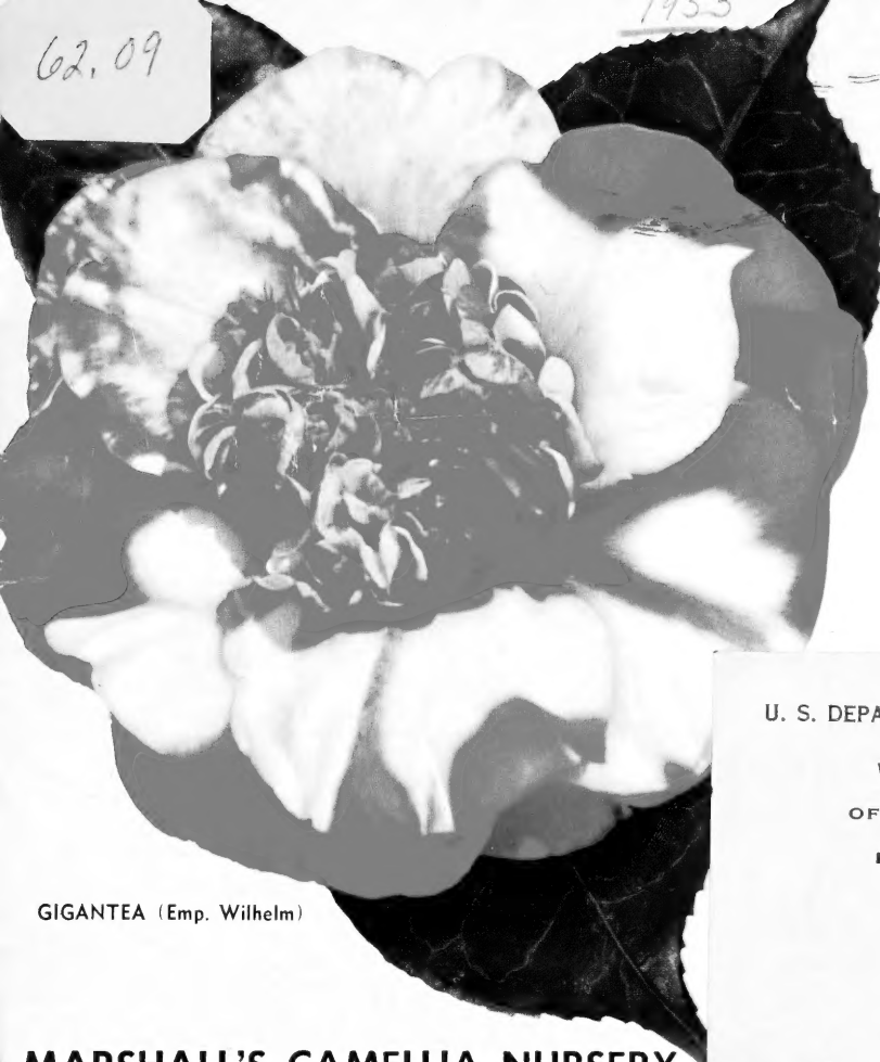
GIGANTEA (Emp. Wilhelm)

LIBRARY RECEIVED ★ MAY 11 1953 ★ U. S. Department of Agriculture