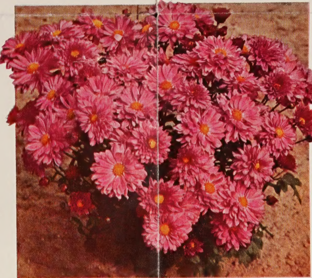
Pink Cushion Mum

MOST POPULAR MUM COLLECTION 1 each of 8 varieties (unlabeled) .$.325 3 each of 8 varieties (24 labeled) $.675