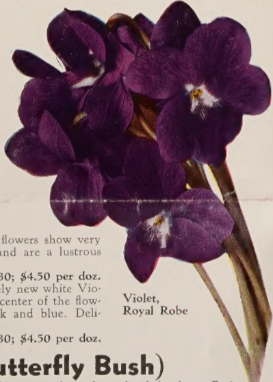
Violet, Royal Robe

For summer blooming and continued blossoms through early fall, these Buddleias are unsurpassed, either for show in the garden or for use as cut flowers. They grow 3 to 4 feet high and the sweet fragrance attracts quantities of beautiful butterflies. BONFIRE. Hardy Butterfly Bush of rich dark red, with pleasing deep green foliage. Ideal for cut flowers, as well as an ornamental shrub. Flowers from midsummer until frost. Each 75c; 3 for $1.75 DUBONNET. A lovely shade of wine-red, of erect growth and long stemmed. A fine, late summer cut flower and an entirely new color in Buddleias. Each 75c; 3 for $1.75 ORCHID BEAUTY. Soft orchid-purple, with brilliant orange eye. Strong growing plants with good keeping qualities and ideal as cut flowers. Claimed to be the best known Buddleia. Each 75c; 3 for $1.75 PINK DAWN. Flower pink throughout, producing a great abundance of blooms and deep green foliage. Excellent cut flower. Best truly pink-flowering Buddleia known today. Each 75c; 3 for $1.75 WHITE QUEEN. Startling new glistening white Buddleia with hardy, 8-inch spikes. "All-out-at-once" blooms. Fine for cut flowers and excellent shrub. Blooms from July until frost. Very fragrant. Each 75c; 3 for $1.75 SPECIAL: Our choice, all varieties mixed, $3.50 per doz.