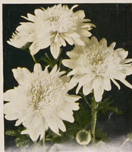
Mt. Shasta Daisy

1 each of the above varieties, 4 plants (unlabeled) $2.45 3 each of the above varieties, 12 plants (labeled) 6.25 6 each of the above varieties, 24 plants (labeled) 11.75