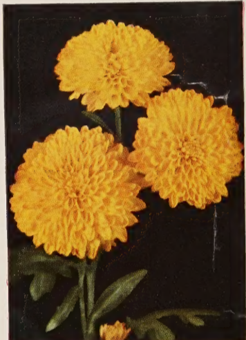
Charles Nye Pompon Mum