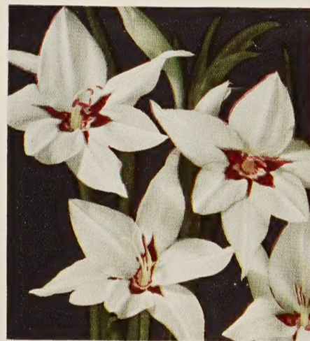
Acidanthera Bicolor Murielae

White with maroon center. Smells like a Tuberose, grows like a Gladiolus. Looks like an Orchid. Although not a true Glad, this novelty resembles them very closely and should be handled in the same manner. Blooms in August and is another ideal cut flower. $1.10 per doz.; $1.95 per 25; $3.75 per 50