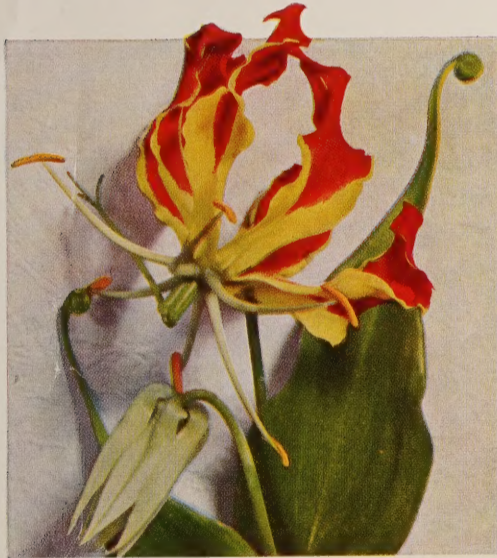
Climbing Lily (Gloriosa Rothschildiana)

A splendid low climber, this relative of the Lily family is easily grown in the garden and does well in sheltered spots out-of-doors. It can be started indoors early in the year and blooms in the late summer. The flowers open to a bright yellow and red and change to a deep scarlet. A most unusual and rare garden bulb. Tubers are stored like Gladioli during the winter, and replanted year after year. Each $1.65; 3 for $4.50