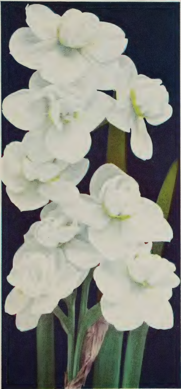
CHEERFULNESS. See page 22. Available in White or Yellow.