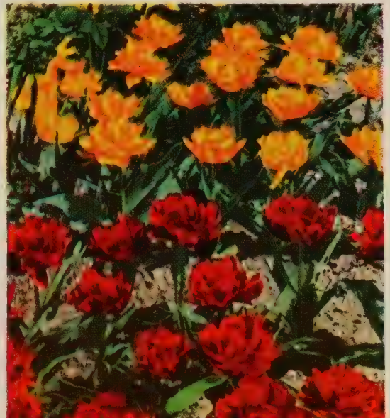
DOUBLE EARLY TULIPS