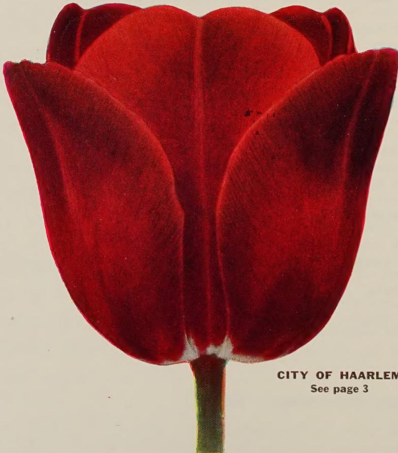
CITY OF HAARLEM See page 3