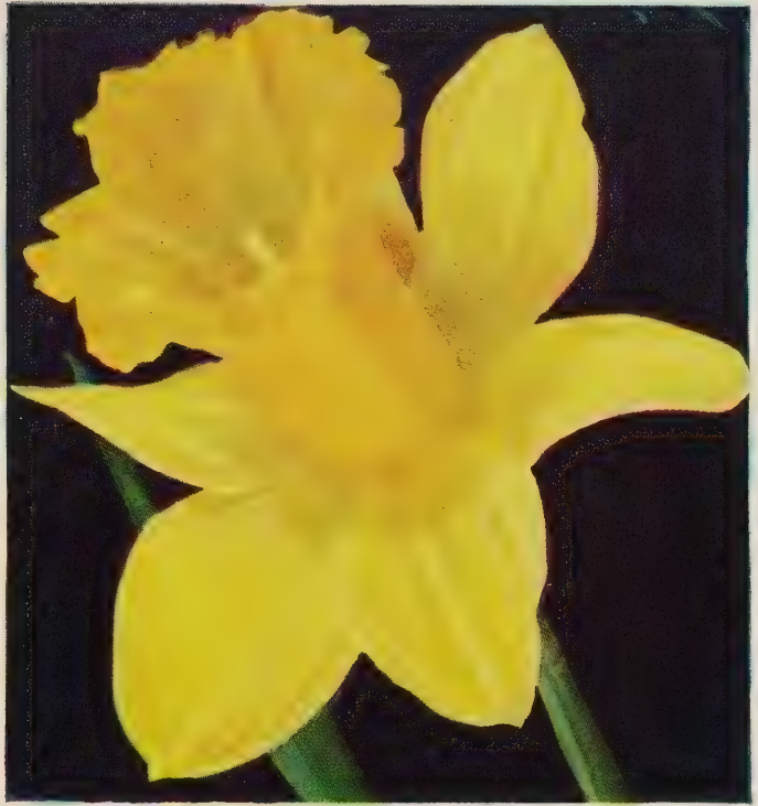
INSURPASSABLE NARCISSUS See page 19