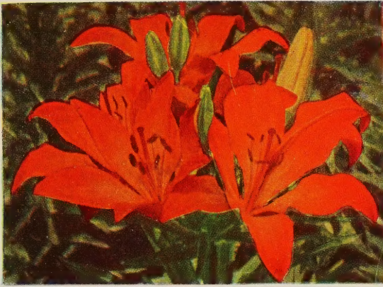
UMBELLATUM ERECTUM LILY

CANDIDUM. Madonna Lily. Snow-white, sweetly perfumed flowers. Will thrive in any light soil with plenty of light and sun. Blooms in June. 4 to 5 feet high. Each 3 12 Large ..... $0 50 $1 40 $5 00 Medium..... 35 1 00 3 50