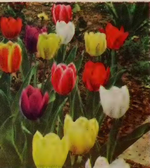
SINGLE EARLY TULIPS