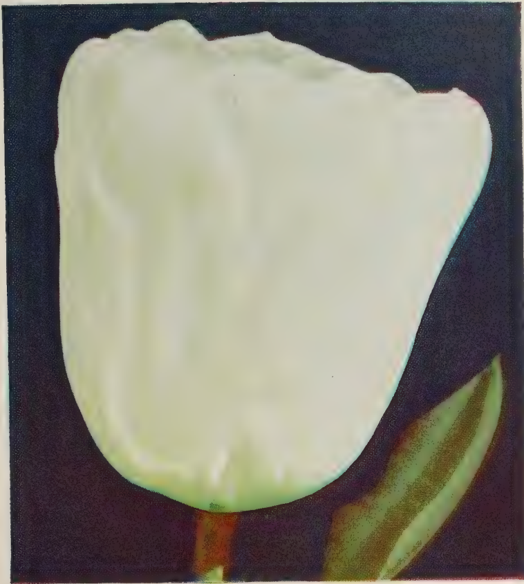
WHITE CITY. See page 8