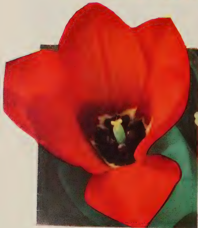
FOSTERIANA, RED EMPEROR

Praestans Fusilier. Attractive and brilliant orange-red. Often five flowers on a stem. 10". 3 for $1.00; 12 for $3.50; 100 for $23.00