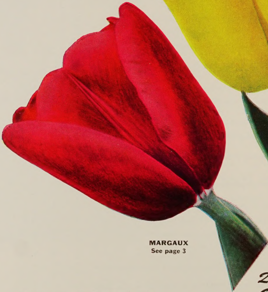
MARGAUX See page 3