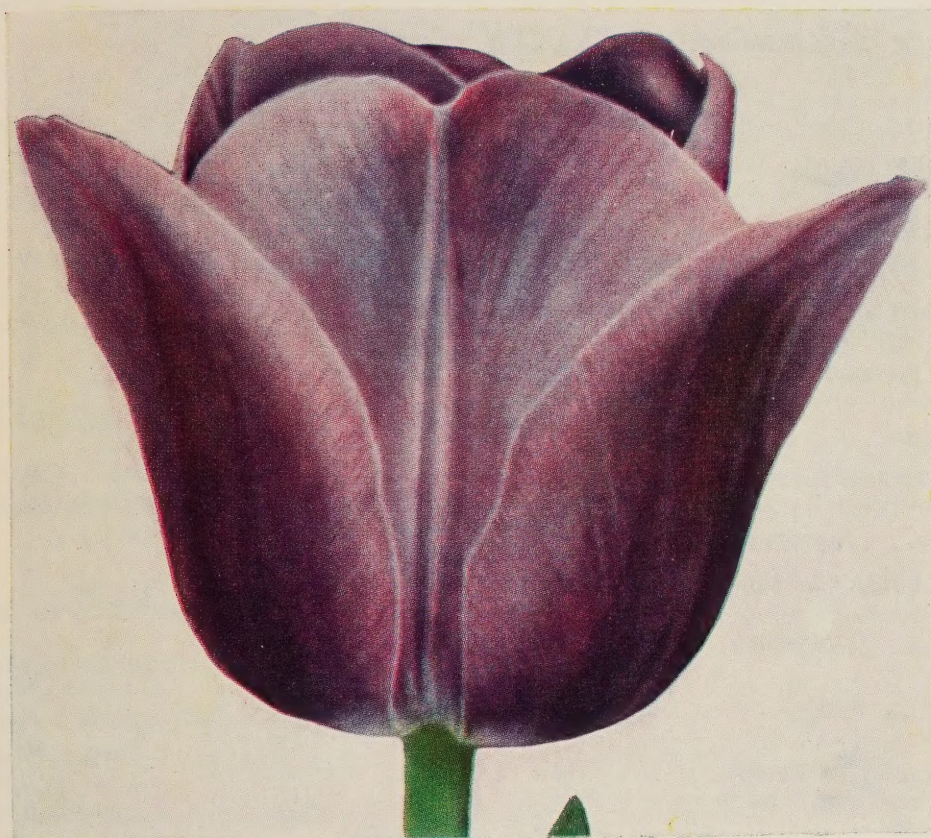
SCOTCH LASSIE. See page 7