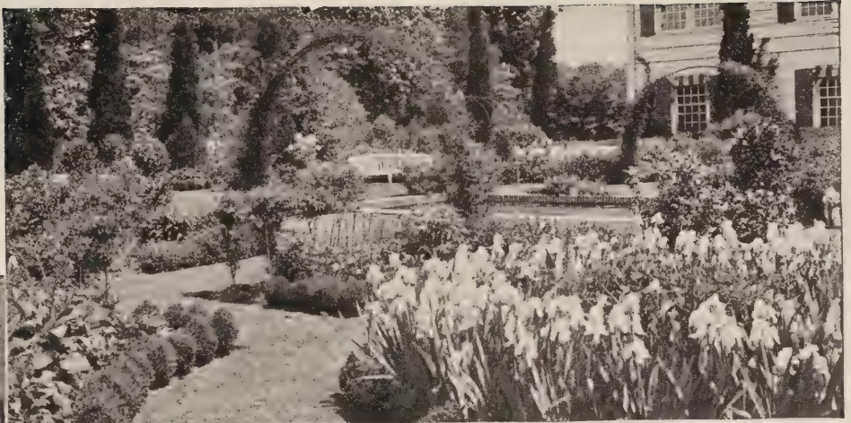
A SPRING GARDEN FEATURING IRIS