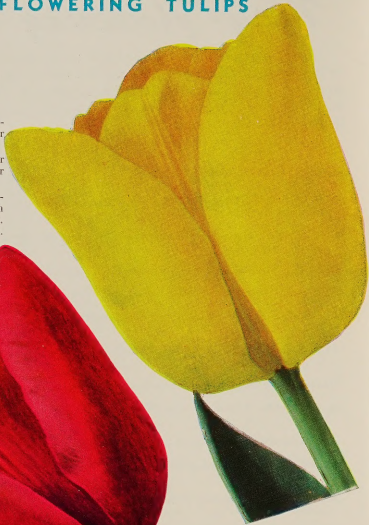
YELLOW EMPEROR See page 6

ODETTE. New Bunch-flowering Tulip of pale yellow with narrow margin of light red. 26". 3 for $2.00; 12 for $7.00.