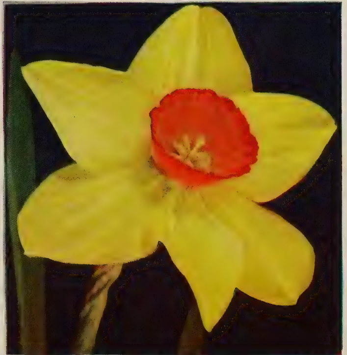
SCARLET ELEGANCE See page 19