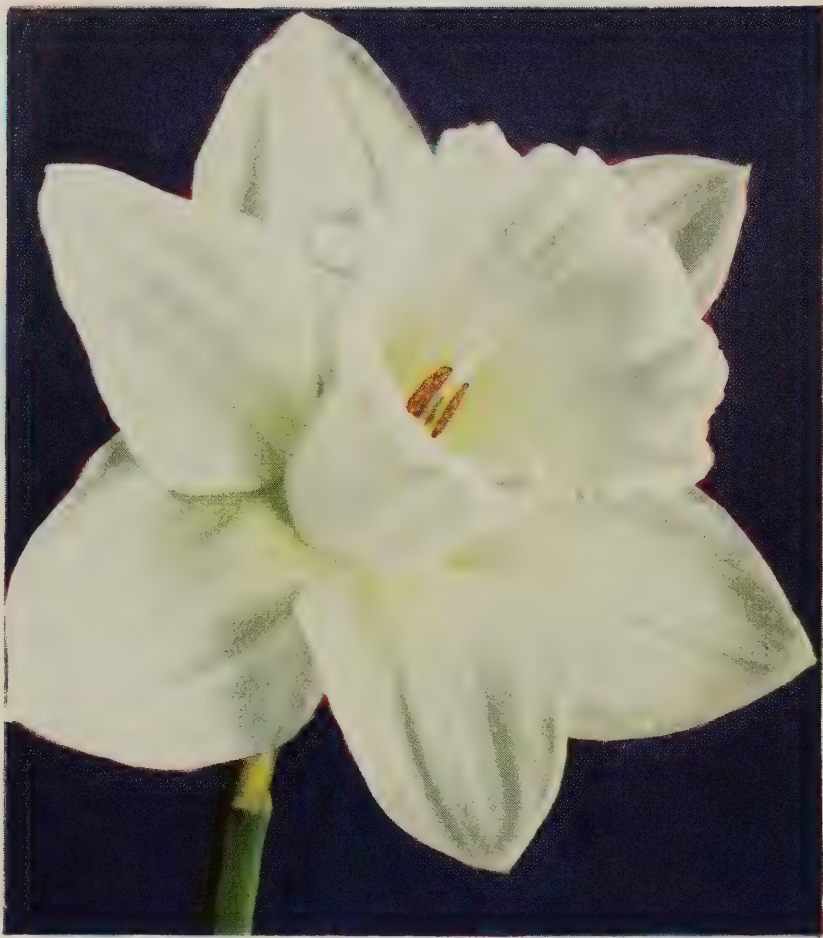
MT. HOOD See page 19