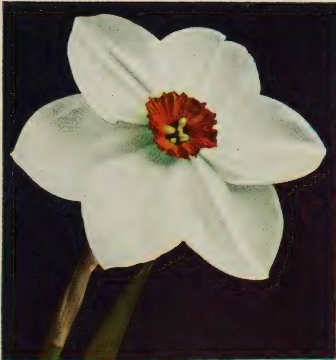
ACTAEA NARCISSUS See page 19