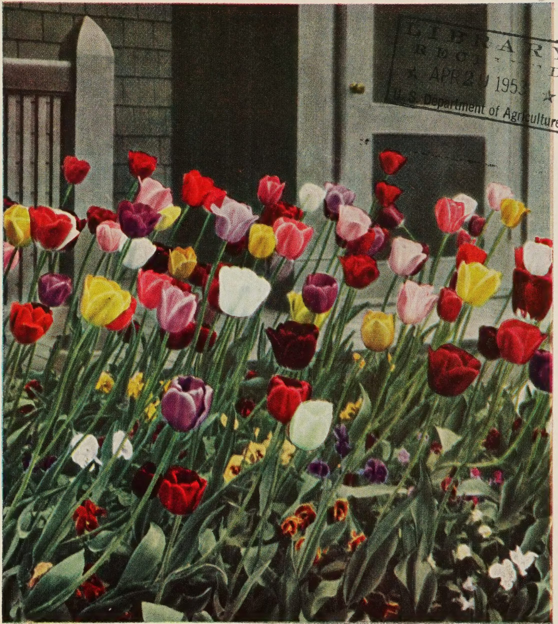
RAINBOW MIXED TULIPS. See page 12