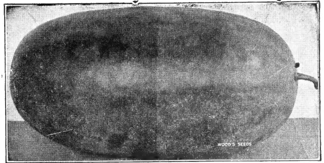
Leesburg Wilt-Resistant Watermelon