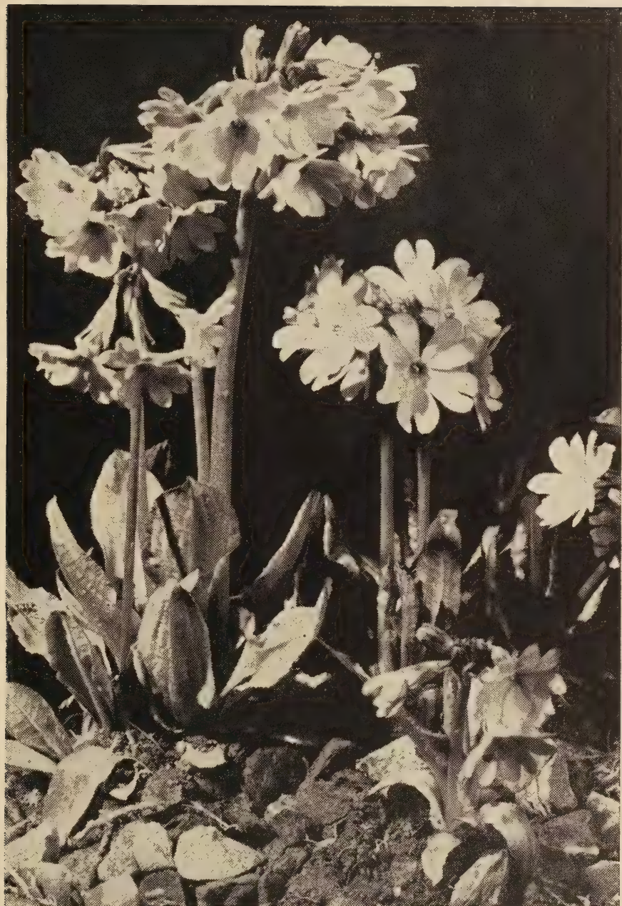
The brilliant carmine-pink P. rosea "Delight" from glacial slopes of the Himalayas.