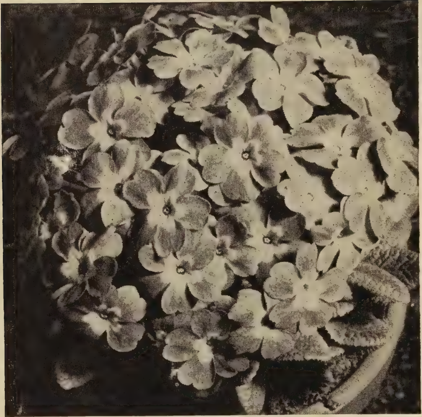
Cushion form Juliana

Of these pixie primroses it might be said they are like eager puppies running about on stoloniferous roots, wiggling in and out of borders, onto paths and into gardeners' hearts. They spread with the years and cover themselves with bloom from late winter to late spring. Dime-size blooms they are — the dollar-size wouldn't fit these plants — but there are those who like them better, which is as well.