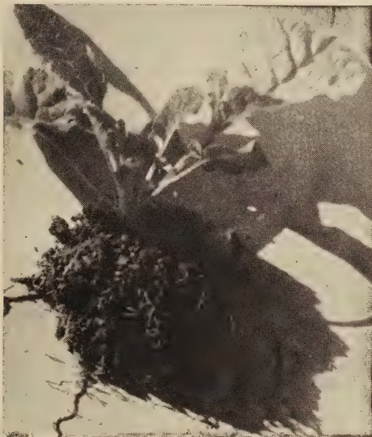
Transplanted seedling approximately one-half shipping size.

As famous as our primroses is our ability to put these young plants on your doorstep all crisp and garden-fresh. You will find them vigorous, full-rooted, ready to give you a picture garden the spring after planting. To supply you the year around (see Regional Planting Outline, page 32), we now grow 150,000 transplants annually, all from hand-pollinated seed so that when you make your selections from the following listings you know they include new, originator's shades as well as improved standard colors, and that the size of the Polyanthus, and most of the Acaulis, is that of a silver dollar—often an expanded one.