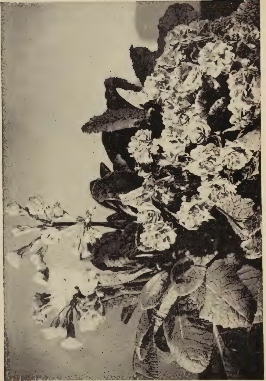
Moonlight begins bloom when Marie Crousse is in full swing.