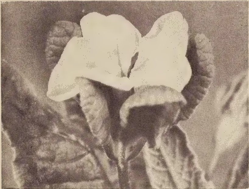
Jack-in-the-green, so named for the leader of an old Elizabethan dance.