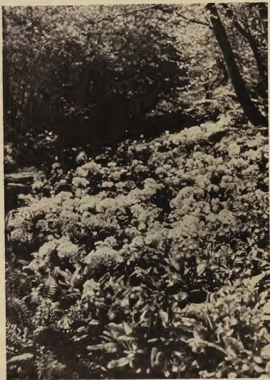
The pleasure of growing Primroses from seed culminates in garden beauty.