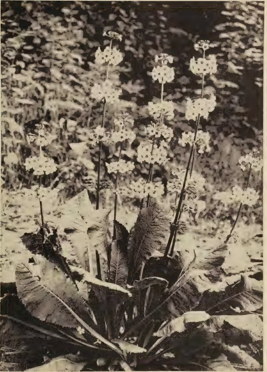
Asiatic Candelabra Primulas bloom in April, May and June.