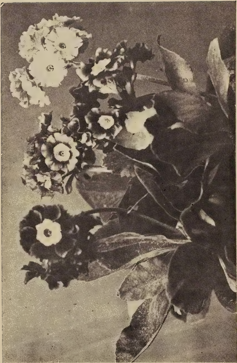
Sweetly fragrant, velvet flowered Garden Auriculas are handsome foliage plants.