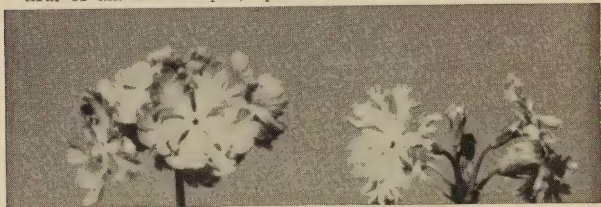
Flower detail of P. Sieboldi.

P. ROSEA 'DELIGHT' —Brilliant, carmine-pink flares from Kashmir and Afghanistan to set off the Denticulatas. One of the most beautiful of all. March-April, up to 8".