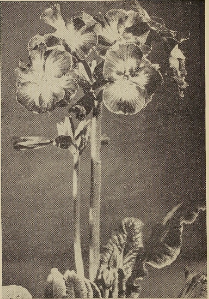
Barnhaven's Silver-Dollar Polyanthus are almost always larger than silver dollar size as this bronze from the Grand Canyon series illustrates.