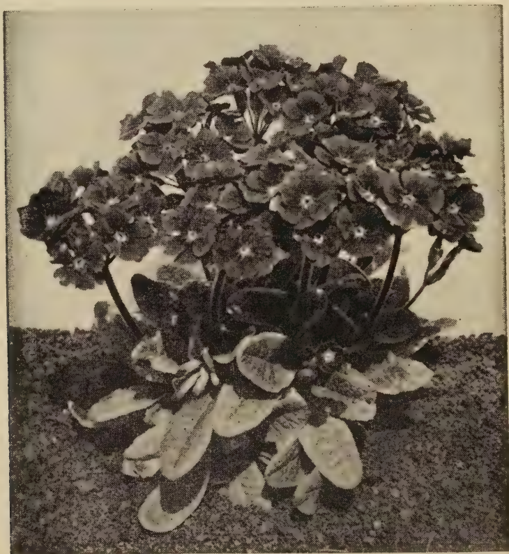
Cowichan Strain available as field plants (p. 8), transplants (p. 19) and divisions of breeding stock (p. 21).

Please name several alternate choices when ordering Asiatics.