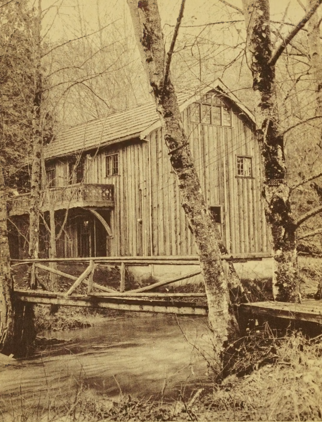
In early spring the stream hurries past the barn at Barnhaven.