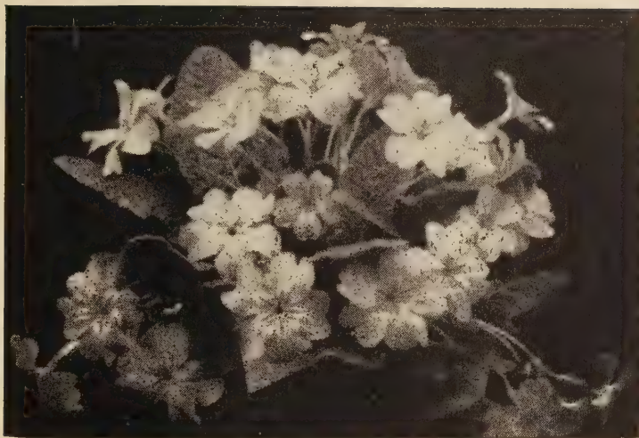
A Barnhaven Acaulis raised in Quebec.

The following large plants are: 3/$1.50; 6/$2.75; 12/$5, plus postage.