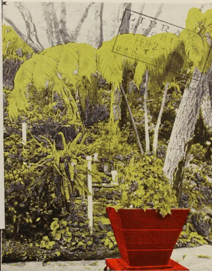
CIBOTIUM CHAMISSOI (KAULF)