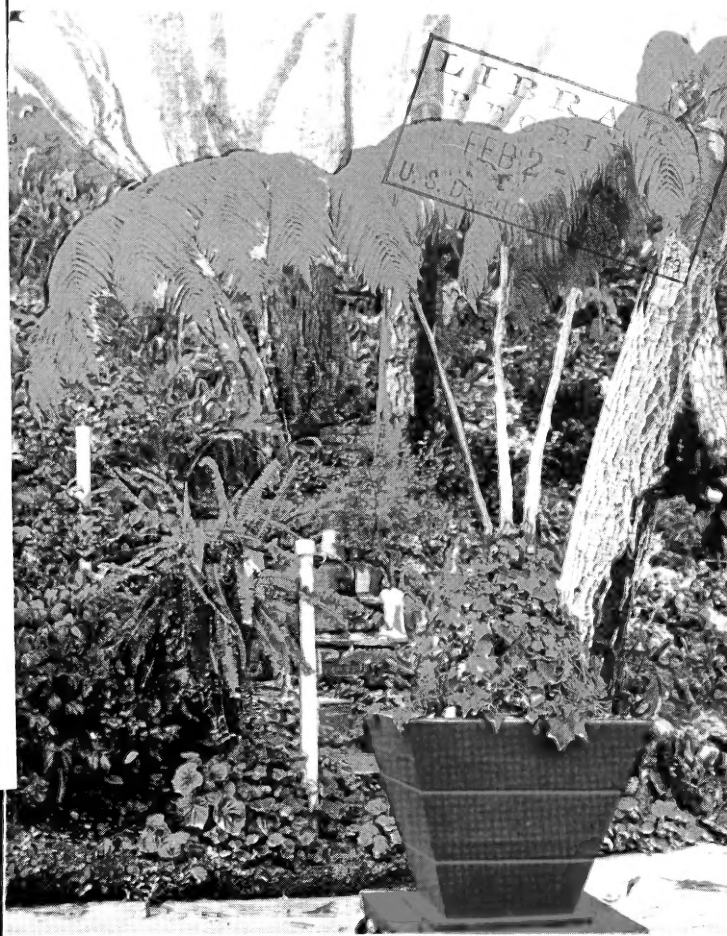
CIBOTIUM CHAMISSOI (KAULF)