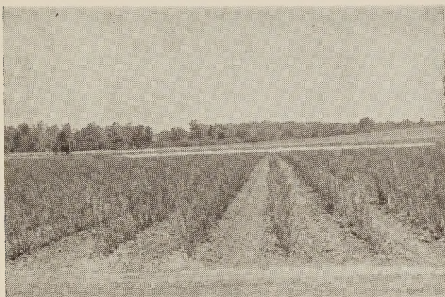
Own Root Two-Year Pink Flowering Almond