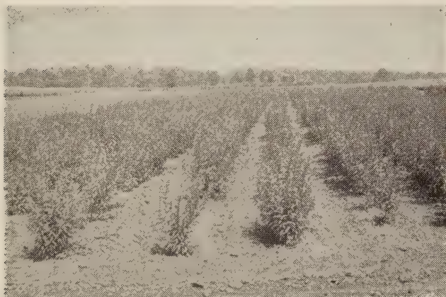
One-Year Amoor River North Privet well branched

WHERE YOUR NEEDS ARE 1,000 OR MORE WRITE FOR SPECIAL PRICES