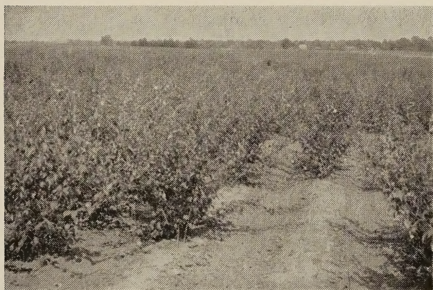
A large Block of well branched Two-Year Forsythia in Variety