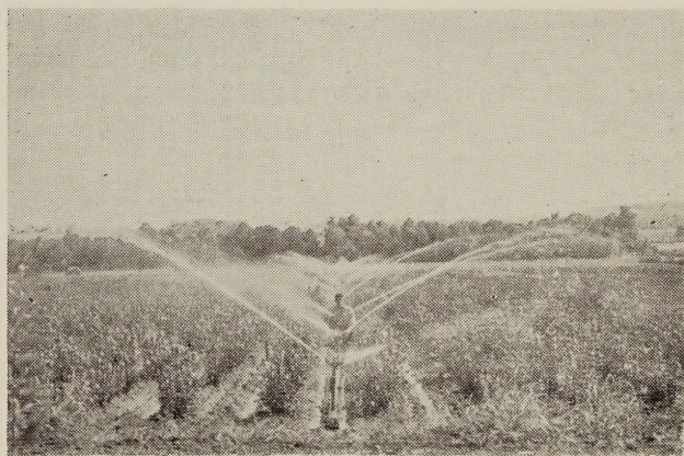
Two-Year Althea with Sprinkler System at work