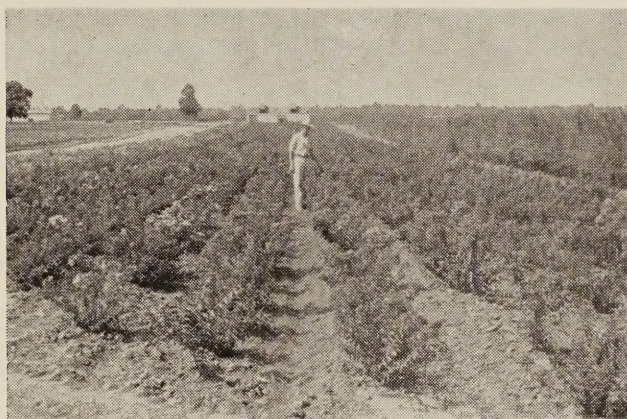
Heavily Branched Two-Year Crepe Myrtle