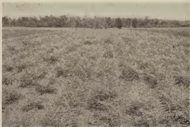
LONICERA, MORROWI—Extra Heavy Two-Year

Tatarica Rosea —Strong upright grower, flowers pink, fruit red.