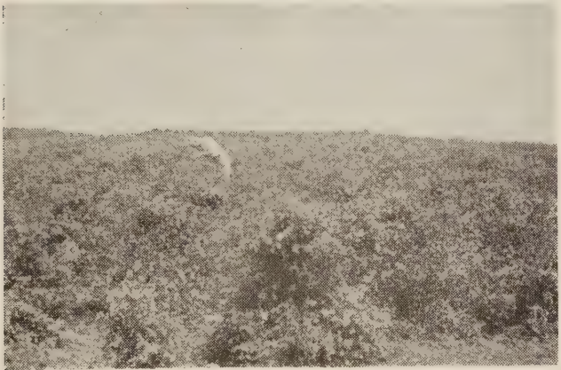
Abelia—Two-Year heavily branched, properly spaced