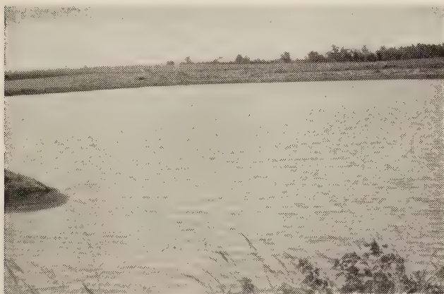
One of our Reservoirs for use with Irrigation Program

WHERE YOUR NEEDS ARE 1,000 OR MORE WRITE FOR SPECIAL PRICES