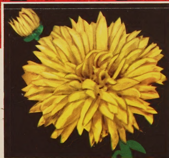
AZALEAMUM WITCHES' GOLD