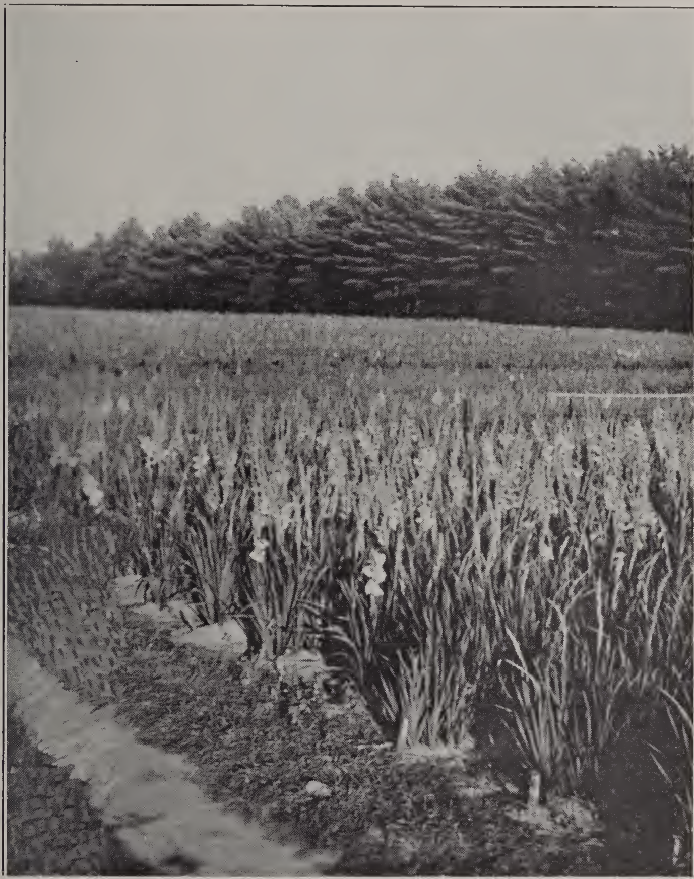
A glimpse of our field in 1936

the winner at many shows all over U. S. A vase of about a dozen spikes, at the top of our commercial exhibit, was one of the outstanding factors of the entire show. If you are not growing it now you will eventually and certainly now is a good time to get a start in it. The color is shrimp pink fading into a begonia rose with a medium sized blotch of tyrian rose. Ten 7½ inch blooms open at once are not