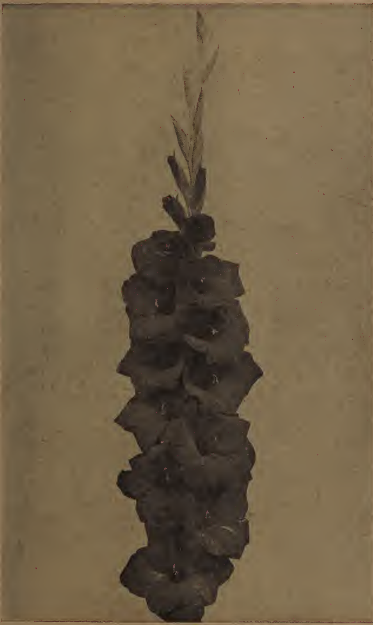
Black Opal (Errey)