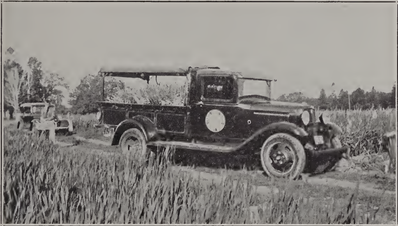
Early morning load of blooms for our local markets