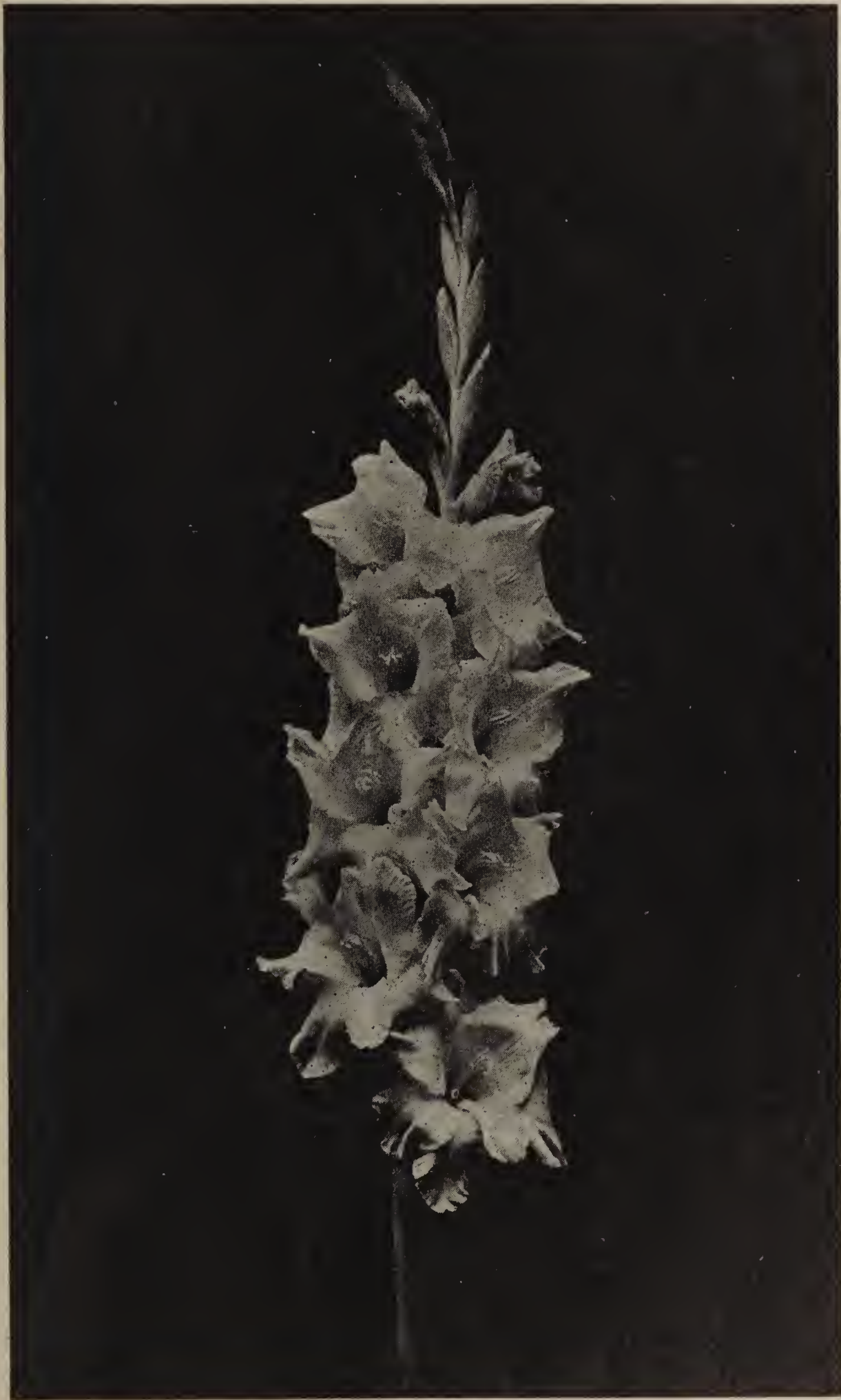
Cape Cod (Winsor) A lavender pink seedling not yet introduced