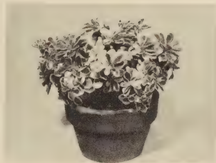
Aichryson domesticum variegated

August to November—3½ inch pots in full flower, $1.00 each.