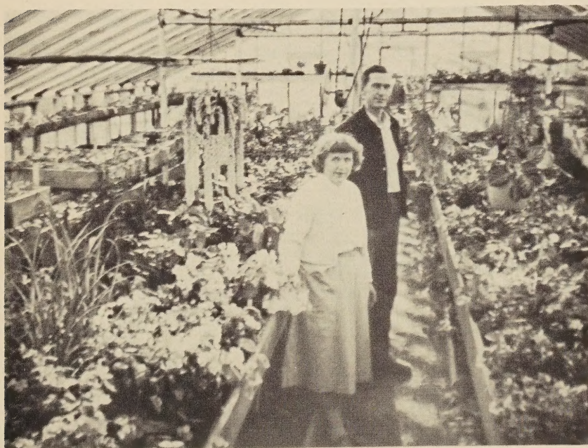
We welcome you from our begonia greenhouse