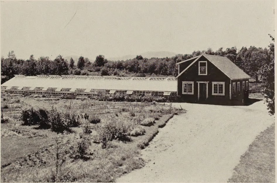
Entrance to Merry Gardens