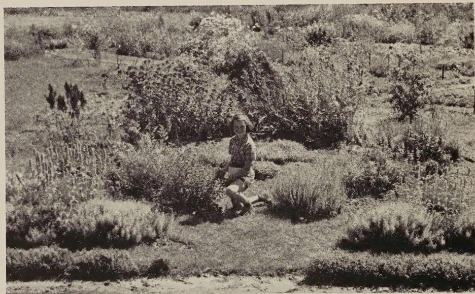
A corner of the Herb Garden