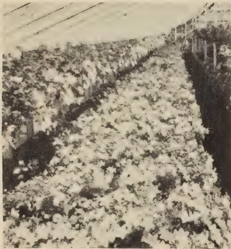
A bench of Campanula isophylla in our greenhouse

MAHERNIA verticillata (Honey Bells) —Small golden bells with the fragrance of Lily-of-the-Valley are produced in early spring and continue into the summer. Our most charming plant. .50