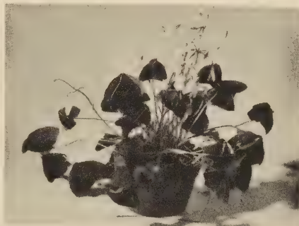
Oxalis rubra alba