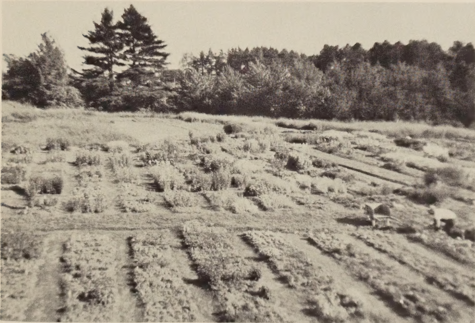
The perennial garden

Prices quoted are for the 2 1/4 - 2 1/2 inch pot size plants.