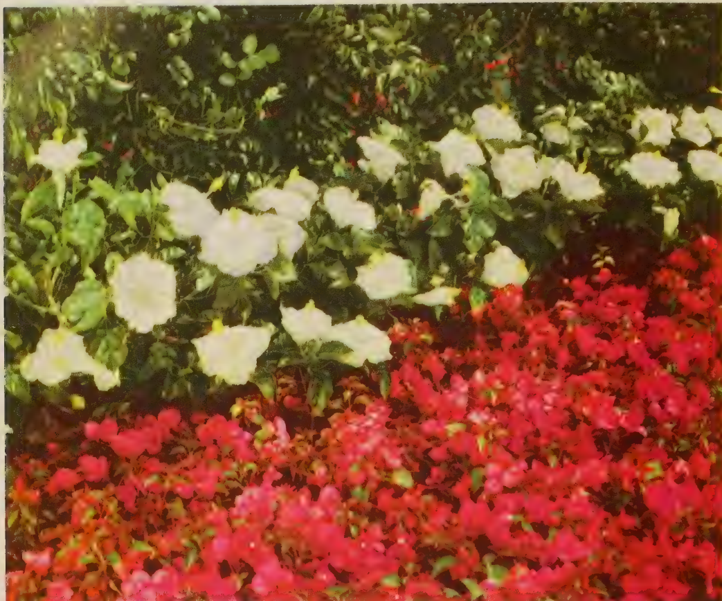
HEDGE OF BOUGAINVILLEA TEMPLE FIRE—BACKGROUND HIBISCUS BRIDE