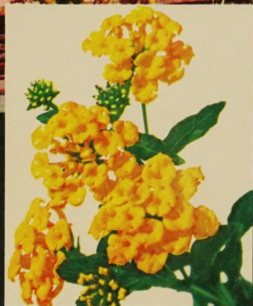
Lantana Callowiana Goldrush PATENT NO. 1211