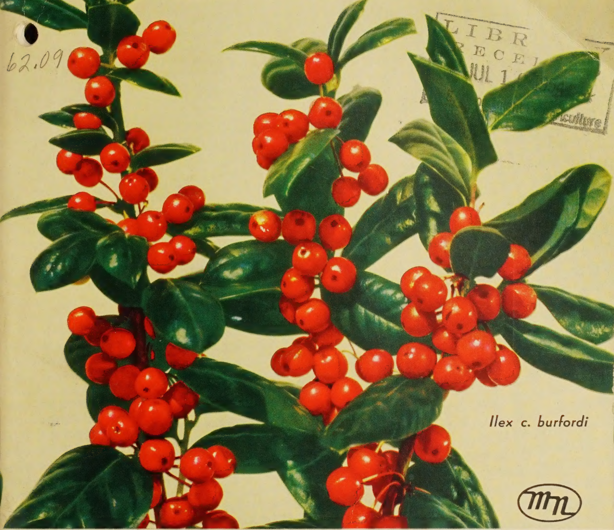
Ilex c. burfordi