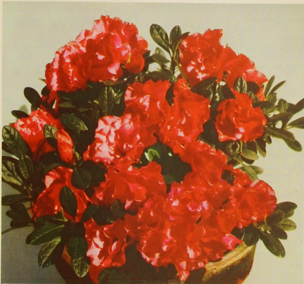
AZALEA MEMOIRE de SANDERS

Increase your Azalea profits by selling MN's choice Belgian Indica varieties. Large spectacular blooms and excellent foliage make these varieties most popular. Order MN's Belgian Indicas now for forcing, landscaping and growing-on.