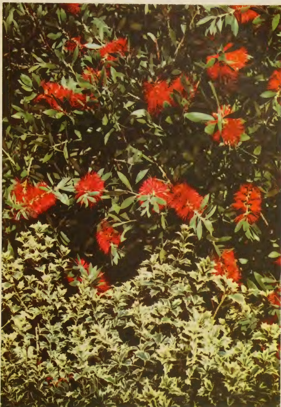
CALLISTEMAN LANCEOLATUS AND OSMANTHUS ILLICIFOLIUS VARIEG.

2¼" Pot 1-Gal. 5-Gal. CHOISYA ternata. Mexican Mock Orange (7) ..... .17½ .50 1.75 A very fine, hardy evergreen shrub with glossy, green leaves of three leaflets each, and fragrant, white flowers in a showy cluster. Specimens densely globular. Sun or shade. B & B 15" ..... 1.85