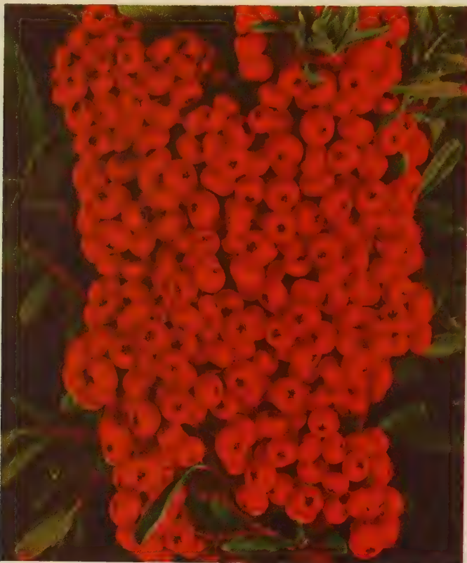
PYRACANTHA ROSEDALE (TRADE MARK REGISTERED)