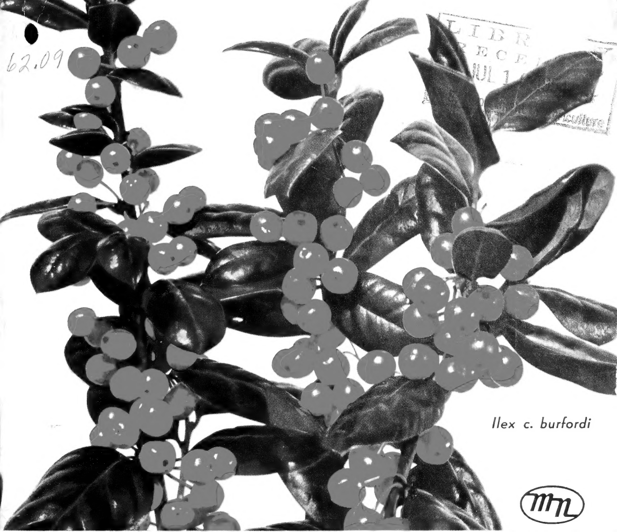
Ilex c. burfordi