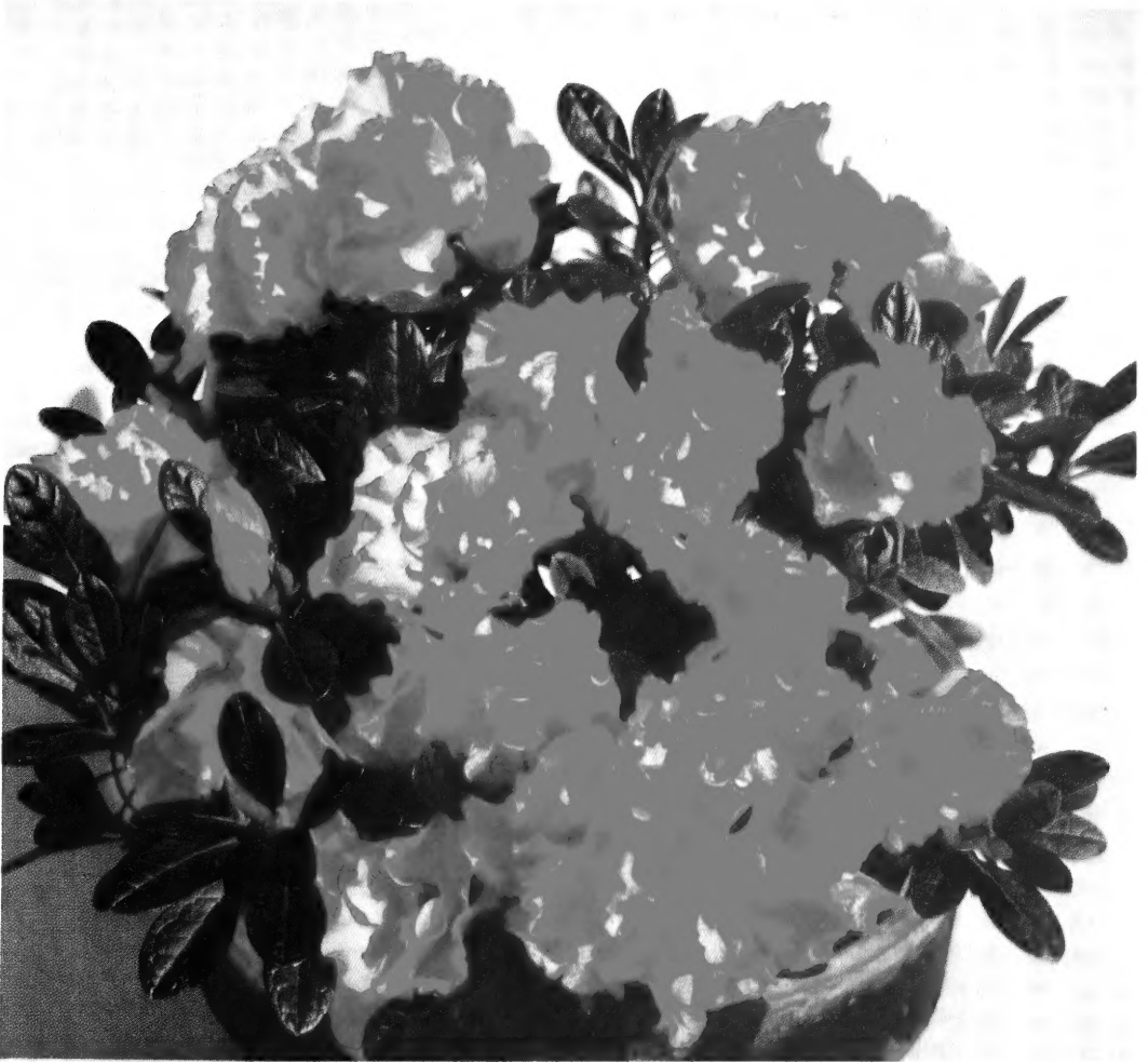
AZALEA MEMOIRE de SANDERS

Increase your Azalea profits by selling MN's choice Belgian Indica varieties. Large spectacular blooms and excellent foliage make these varieties most popular. Order MN's Belgian Indicas now for forcing, landscaping and growing-on.