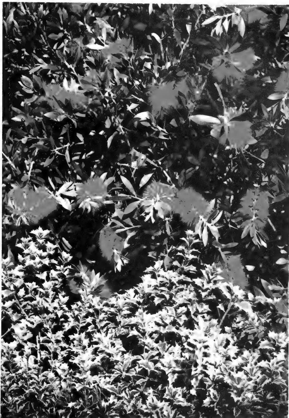
CALLISTEMAN LANCEOLATUS AND OSMANTHUS ILLICIFOLIUS VARIEG.