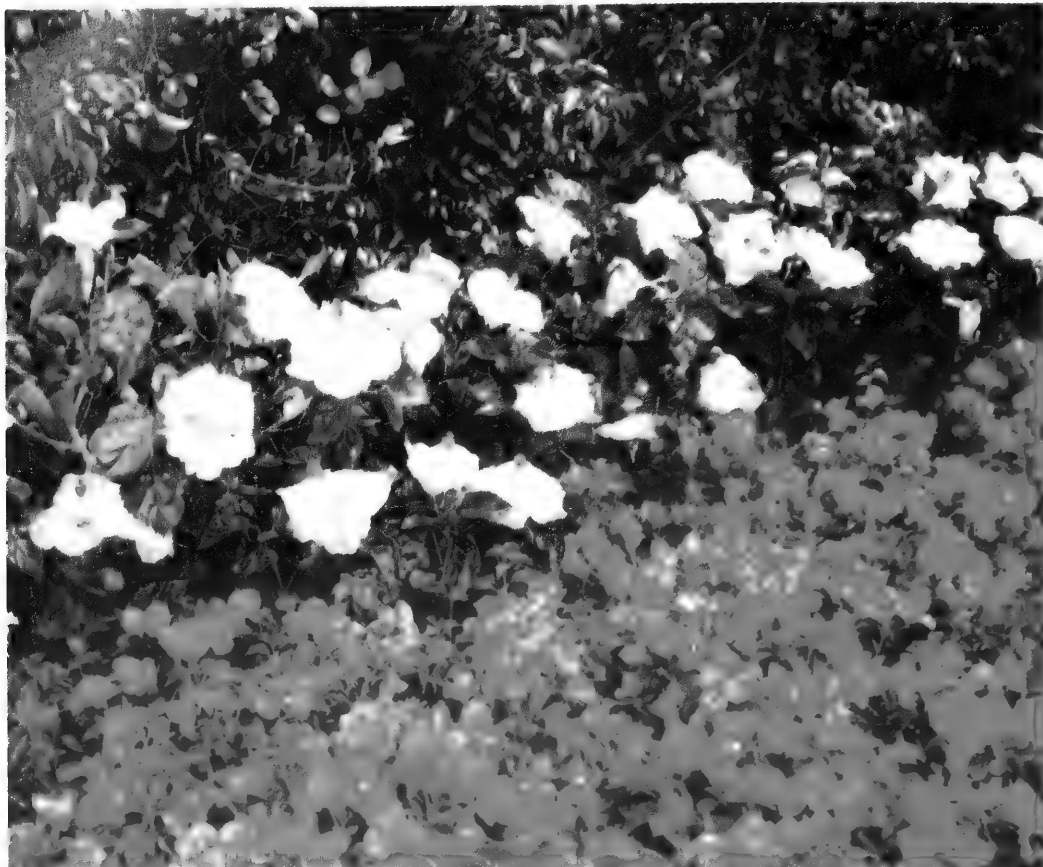
HEDGE OF BOUGAINVILLEA TEMPLE FIRE—BACKGROUND HIBISCUS BRIDE