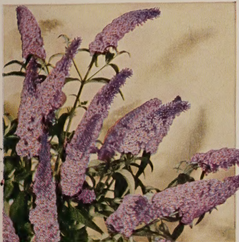
Orchid Beauty, Buddleia

SPECIAL: Our choice, all varieties mixed, doz., $3.75.