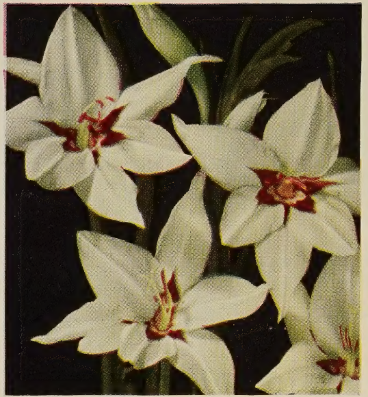
Acidanthera Bicolor Murielae

$1.15 per doz.; $2.00 per 25; $3.85 per 50