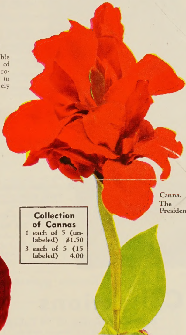
Canna, The President