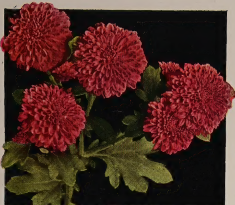
Ronnie, Button Mum

Mixed Chrysanthemums. All varieties, all colors. Our choice, 6 for $1.25; $2.25 per doz., unlabeled.