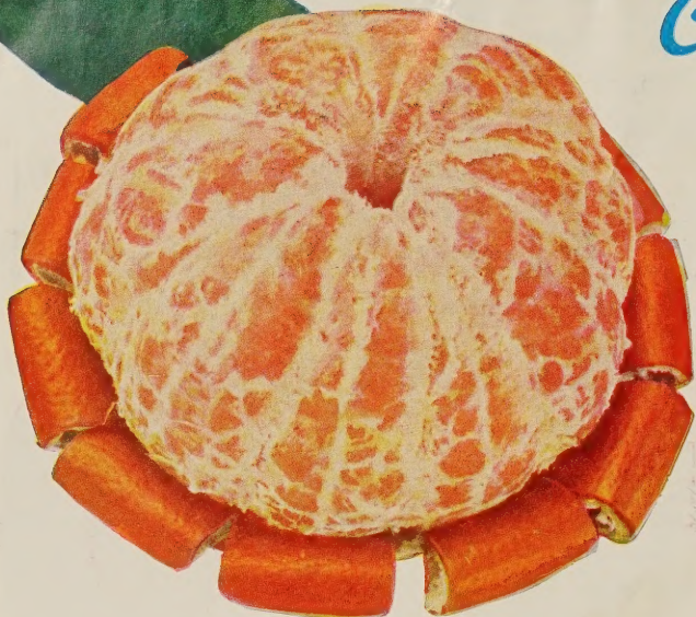
OWARI SATSUMA ORANGES