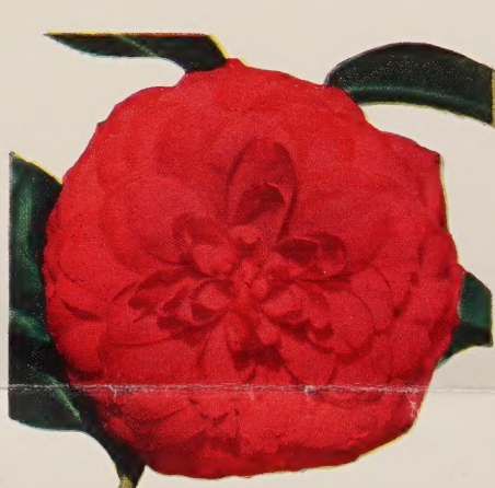
POPE PIUS IX