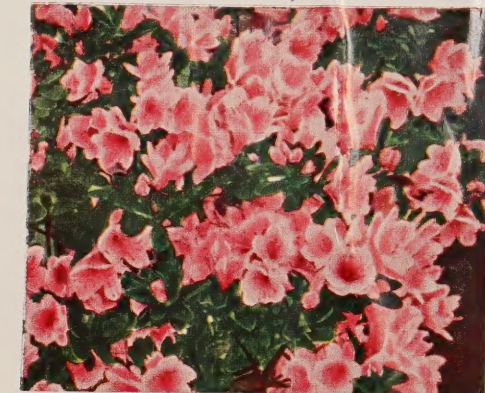
KURUME AZALEA, CORAL BELLS

Wight's Azaleas are strong, vigorous plants ready to go in their permanent location in your garden. Properly planted, they will grow off well and give you a wealth of bloom right from the start. They are not to be confused with liners, which should not be planted in their permanent location for two years.