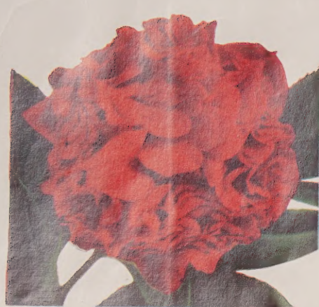
PROF. C. S. SARGENT