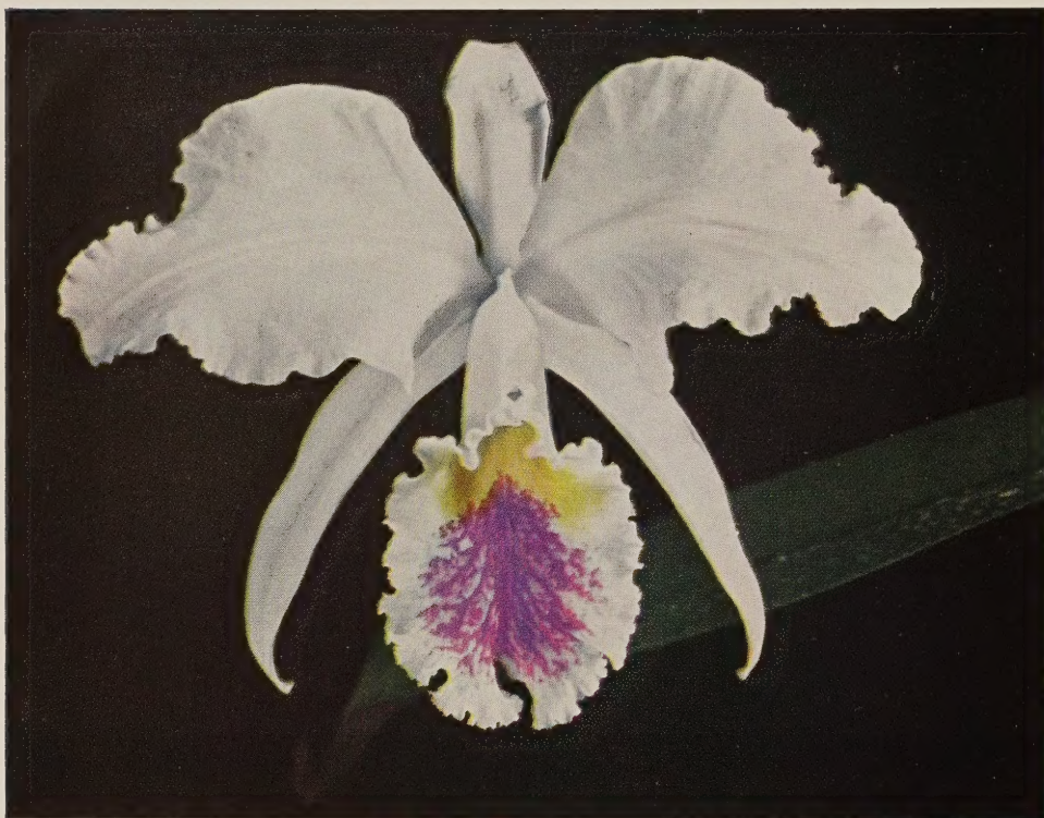
CATTLEYA ENID ALBA