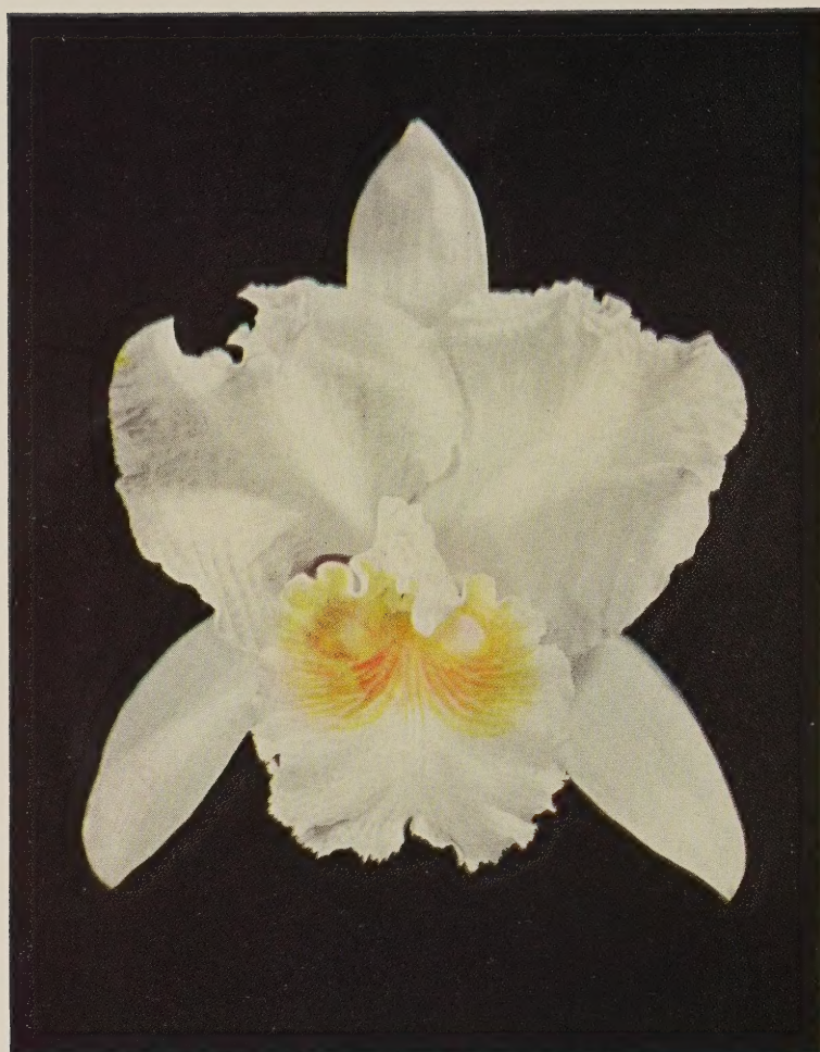
CATTLEYA ESTELLE ALBA