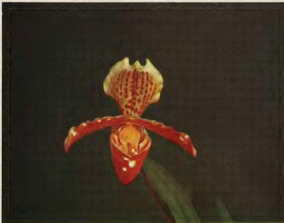
CYPRIPEDIUM INSIGNE—HAREFIELD HALL TYPE