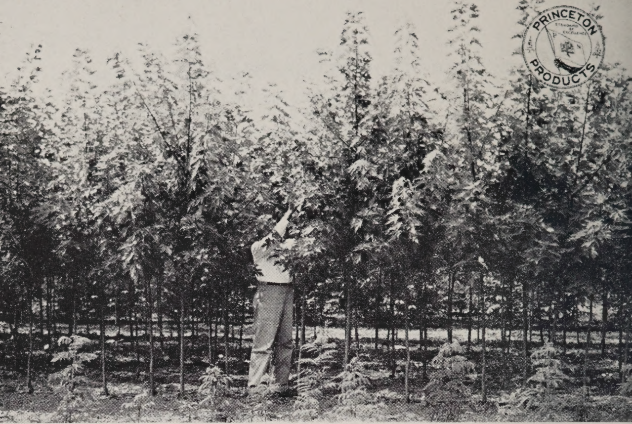
ACER dasycarpum—Silver Maple. Note the straight, clean trunks and the excellent top development. Our prices are reasonable.