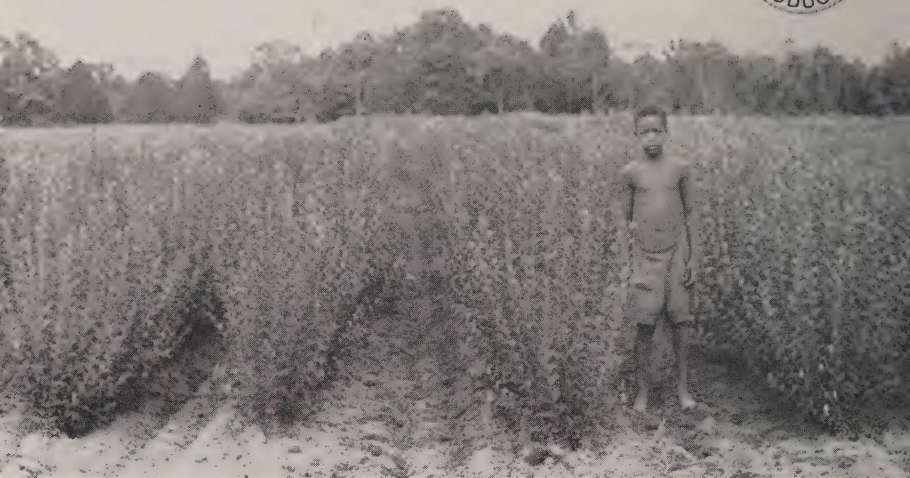
LIGUSTRUM ovalifolium—California Privet. Our Privet is well grown and has plenty of branches.