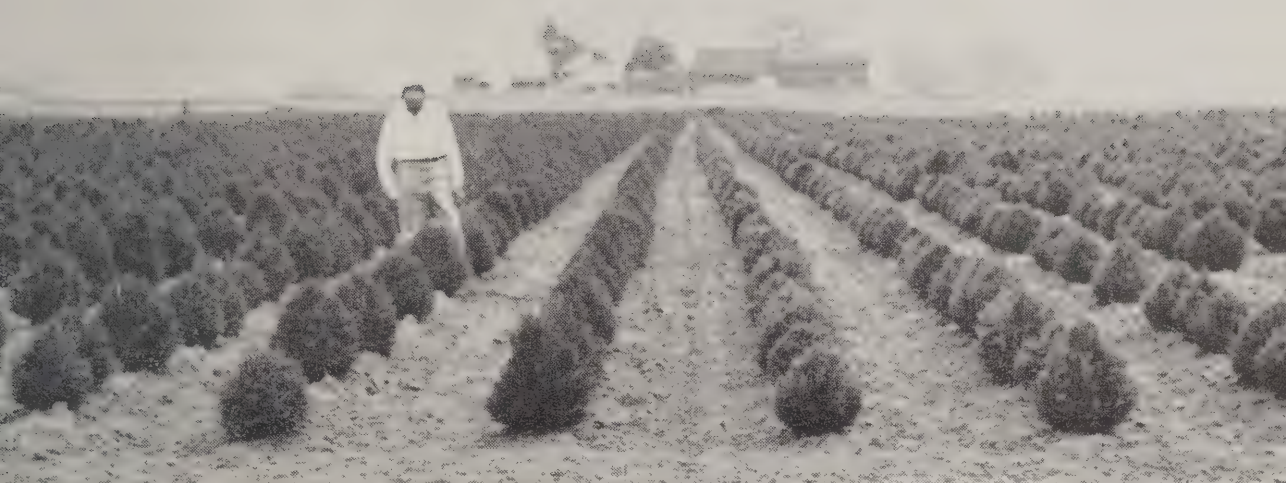
CHAMAECYPARIS plumosa (left) Plume Retinospora