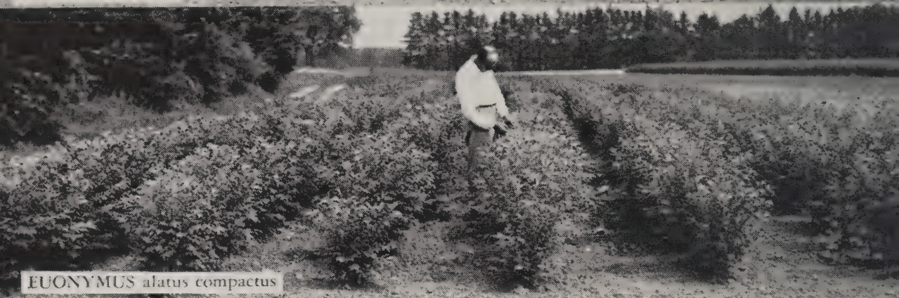
EUONYMUS alatus compactus

EUONYMUS alatus—Winged Euonymus EUONYMUS alatus compactus—Dwarf Winged Euonymus Sturdy well branched plants.