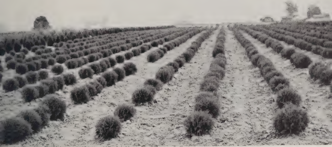
THUJA occidentalis globosa—Globe Arborvitae. The ever popular globosa. Compact full plants attractively priced. In good demand and a money maker.