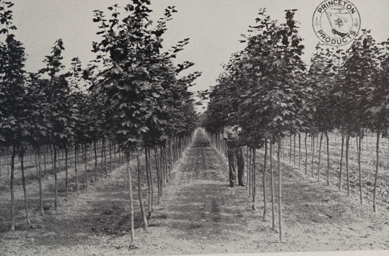
ACER platanoides—Norway Maple. Good tops, straight trunks. Plenty of room for proper development. Note the heavy caliper.

Unit Price in Quantities 1-9 10-49 50-249