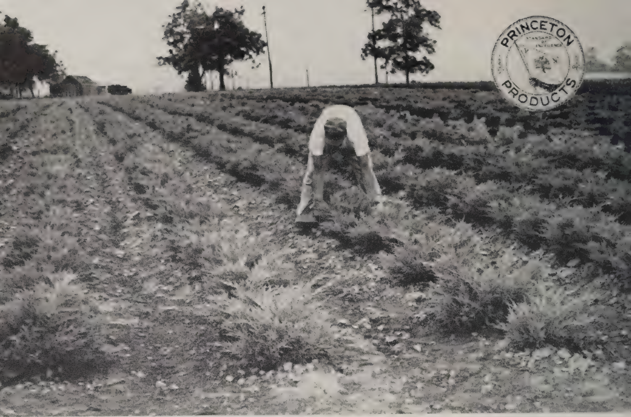
JUNIPERUS chinensis glauca hetzi—Hetz Blue Juniper. This is a lot of plant for the money. Note compactness.