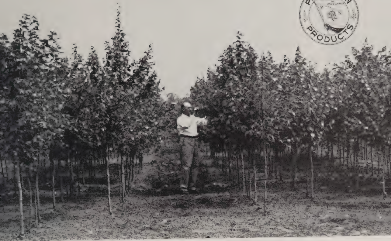
ACER rubrum—Red or Scarlet Maple. Well balanced heads. A selected strain for vivid fall coloration.

Unit Price in Quantities 1-9 10-49 50-249