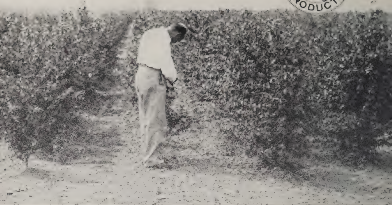
CRATAEGUS cordata —Washington Hawthorn. Another example of Princeton quality. Makes a wonderful tall, thorny barrier hedge.