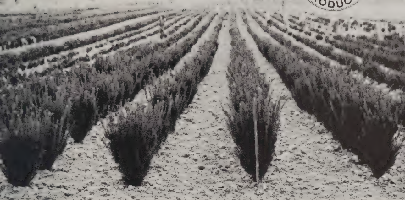
TAXUS media brevimedia—Broad Upright Yew. This is rapidly becoming one of our most popular varieties. Note yard stick.