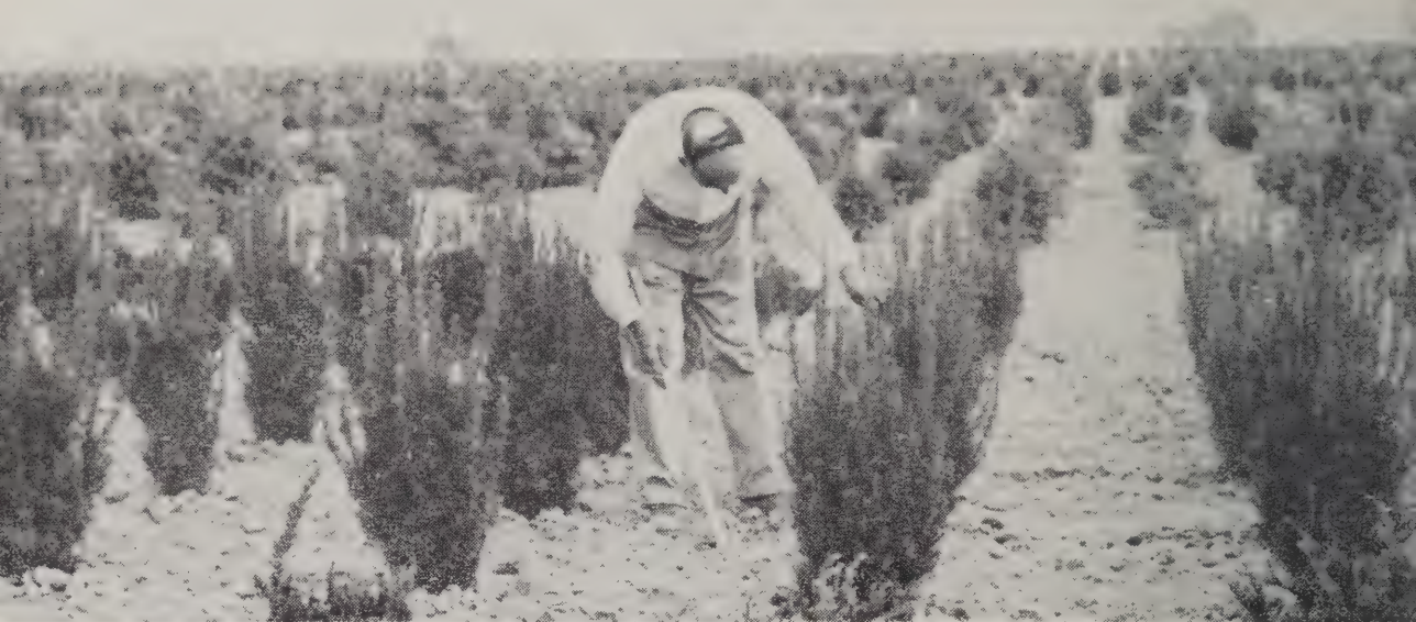
TAXUS media hicksi—Hicks Yew. Princeton quality.

Unit Price in Quantities 1-9 10-49 50-249