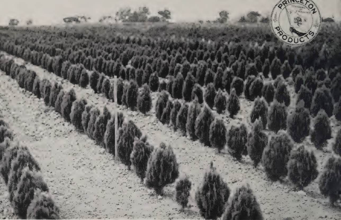
THUJA orientalis aurea nana —Berkmans Golden Arborvitae. Reasonably priced. A necessity for every retail sales yard. Note yard stick in picture.