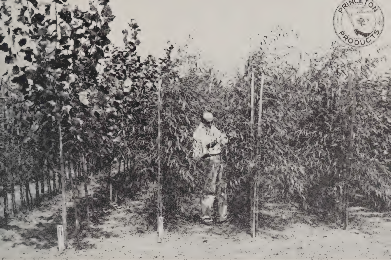
SALIX—Willows. We put a lot of work on our Willows to get this supreme quality. Showing a row of Populus Eugenie .