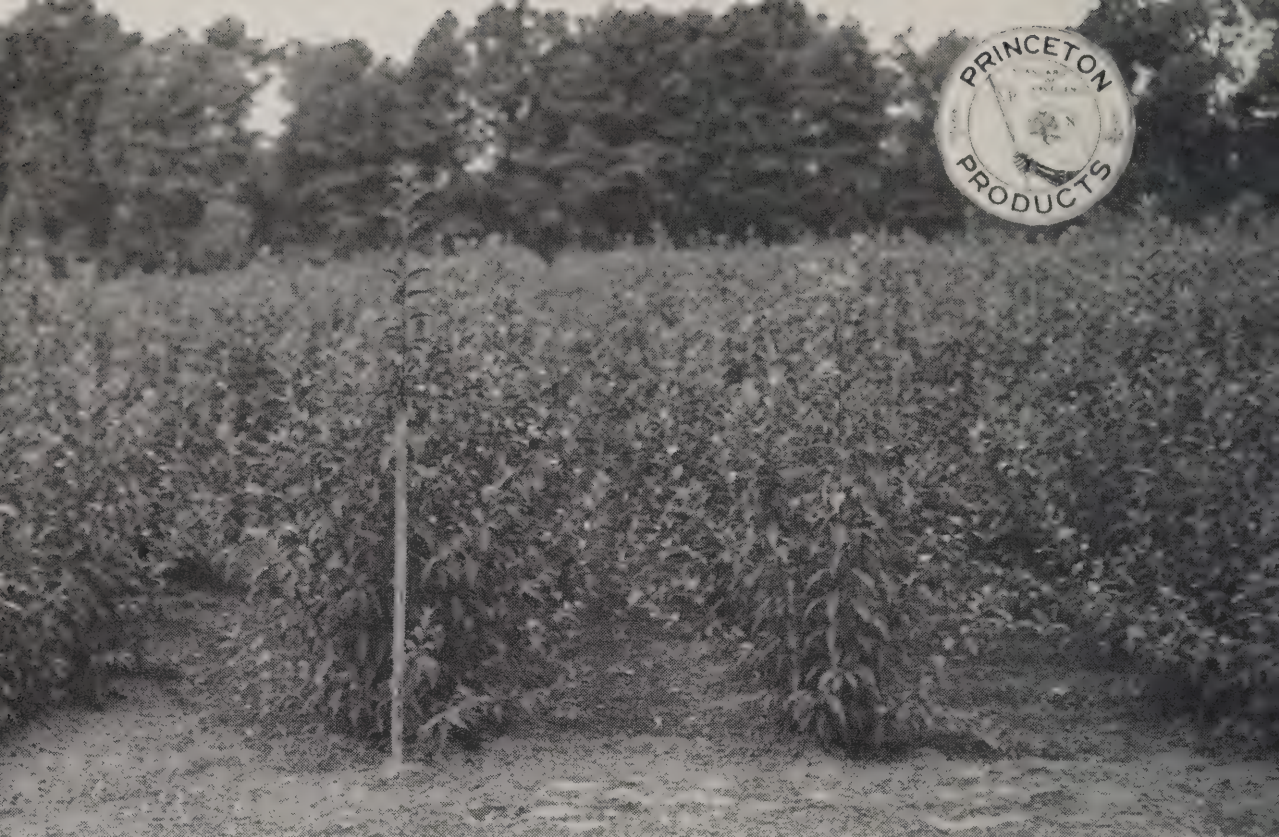
FORSYTHIA spectabilis —Showy Border Forsythia. Heavily branched. Note yard stick in picture.

Unit Price in Quantities 1-9 10-49 50-249