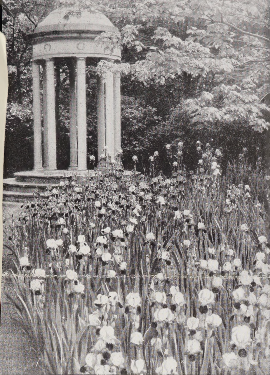
Iris—Goddess of the Rainbow.

CHINA MAID. Pink blend. Standards and falls pink at the center with edging of golden bronze for a lovely effect. Well proportioned flowers that are placed well on branching stems. $.75 each; $2.00 for 3. Height, 46 inches.