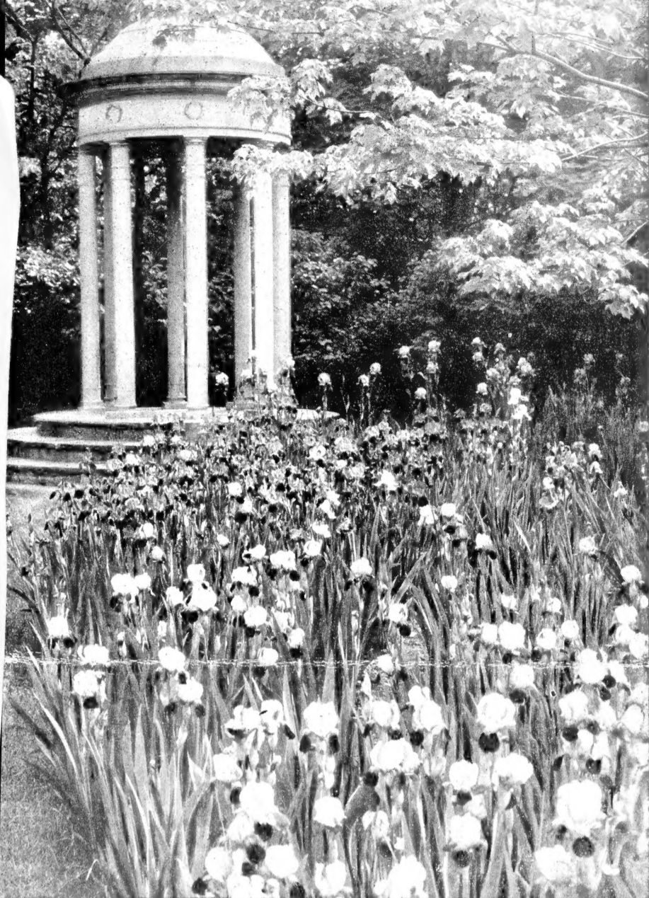
Iris—Goddess of the Rainbow.

Our prices are based upon selection, of course, of extra strong plants.