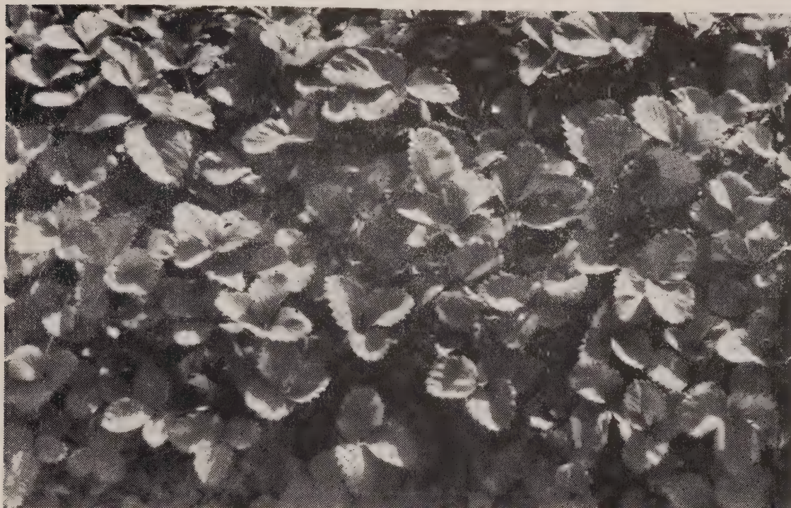
A Close-up of Our Beautiful, Healthy Plants Ready for Digging.