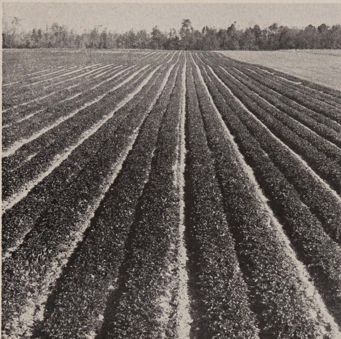
A View of One of Our Fields of Beautiful, Vigorous Plants.