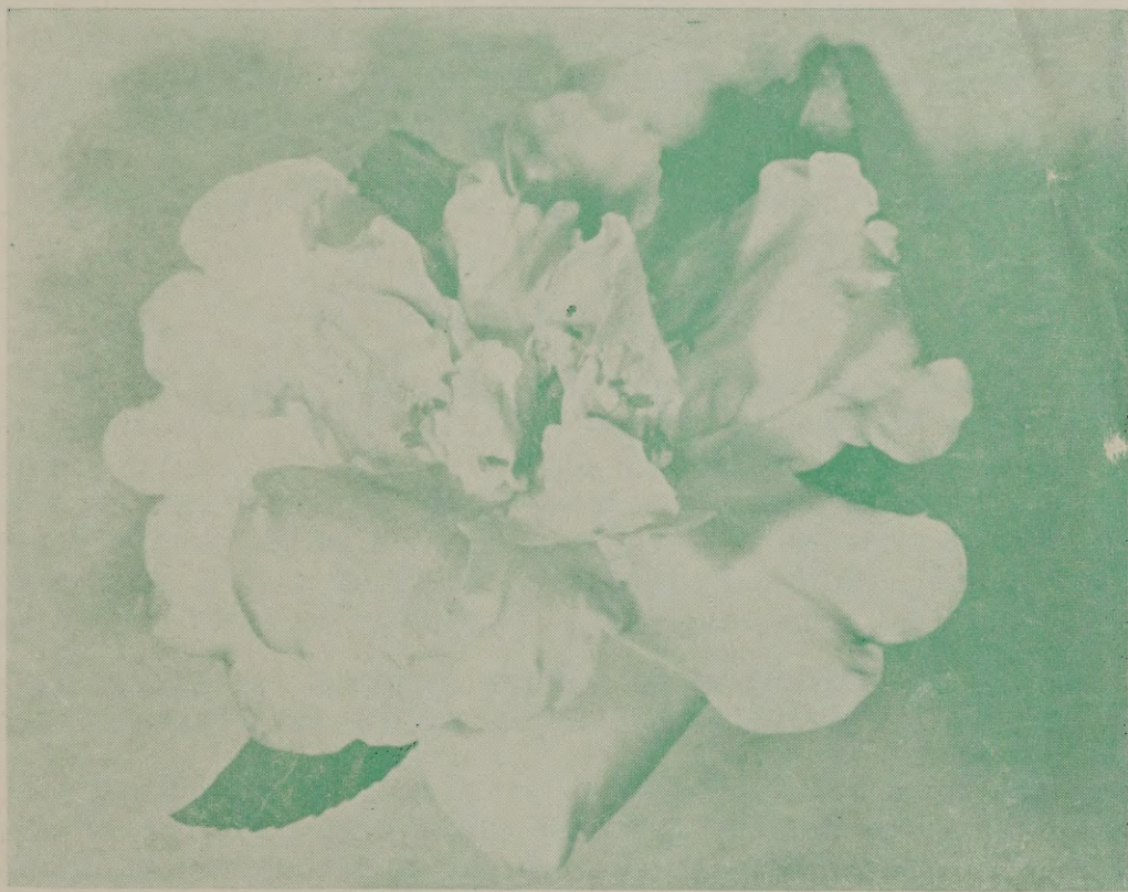
CAMELLIA SASANQUA "PINK SNOW"

LIBRARY RECEIVED ★ FEB 16 1956 ★ U. S. Department of Agriculture