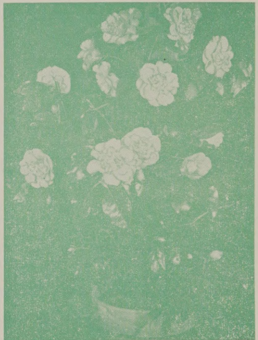
YOU CAN DEVELOP SUCH BEAUTY WITH THE CAMELLIAS LISTED BELOW.

Blooming Period—This is denoted by "E" (Early—Oct. to Jan. 1st); "M" (Mid-season—Jan. 1st to Mar.); "L" (Late—Mar. and later). This information, however, must always be considered as approximate, and based upon average conditions in the southern part of the United States. The blooming period is affected by variable weather conditions, the amount of rainfall, the latitude and variation in temperature in any given year.