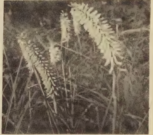
Tritoma White Giant

ANEMONE JAPONICA SEPTEMBER SPRITE - An attractive miniature form with 12" plants and silvery rose flowers. 50¢ each.