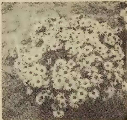
Hardy Aster Persian Rose

PYRETHRUM CRIMSON GIANT - The largest crimson Painted Daisy. Duplex flowers with broad velvety red petals. 60¢ each.