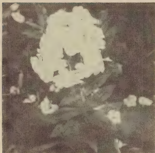
Phlox Snow Smoke

ASTER TAPESTRY - Large semi-double flowers of a lovely pastel pink shade on upright 30" plants. A newcomer recently imported from Europe. 75¢ each.