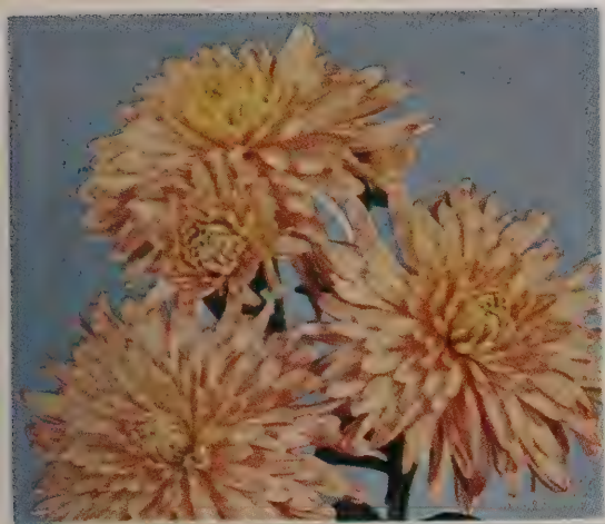
ADMIRATION. 75c each