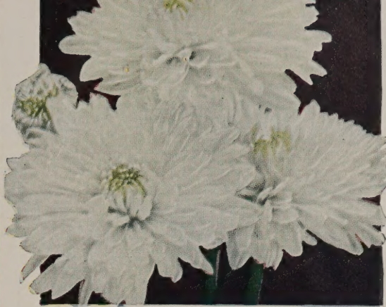
MARTIN'S WHITE. 60c each