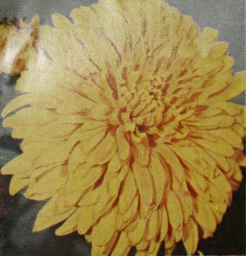
HOLIDAY. 60c each