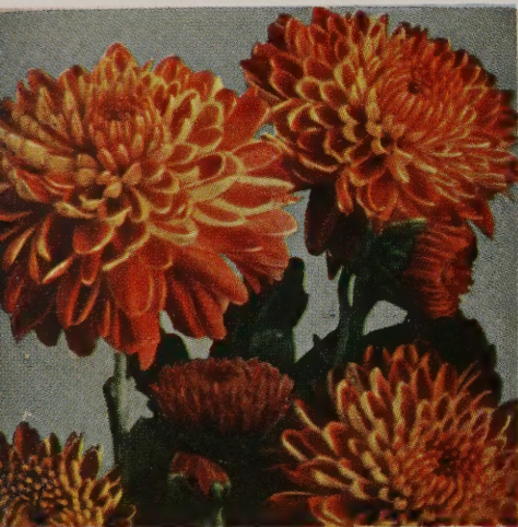
RED GOLD. 50c each