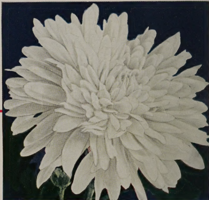
GARDENIA. $1.00 each