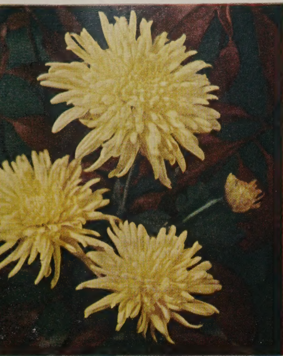
SPELLBINDER. $1.00 each

1 plant of each variety, for only $4.95 Post-paid (Total 6 plants, value $6.00)