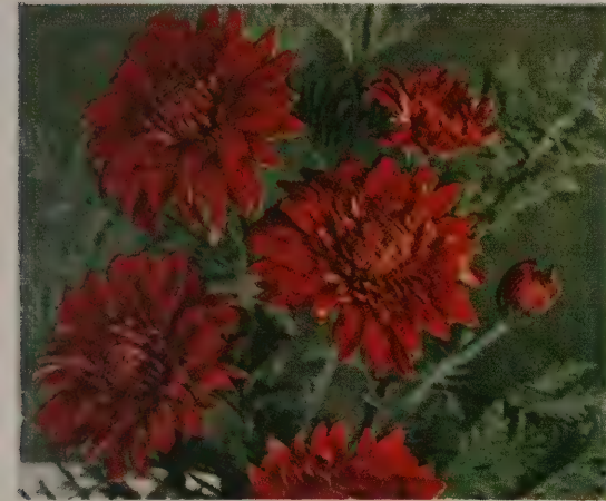
NEW MARJORIE MILLS. $1.00 each