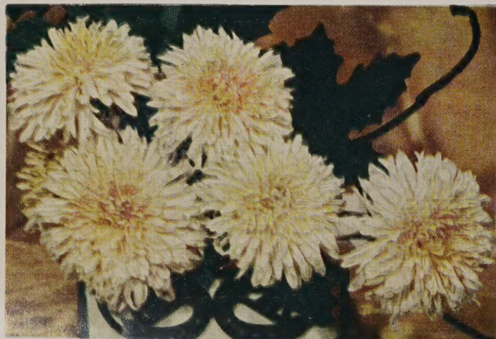
MURIEL RICE. $1.00 each