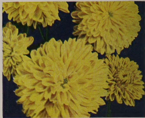
POMPONETTE. 50c each