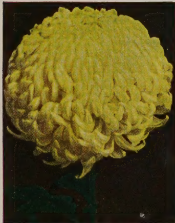
BLAZING GOLD. 50c each