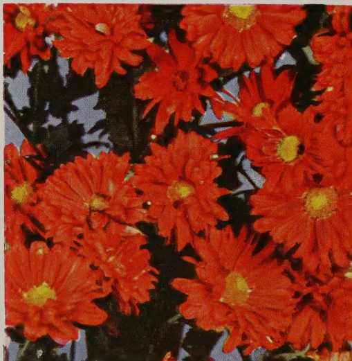
GLOW-WORM. 60c each