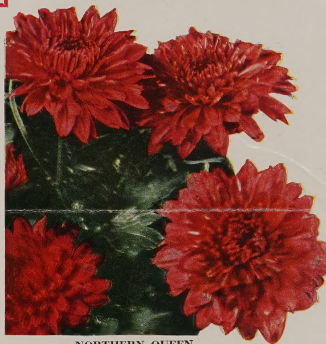
NORTHERN QUEEN. $1.00 each