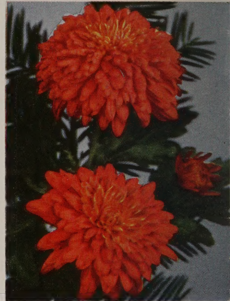
FLAMBOYANT. 75c each