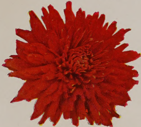
HUNTSMAN. 60c each