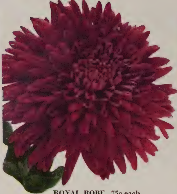
ROYAL ROBE. 75c each