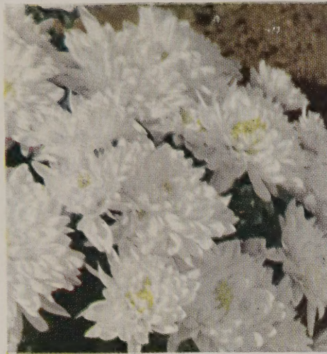
WHITE CLOUD. 75c each