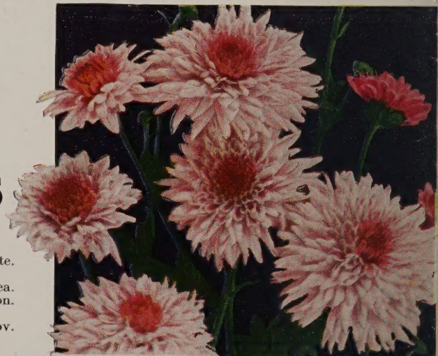
ORCHID HELEN. 60c each