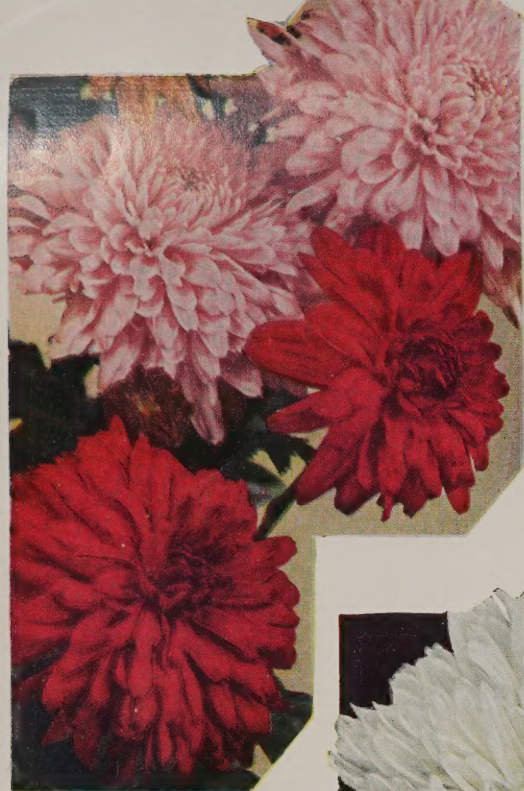
TOP, JEWELTONE 75c each BOTTOM, ALPENA $1.00 each