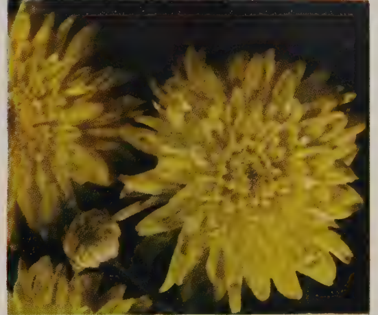
CHARLES NYE. 60c each