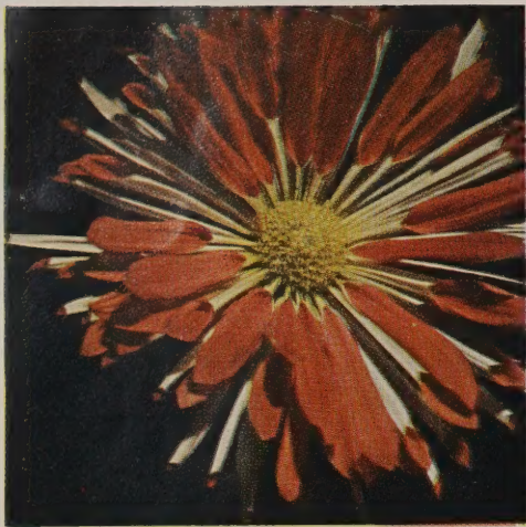
CARDINAL SPOON. 60c each