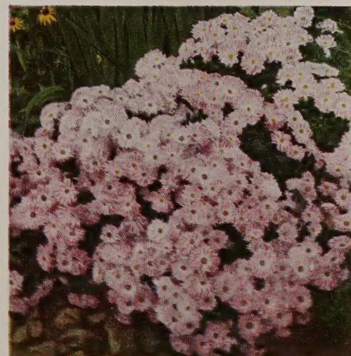
AMELIA. 60c each