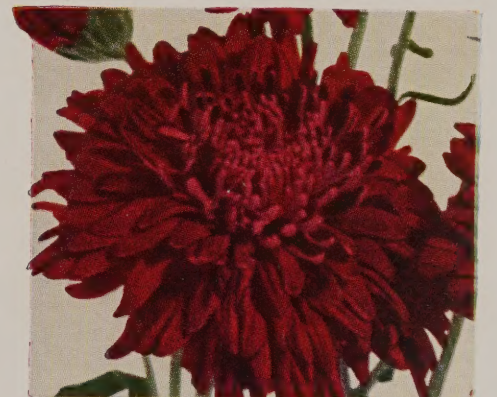
REMEMBRANCE. 60c each

Reverie. Light walnut to soft-buff. 75c each.