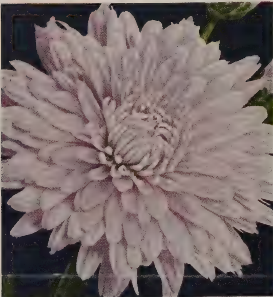
LAVENDER LADY. 60c each