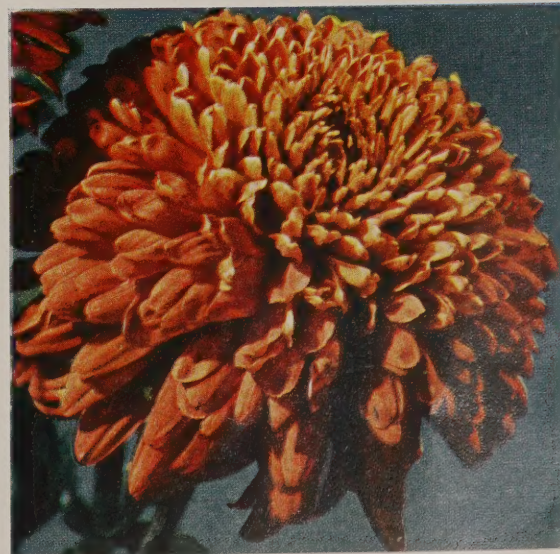
CARNIVAL. 60c each