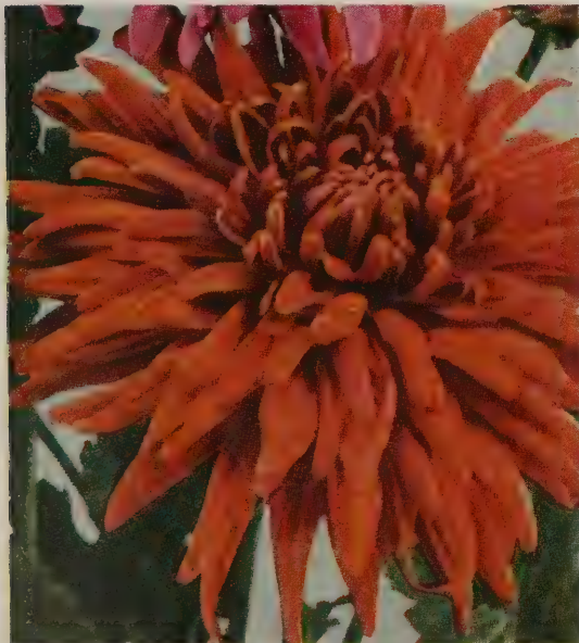
FIRESIDE. 60c each