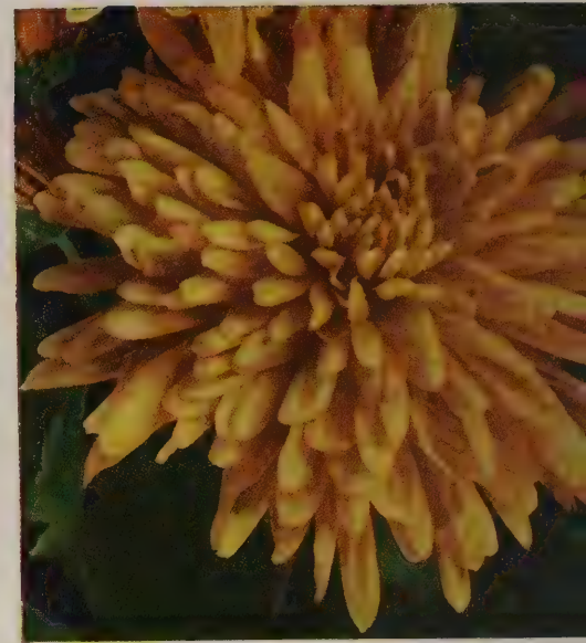
MRS. DU PONT. 60c each