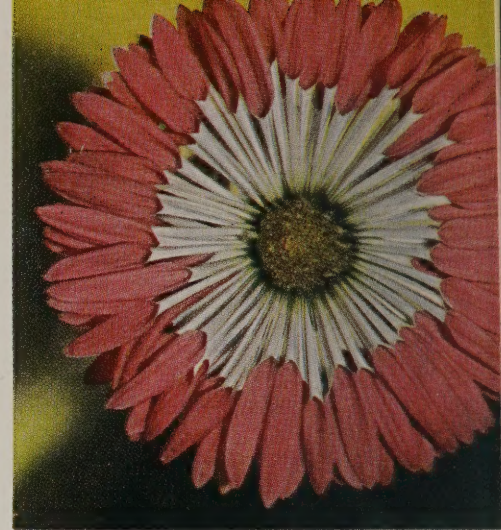
CHARM SPOON. 60c each