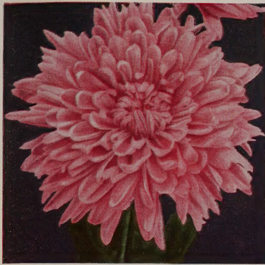
PETRISIAN PINK. 75c each