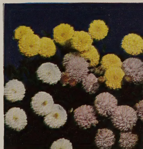
CHIQUITA, ROSITA, PEPITA 50c each