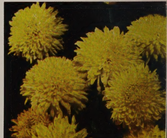
DELIGHT. 60c each