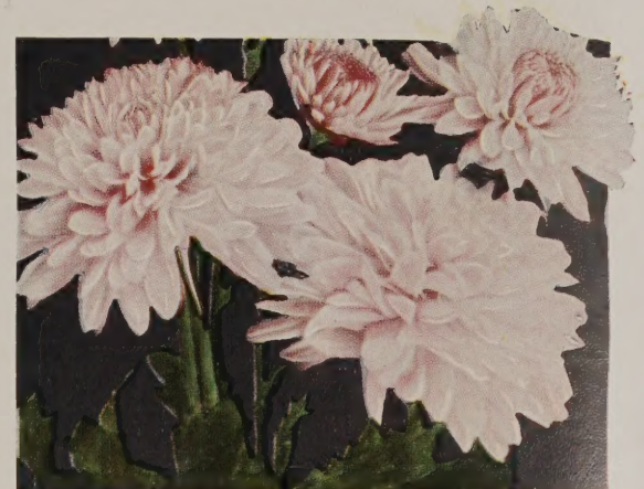
COURTIER. 60c each

GROUP No. 37 1 each of the above 9 varieties for only $5.95 Postpaid