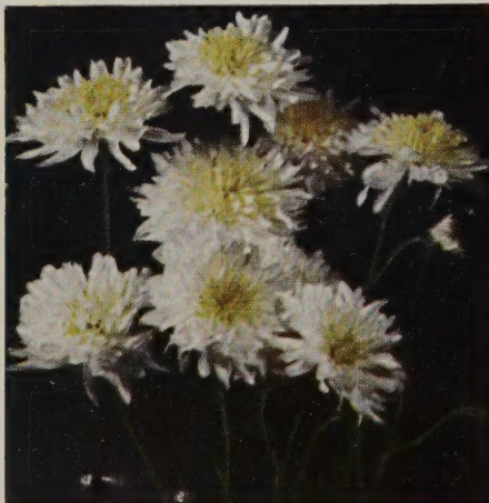
CANDLELIGHT. 50c each