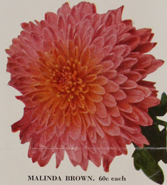
MALINDA BROWN. 60c each