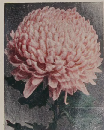
PINK CHIEF. 50c each