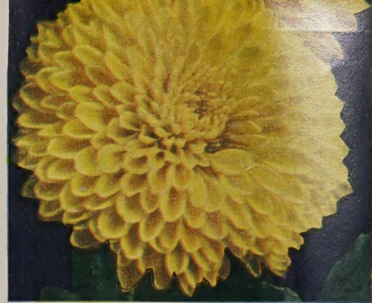
EARLY GOLD. 60c each