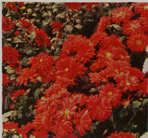
ROUGE CUSHION. 60c each