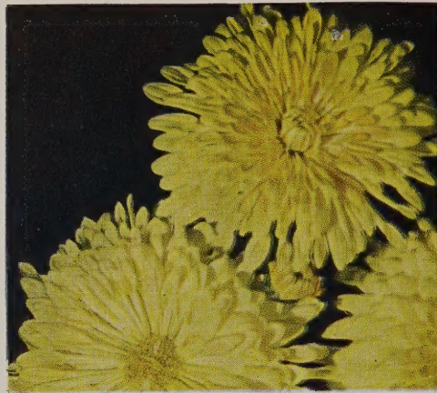
GOLDEN SPOON. 50c each