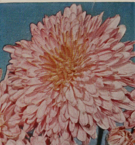
CECIL BEED. 60c each

1 each of the above 6 varieties FOR ONLY $2.79 POST-PAID