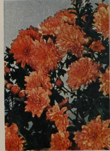
CHAMPION CUSHION. 50c each