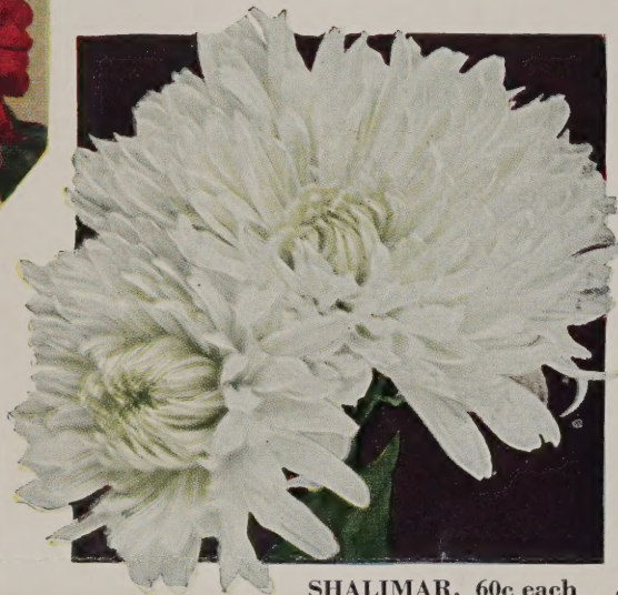
SHALIMAR. 60c each