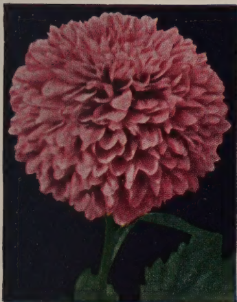
MAJOR BOWES. 50c each

Early Gold. Golden yellow pompon. 60c each. Joan Helen. Garnet shading to purple, with bright yellow center. 50c each. Martin's White. Pure white. 60c each.