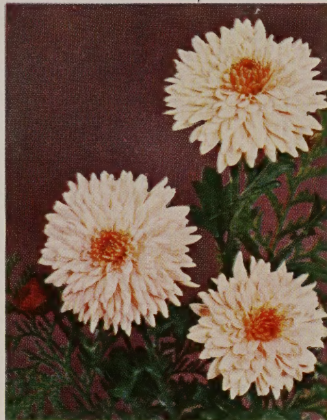
REVERIE. 75c each