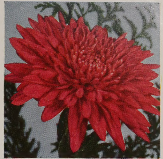
ARISTOCRAT. $1.00 each