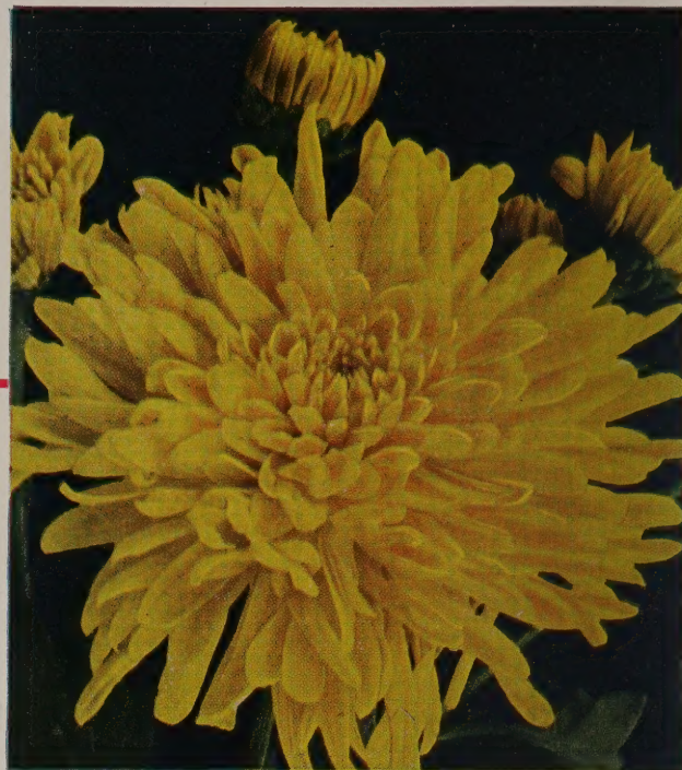
SUNBURST. $1.00 each

These plants are grown in 2 1/4-inch pots and are shipped with a good ball of potting mixture in an especially made carton that holds units of 3 or 6 plants. Please order in units of 3, 6, 9, 12, 15, etc. No order can be filled for a total of less than 3 plants. This can be one each of 3 varieties or any combination thereof. The single plant price will be used when less than 3 of any one variety is ordered. All varieties will be labeled as to name, primary color and blooming date.