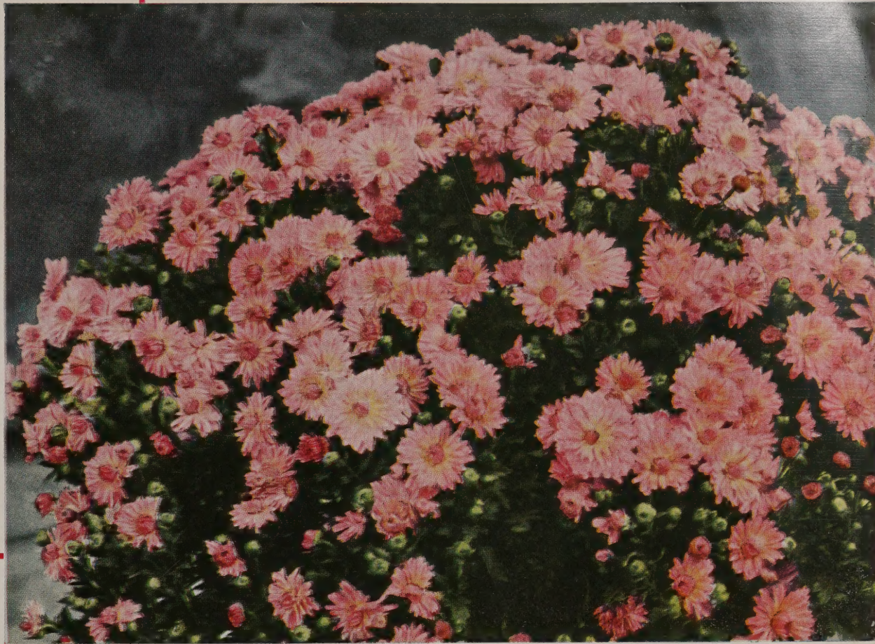
COQUETTE. $1.00 each