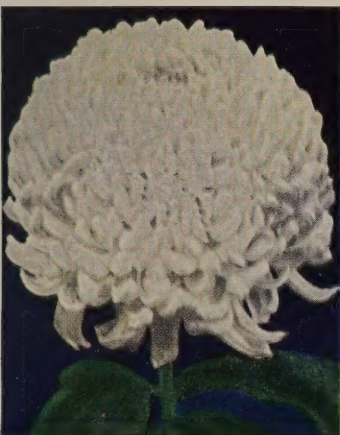
AMBASSADOR. 50c each