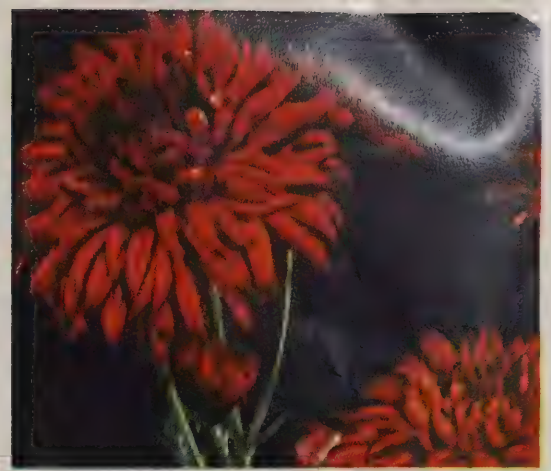
RED VELVET. 50c each

Yellow Blanket. Small, bright yellow buttons with dark green foliage. Very free blooming. Wonderful for cutting. A good border plant when pinched back. Oct. 10. 50c each.