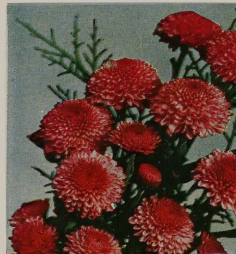
MASQUERADE. 60c each

1 each of the above 6 varieties FOR ONLY $2.98 POST-PAID