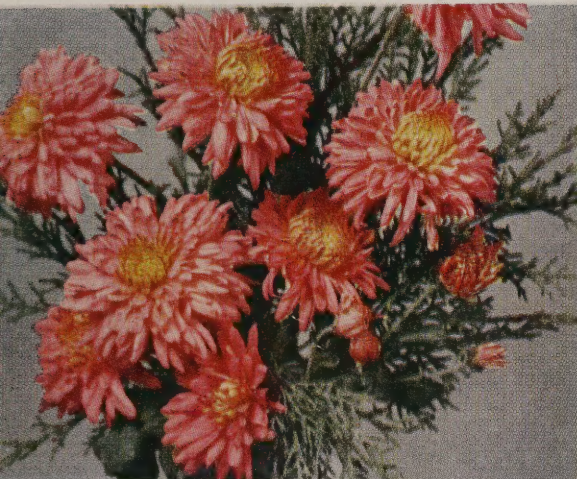
JOYOUS. $1.00 each