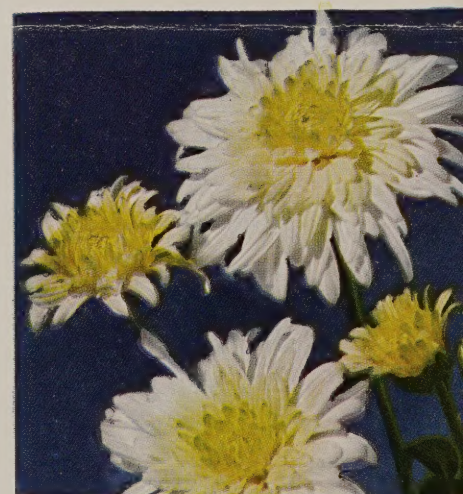
AVALANCHE. 50c each