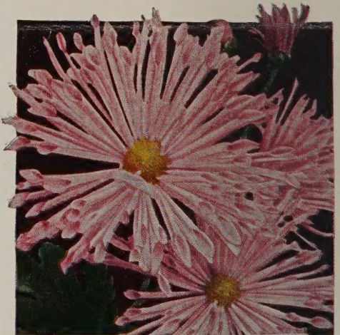
ORCHID SPOON. 60c each

1 each of the above $2.98 Post-paid 6 varieties, for only