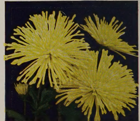
YELLOW SPOON. 60c each