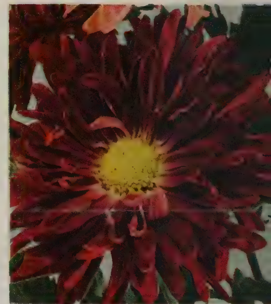
RAJAH. 75c each