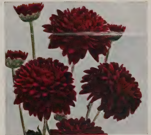
RED GLOW. 60c each