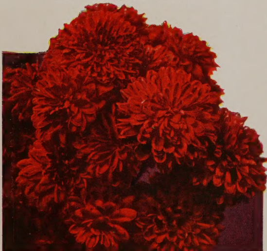
EARLY CRIMSON. 60c each

GROUP No. 37 1 each of the above 9 varieties for only $5.95 Postpaid