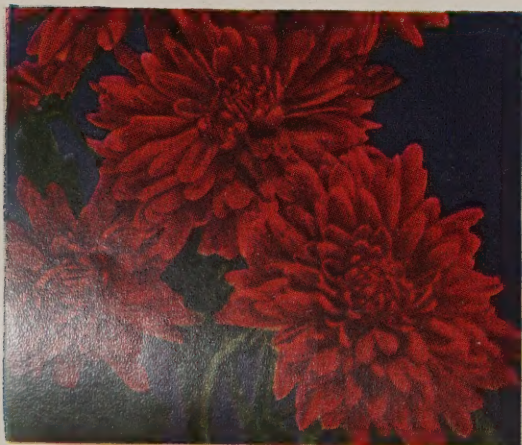
JUBILEE. 75c each