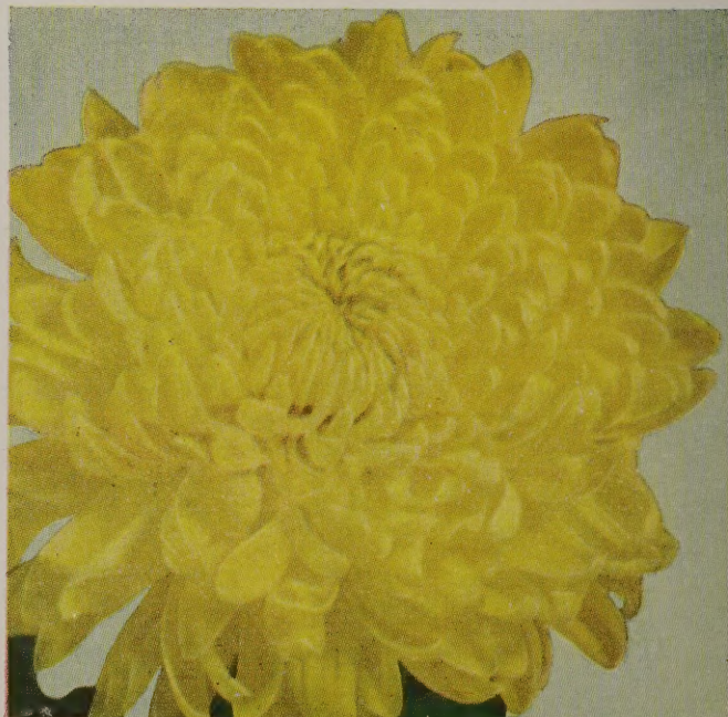
SPODE. $1.00 each

Cash, Check or Money Order with order. NO C.O.D. PLEASE. Shipments made to Ohio residents must include 3% Ohio Sales Tax. Please add this to the prices listed.