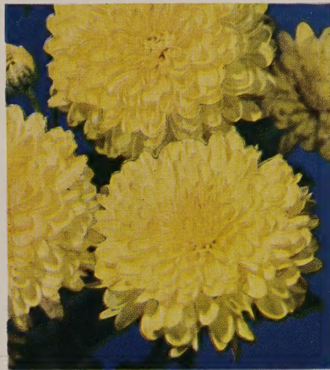
MOONLIGHT. 60c each