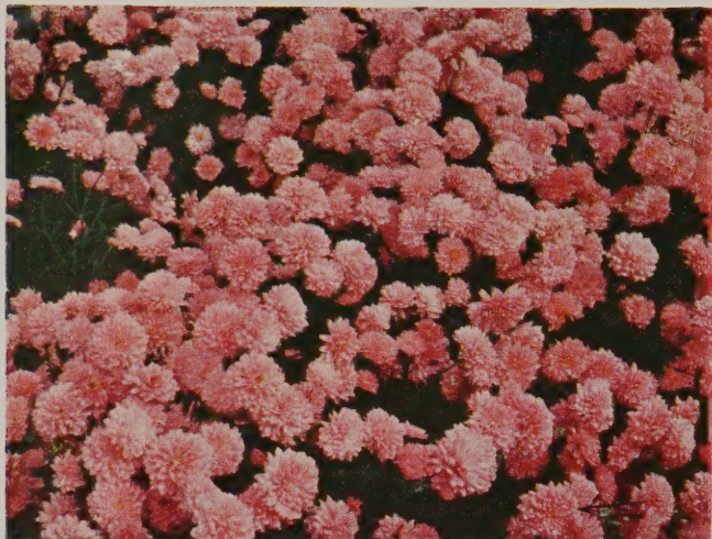
MAJOR CUSHION. 50c each

Where shipping dates are not specified, we will ship at the proper time for your locality. In Ohio this is May 1 to July 1. Farther south the plants can be set out earlier without danger from frost. If given some protection for the first few nights until they become temperature hardened, they will withstand even severe frost.