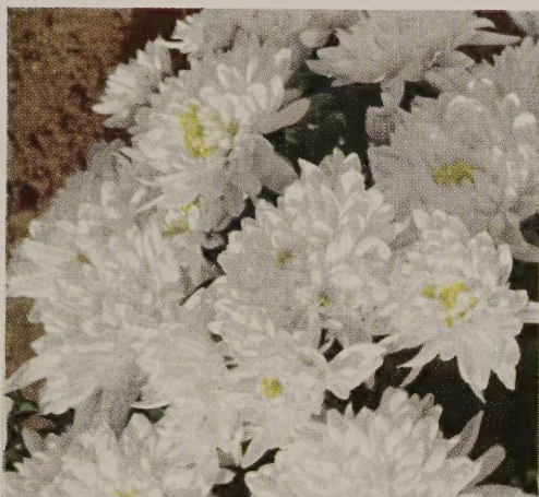
OSAGE. 75c each