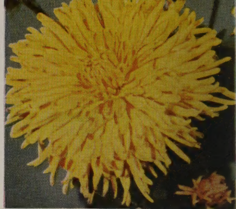
LEE POWELL. 60c each

Chrysanthemums are shallow-rooting plants and should be set no deeper than the top of the ball of rooting mixture in which you receive them. Do not be afraid of over-watering when you plant them. Give sufficient water to saturate the soil. Then leave them alone for a few days and cultivate lightly before watering them again.