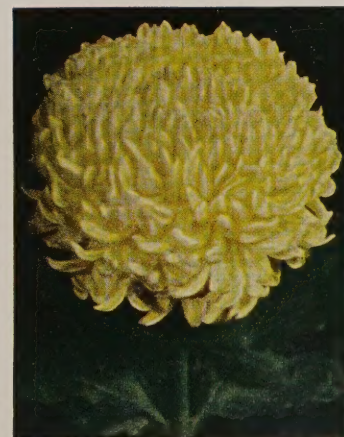
MRS. KIDDER. 50c each

1 each of the above 6 varieties, for only $2.49 Post-paid