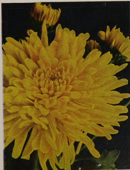
GOLD LODE. 50c each