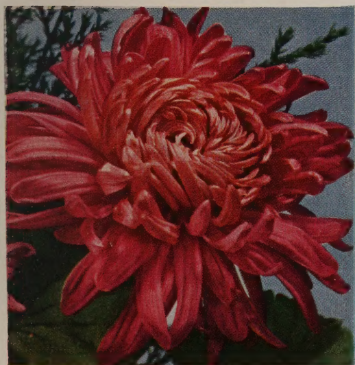
ALEX CUMMING. $1.00 each

12 1 each of the above 12 varieties $7.98 Postpaid for only