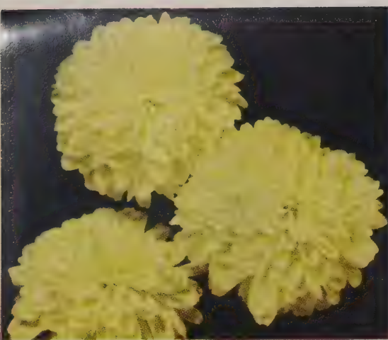
CANARY WONDER. 60c each