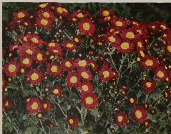
MISCHIEF. 75c each