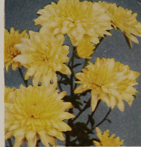
TRANQUILITY. 75c each