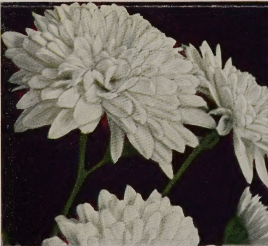
CRYSTAL MAID. $1.00 each