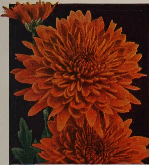
ORSONA. 75c each