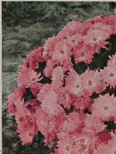
ROSA. 75c each