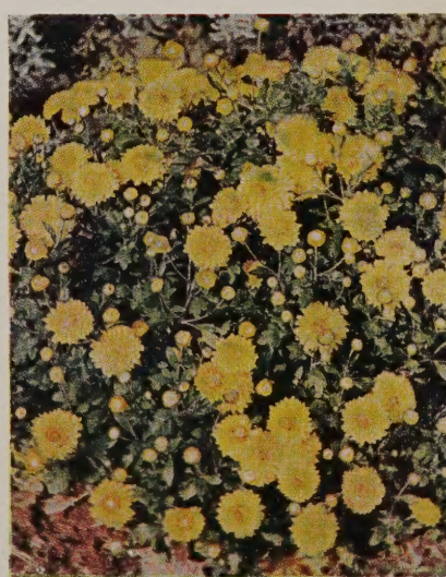
GOLDEN CARPET. 60c each