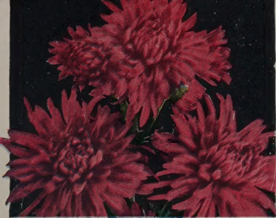
SPELLBOUND. 50c each