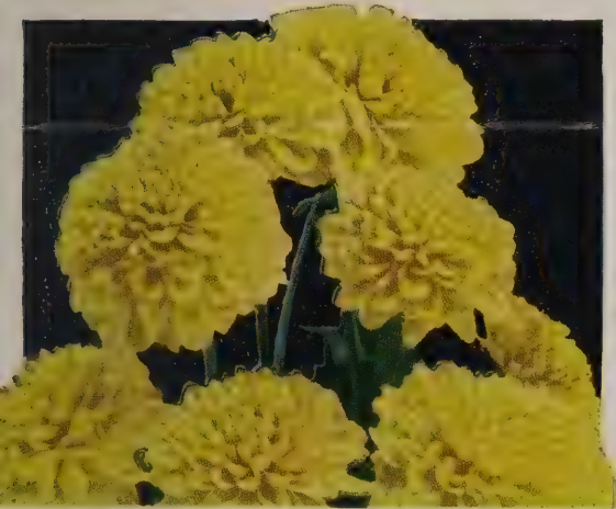
YELLOW BLANKET. 50c each

A Complete Mum Garden of 24 plants for only $9.95 Postpaid