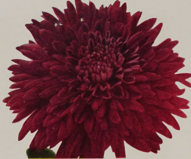
ALERT. 50c each