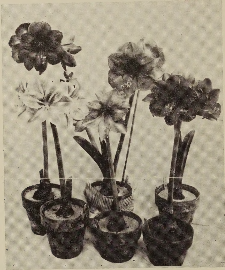
Rear — LUDWIG'S SPLENDOR — PRINCE of ORANGE — and PRIVATE strain reading left to right. Front — STRIPED BEAUTY — CRIMSON BEAUTY and ROYAL RUBY.