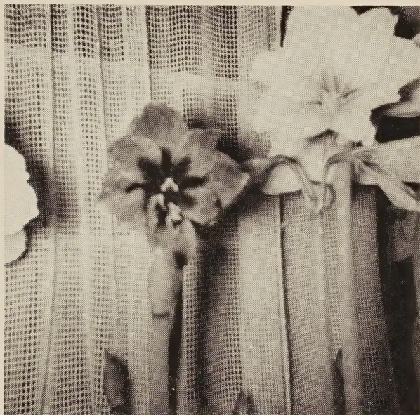
White Giant Daintiness, Queen of Whites.