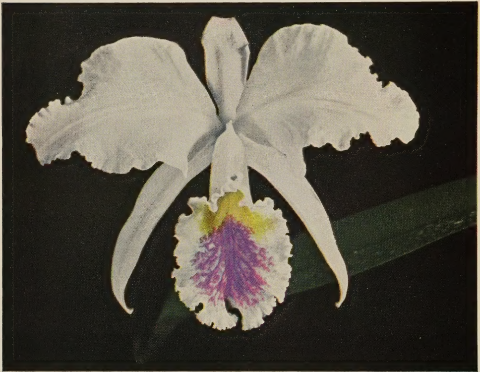
CATTLEYA ENID ALBA