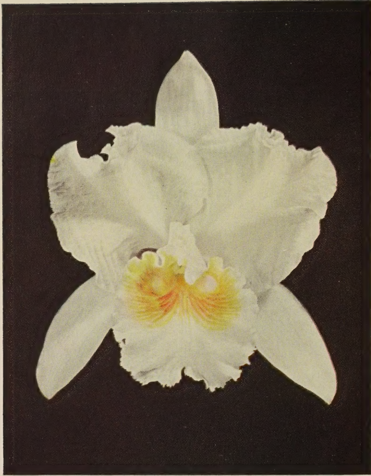
CATTLEYA ESTELLE ALBA