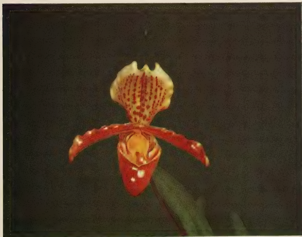
CYPRIPEDIUM INSIGNE—HAREFIELD HALL TYPE