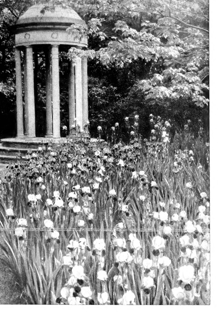
Iris-Goddess of the Rainbow.

ARGUS PHEASANT. Brown Gold. A very remarkable flower of bright golden brown with a copper sheen. Very outstanding and a Dykes Medal Winner. Height, 38 inches. $2.50 each; $6.00 for 3. BLUE SHIMMER. White and Blue. Pure