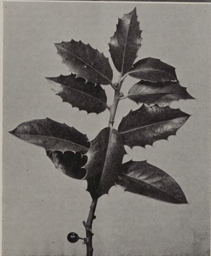
The upper one is a male variety, Robinson. Below is Smithiana.