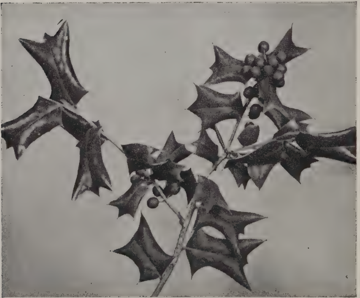
The Chinese horned holly, Ilex cornuta . Glossy leaves and plentiful red fruit. A wonderful plant for hedge or specimen.