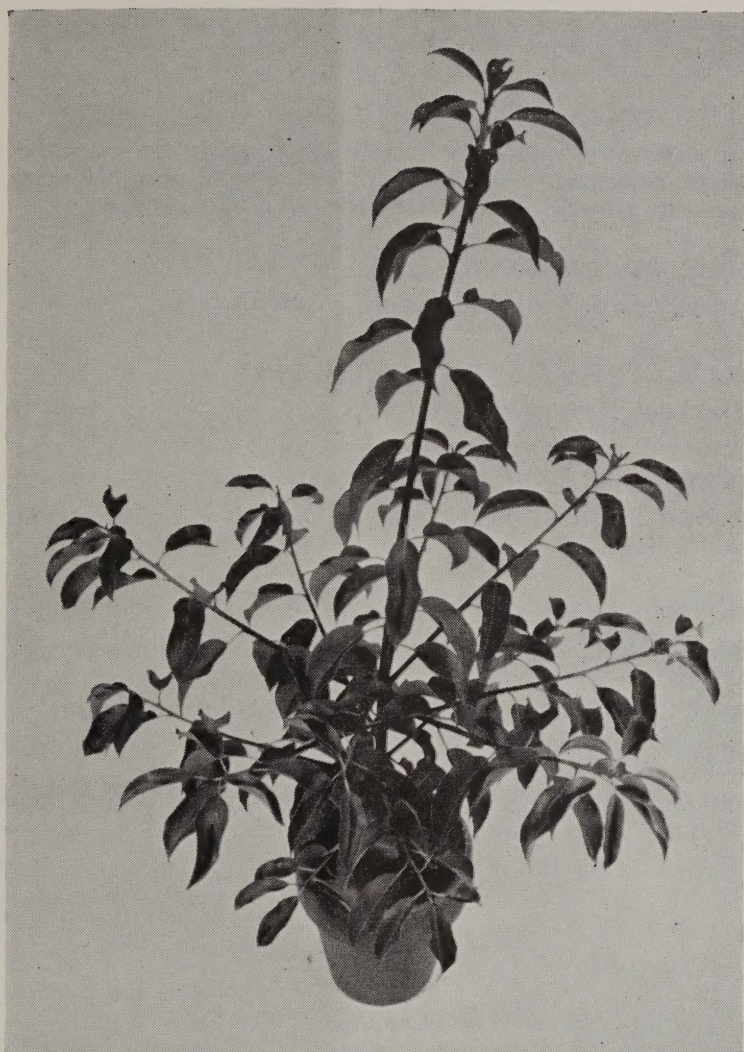
This is the long-stalked holly, Ilex pedunculosa. The red berries hang down on two-inch stems.