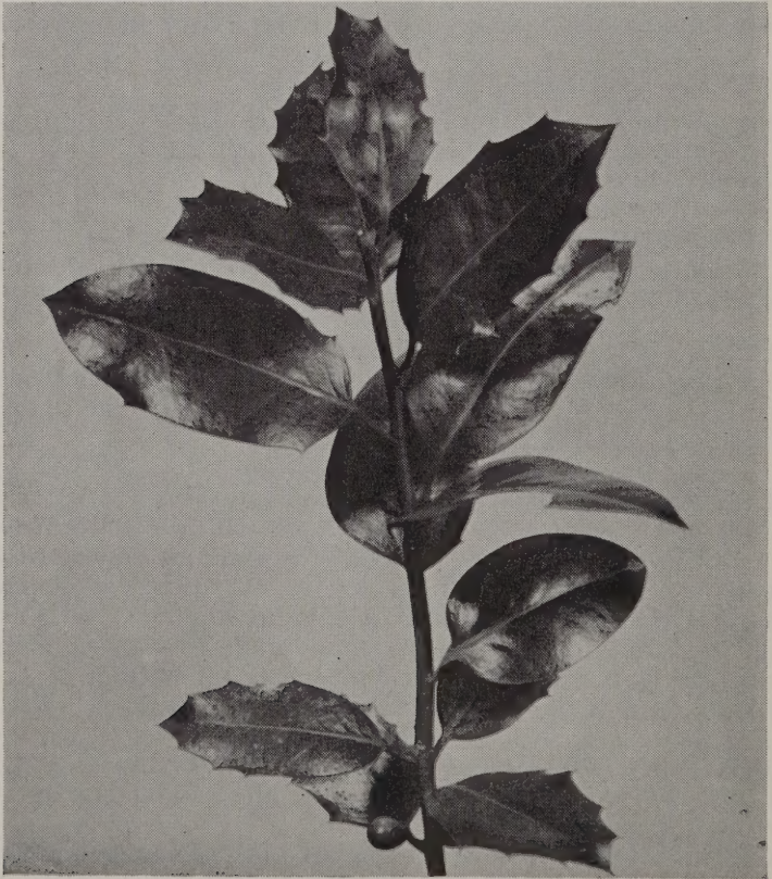
Above, Golden Queen, a superb variegated holly. Below, Ciliata major, one of the most beautiful.