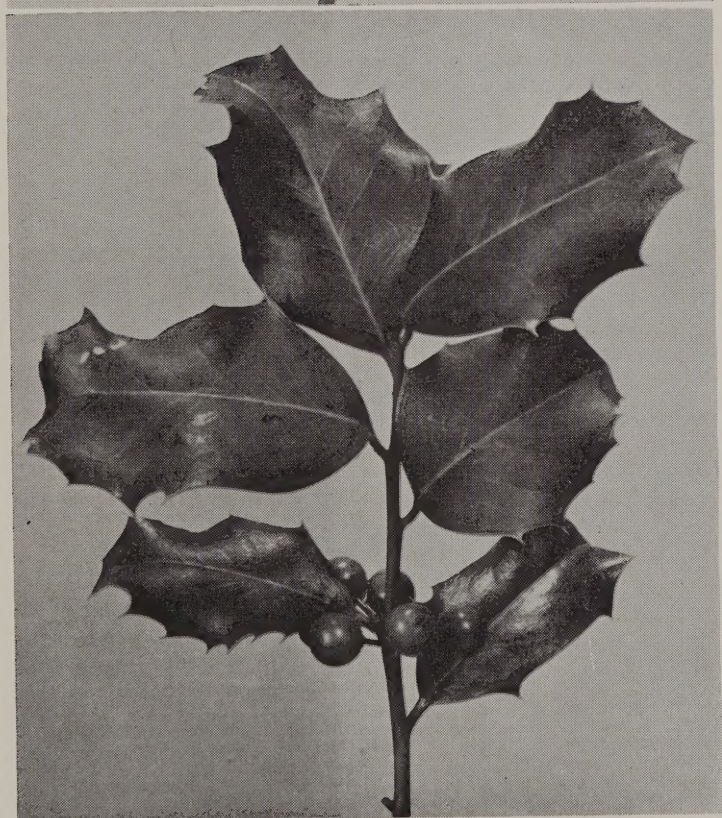
Two of the hybrid group. Above, Belgica; below, Hodgins.