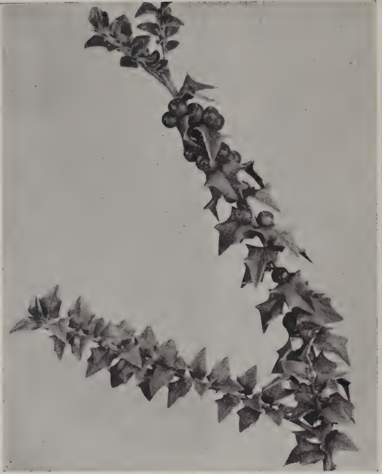
Ilex pernyi . A lovely small-leaved Chinese species.