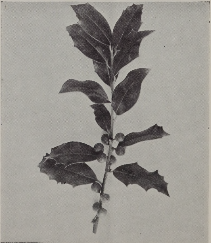
Integrifolia , one of the most popular English hollies.