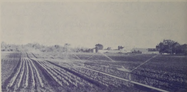
TWO MILLION TRANSPLANTS PRECISION MACHINE PLANTED