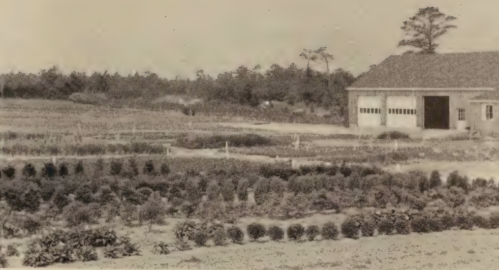
Headquarters of Our Cape Cod Nurseries, Route 28, East Falmouth