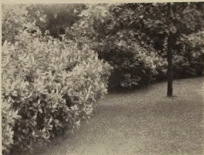
Summersweet Clethra, Particularly Fine for Midsummer Fragrance and Beauty