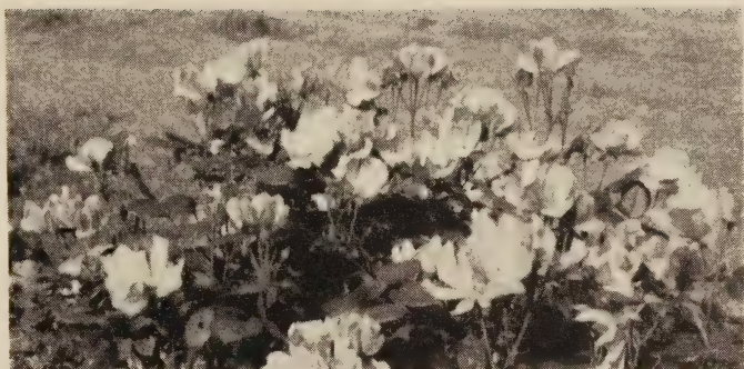
Floribunda Roses Give Beautiful All-Summer Color