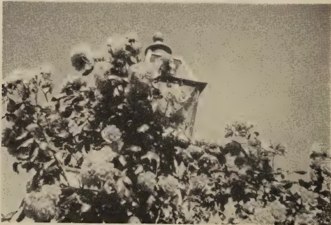
Climbing Rose "Blaze" at the Height of Its Brilliance

Carrousel. Plant Pat. 1066. Large double deep red flowers in glowing profusion. $2.25. Potted; $2.75.