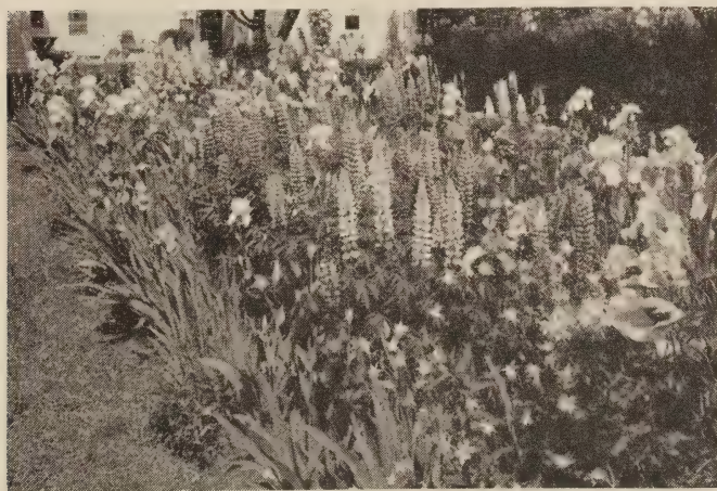
Lupines, Iris and Poppies in the Spring Perennial Border

Nine specially selected varieties, all colors.