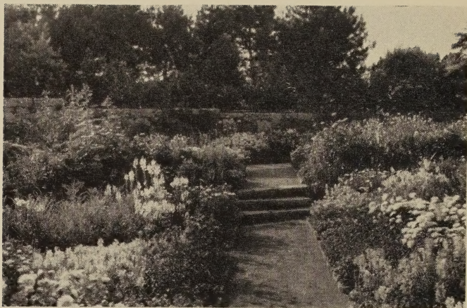
All-Summer Beauty of Perennials and Annuals