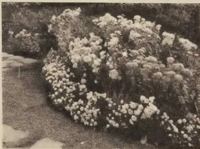
Hardy 'Mums — Brilliantly Effective All Through the Fall