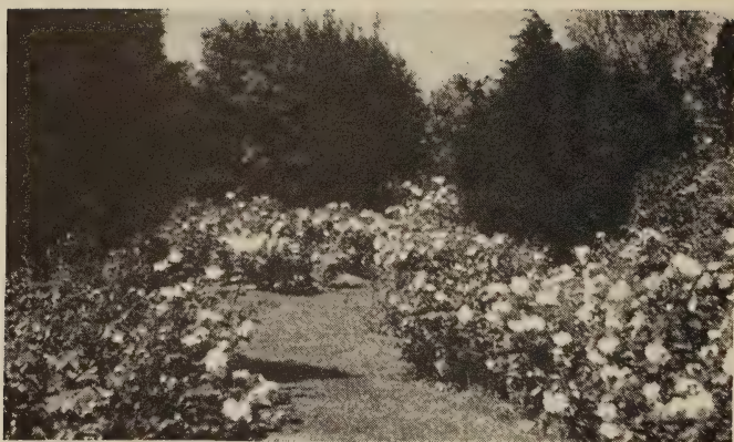
Roses are at Their Brilliant Best on Cape Cod