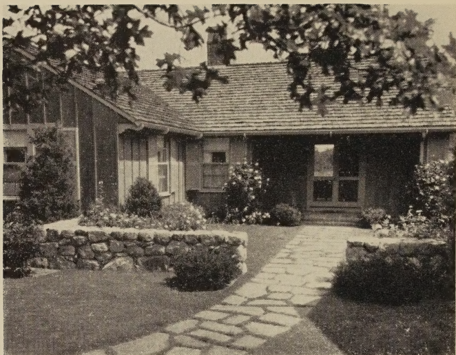
The Simple Beauty of a Welcoming Dooryard