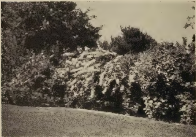
Beautiful Flowering Shrubs Frame the Lawn and Enclose a Secluded Garden

Well-kept hedges have a trimness and a touch of the architectural which is often appropriate. They are compact and effective in limited areas. They do require care, however, and