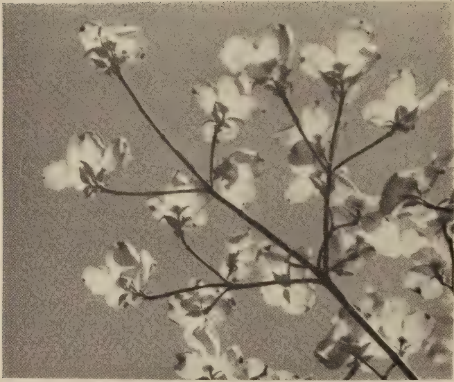
The Spring Beauty of Flowering Dogwood