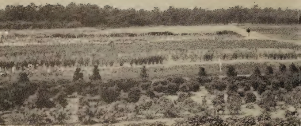
Part of the Perennial Nursery and Display Grounds at the New Sales B