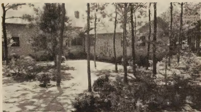
Broadleaf Evergreens and Ground Covers Effectively Used in Partial Shade

where space permits it is often better to use an informal border of various kinds of flowering shrubs well planned for variety and succession of bloom through the season.