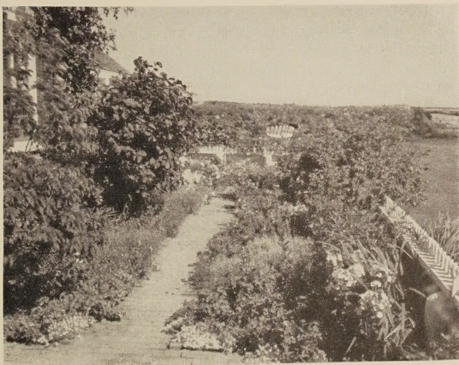
A Typical Old-Time Cape Cod Garden

Our Cape Cod Nurseries will gladly have a competent representative call and advise you, without obligation, how best to accomplish whatever you may need. You, or they for you if you wish, may select appropriate plants from the Nurseries at our new Cape Cod Gardening Center, and plant them with every assurance of complete satisfaction.