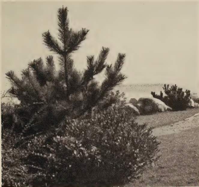
Japanese Black Pine and Bayberry Two of the Best Plants for Seashore Exposures