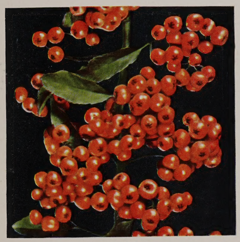
PYRACANTHA White flowers in spring; brilliant orange berries in fall.