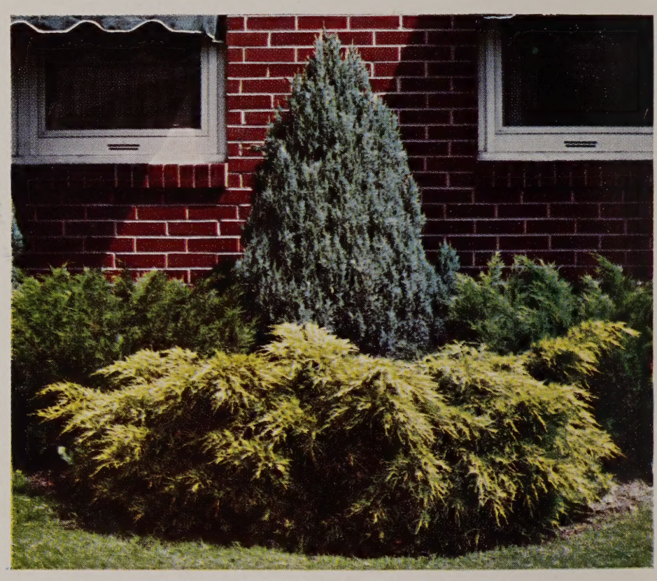
GOLDEN PFITZER and MOFFET JUNIPER