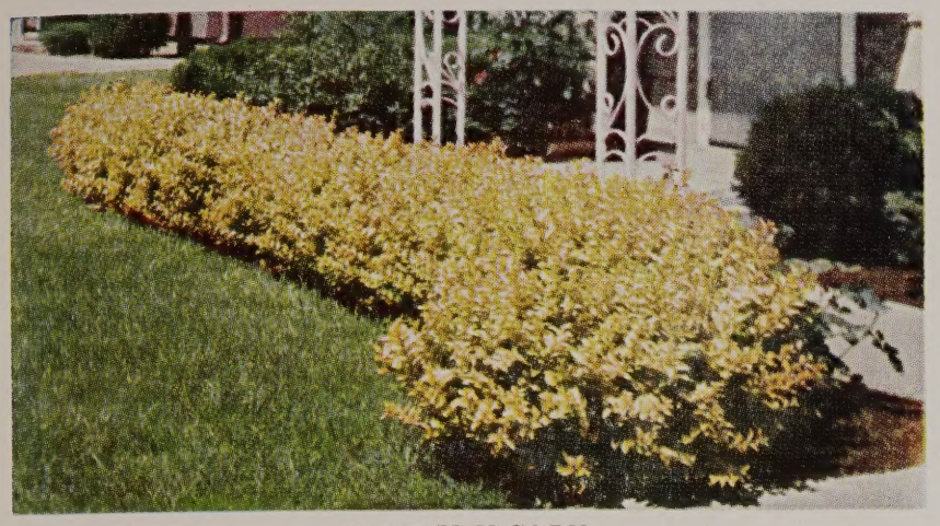
GOLDEN VICARY Waxy golden yellow foliage all summer.