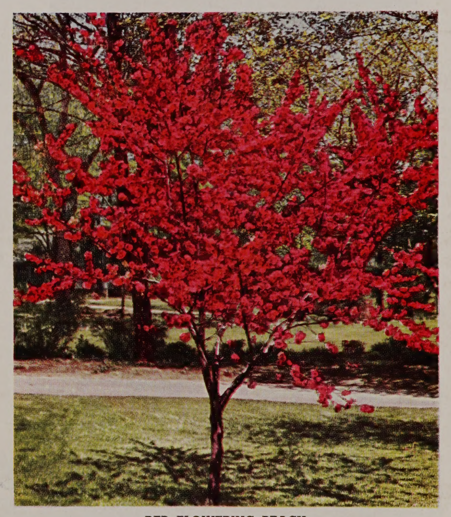
RED FLOWERING PEACH

See our listing of the new Crimson Beauty cherry-red variety.