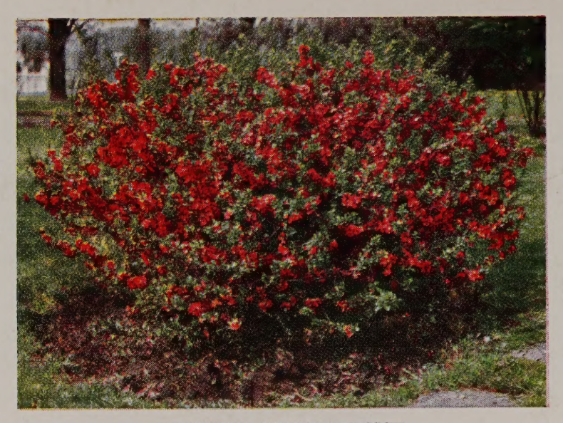
GLOWING EMBER QUINCE

See our listing of the new Crimson Beauty cherry-red variety.