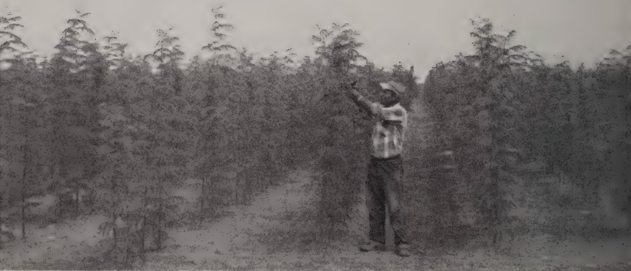
SHADEMASTER LOCUST 1-year whips. Note straight trunks, staking not required.