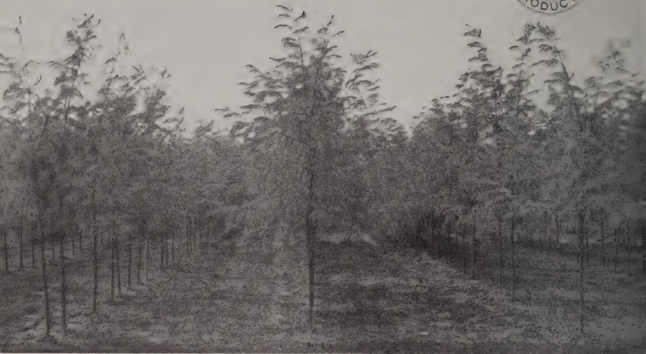
SHADEMASTER LOCUST—Princeton Upright Thornless Honeylocust—Plant Patent No. 1515.