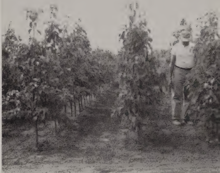
CORNUS florida (right)—White flowering Dogwood and CORNUS florida rubra (left)—Red flowering Dogwood. Shapely, well-balanced trees with full tops. The last word in flowering Dogwood.