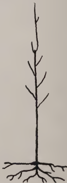
Norway Maple, London Plane, Shademaster Locust, etc.