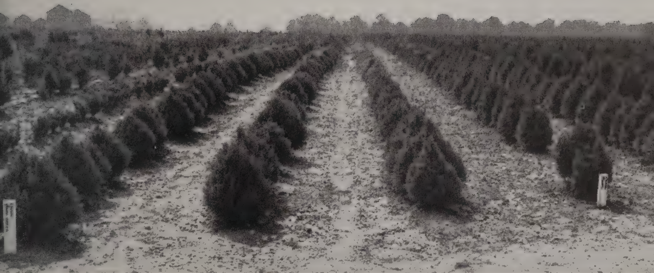
CHAMAECYPARIS plumosa and plumosa aurea. Sheared plants of fine quality at low cost.