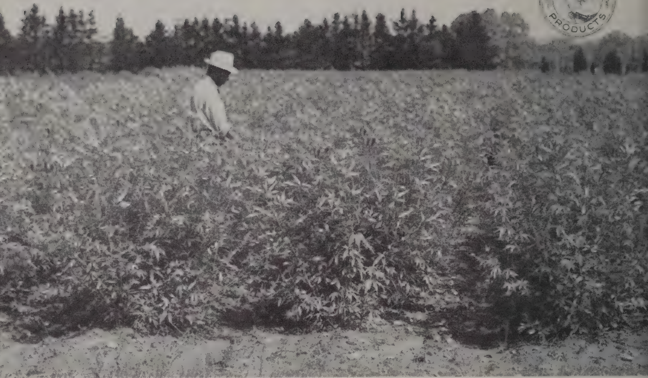
VITEX macrophylla — Large-leaved Lilac Chaste tree. Lilac flowers in August and September. (See page 73)

Unit Price in Quantities 1-9 10-49 50-249