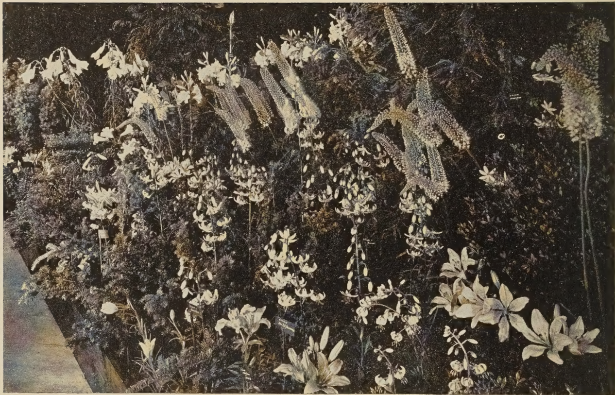
A Scheepers Prize-Winning Exhibit at the New York Show. Fox Tail Lilies in background (Eremuri) For other Lilies see our Fall 1957 Catalog recently mailed to you.