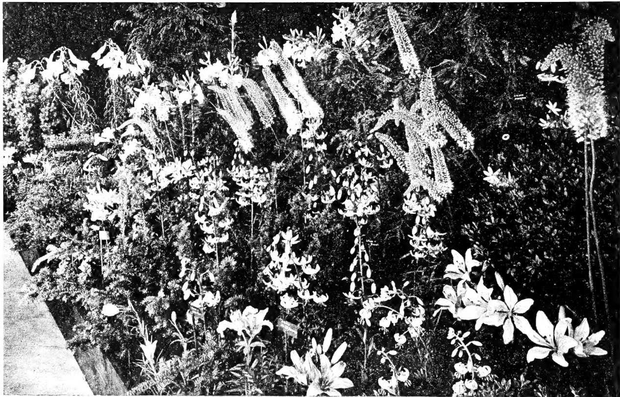
A Scheepers Prize-Winning Exhibit at the New York Show. Fox Tail Lilies in background (Eremuri) For other Lilies see our Fall 1957 Catalog recently mailed to you.