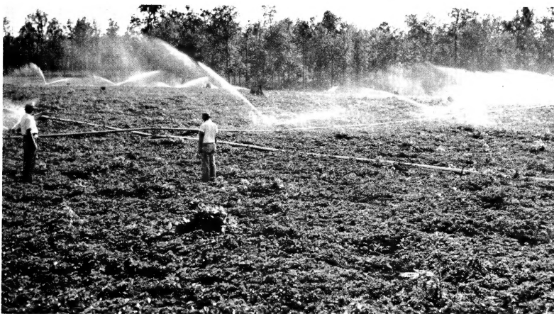
Virus-free Tennessee Beauty grown under irrigation.

When we start to write about Tennessee Beauty, we feel we have finally struck "pay dirt," as the saying goes. Truly a Beauty, and except for the fact that the name Tennessee was given to it, resulting in the localizing of this outstanding variety, it would long since have been the leading late variety over a wide area. North and south, east and west, Tennessee Beauty does well, and its merits are fast becoming known. Has the ability to produce large crops of beautiful clear red berries, quality good and ships well. While the berries tend to darken slightly after picking, the market accepts it with alacrity. In spite of late frosts 530 crates per acre was the yield in tests at Tennessee Exp. Station, in 1955. This from virus free plants supplied by us. Freedom from virus disease results in many fine large plants and heavy production. We have solid beds four feet wide where only 5000 plants per acre were set. Two million of these thrifty plants with which to fill your orders.