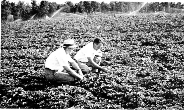
Virus-free Dixieland grown under irrigation.

This is the new rival of Blakemore, and will probably tend to replace it. With us it is about three days (one picking) later. The berries are large, much larger than Blakemore, and bright red, just a shade darker than Blakemore, very firm and solid. Dixieland plants are produced freely, making solid beds of large vigorous plants. At Beltsville, Maryland, Dixieland made 403, twenty-four quart crates an acre as compared to 241 for Blakemore. Try wherever Blakemore is grown. We have some 500,000 excellent plants. First come, first served.