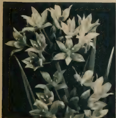
ALLIUM MOLY , Golden Leek. Globular umbels of golden yellow flowers. 12 inches. June-flowering. 10 for $ 0.25 25 for $ 0.55 100 for $ 2.00

Collection 43 25 each of ANEMONE FULGENS, TURBAN RANUNCULUS, SPARAXIS "SUPERBA", OXALIS ADENOPHYLLA 100 for $ 4.10