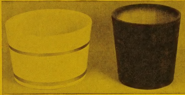
Made from New England White Pine