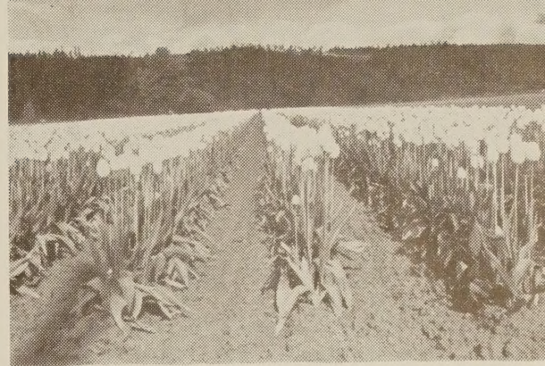
A VIEW OF OUR TULIP FIELDS