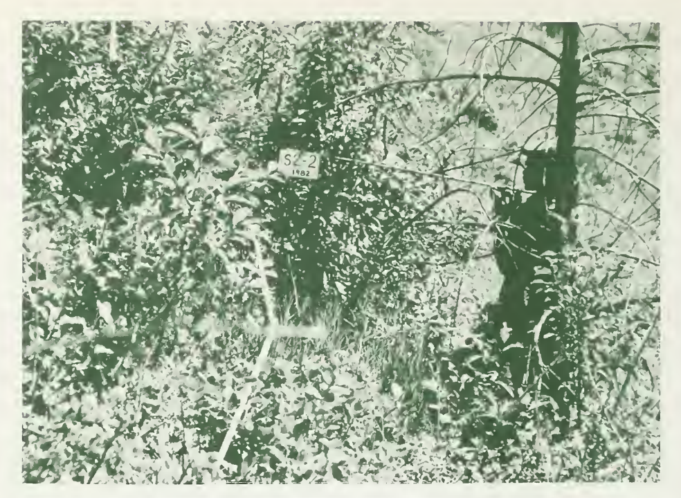
Figure 2— Prunus virginiana and other species of shrubs that regenerated vegetatively during two growing seasons following fire.

Fire Response —Chokecherry resprouts if top-killed (Chadwick and Dalke 1965; Fischer and Clayton 1983; Frischnecht and Plummer 1955) or from singed stems (Volland and Dell 1981), making the species resistant to eradication by fire. Cover value is reduced sharply the first year following fire, with some increase the second year (Gordon 1976). Chokecherry is an enduring (VI) species (fig. 2).