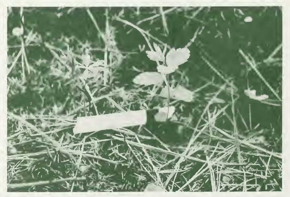
Figure 3— Spiraea betulitolia resprouting from a rnizome below the soil surface.

Biology —Two species of snowberry occur in this region: Symphoricarpos albus (L.) Blake (common snowberry) and Symphoricarpos oreophilus Gray (western snowberry). Both species are similar in lifeform and response to fire