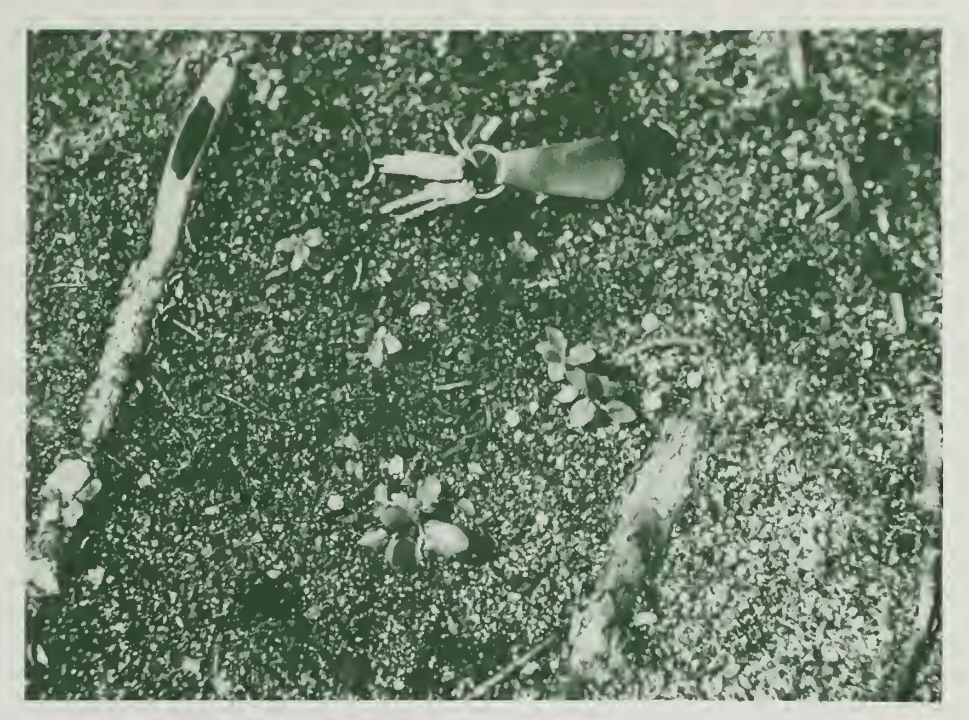
Figure 1—Ceanothus seedlings that germinated from stored seed activated by heat from the fire. No ceanothus was present before the burn.

(Dyrness 1973). The species resprouts from the root crown after being burned and is usually intolerant to shade.