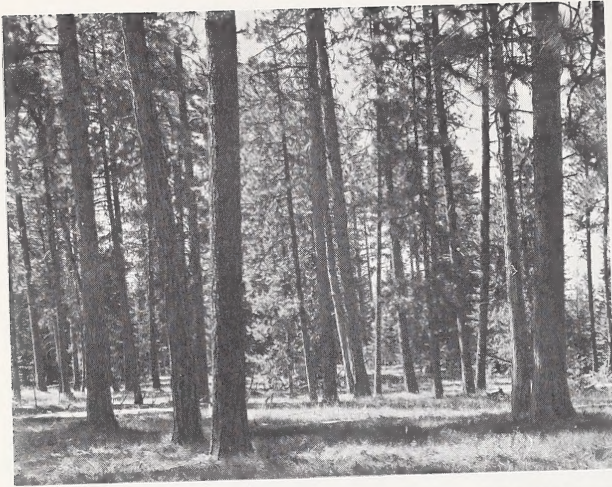
Figure 1.--Major habitats of the Starkey Experimental Forest and Range: open forest (top), dense forest (middle), grassland (bottom).