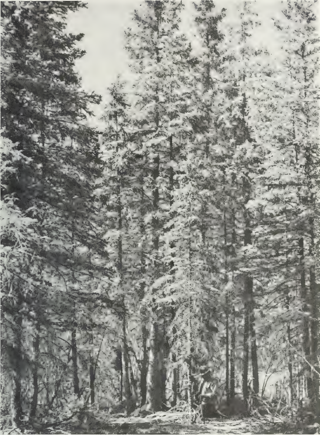
Figure 3.-An interior white spruce stand illustrating lower biomass per acre with most of the biomass in sapling-sized trees.