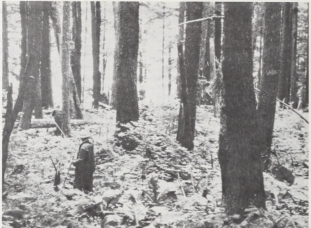
Figure 2.—A coastal Sitka spruce stand illustrating high biomass per acre in trees of large diameter.