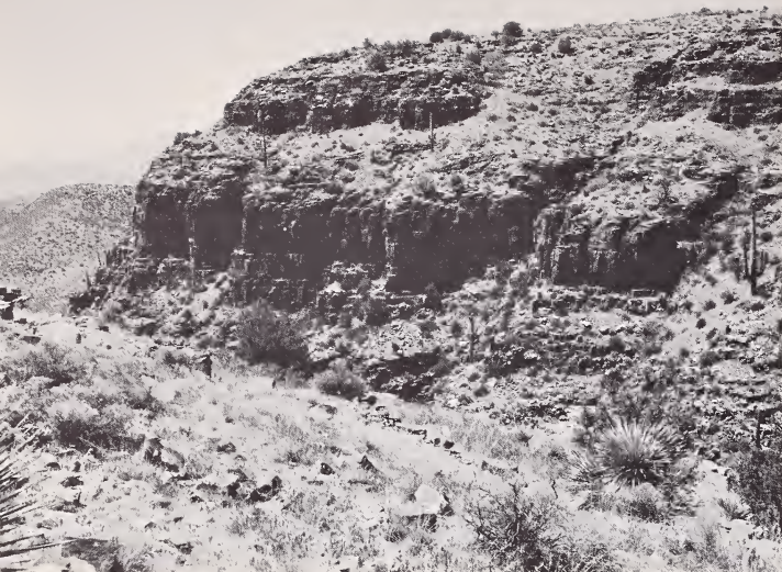
Figure 9.--Desert shrub on rocky soils near the south end of the Experimental Forest.

canyon. Common species are generally those encountered in the desert grassland above. Yellow paloverde ( Cercidium microphyllum ) is a characteristic tree. Common shrubs include Fremont wolfberry ( Lycium fremontii ) and jojoba ( Simmondsia chinensis ). Saguaros ( Cereus giganteus ) occur in protected niches in the canyon walls, but are nowhere abundant. Pricklypears and chollas are common.