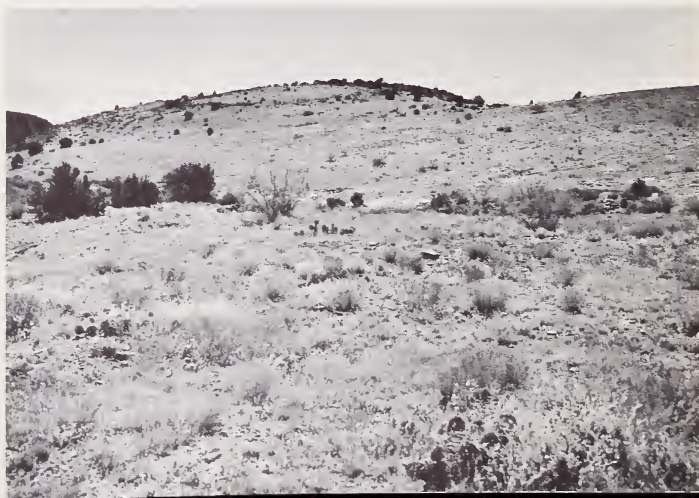
Figure 8.--Desert grassland on shallow, quartzite-derived soils near Base Rock.

Unlike the desert floor outside the Forest, perennial grasses are fairly common on the steep, rocky slopes in the protection of the