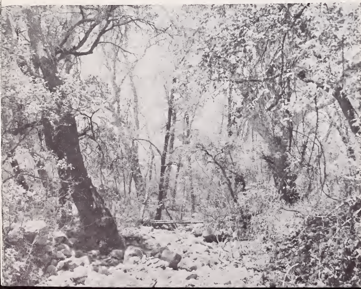
Figure 10.--Riparian vegetation along Parker Creek, within the chaparral type.

In the lower reaches of Parker and Pocket Creeks, growing conditions are more severe during most summers and few truly riparian herbaceous species from upper reaches thrive here. Arizona sycamore ( Platanus wrightii ) and Arizona walnut are dominant. Shrubs and