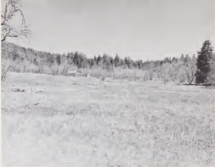
Figure 4.--Small mountain park in the Middle Fork of Workman Creek.

Herbaceous plants are abundant. Grasses include Kentucky bluegrass ( Poa pratensis ), redtop ( Agrostis palustris ), and orchardgrass ( Dactylis glomerata ). Common bindweed ( Convolvulus arvensis ), skyrocket ( Gilia aggregata ), and several composites, including the common sunflower ( Helianthus annuus ) and ragleaf bahia ( Bahia dissecta ) grow throughout the clearings. Seeps and springs are surrounded by Juncus spp., Cyperus spp., Carex spp., and prairiemallow ( Sidalcea neomexicana ).