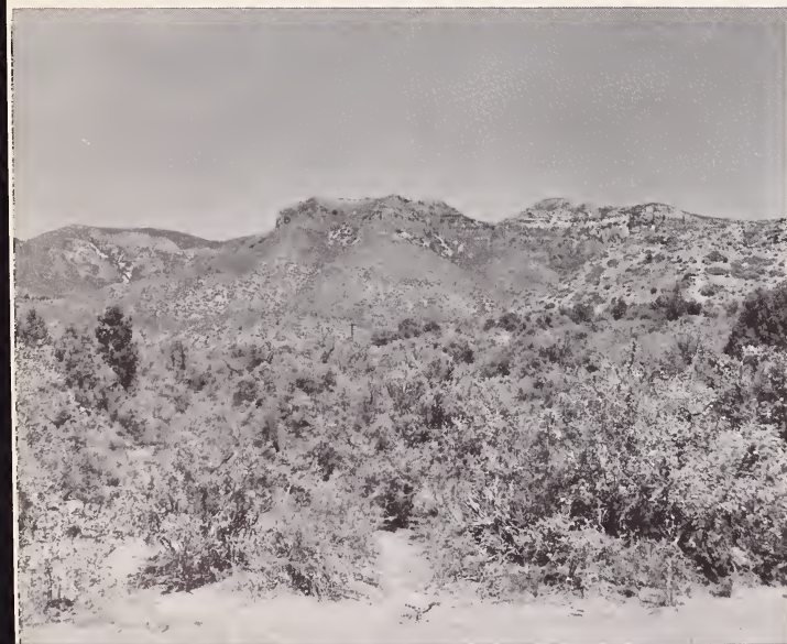
Figure 7.--Dense mature stand of chaparral near western edge of Experimental Forest. Quercus turbinella is the dominant species.

Chaparral reaches its best development on diabase-derived soils between 4,500 and 6,000 feet elevation (fig. 7). Where soils are thin,