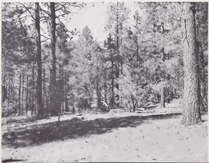
Figure 5.--Ponderosa pine stand at Workman Creek.

sites such as west-facing slopes or in shallow, rocky soils (fig. 5). Ponderosa pine is the dominant tree. On drier sites, New-Mexican locust, Emory oak ( Quercus emoryi ), and alligator juniper ( Juniperus deppeana ) are the main understory species. In cooler, moist areas, New-Mexican locust and Gambel oak occur as an understory. Herbaceous plants are few. Bracken ( Pteridium aquilinum ) is common locally following summer rains. Plants common along roadsides and in clearings include the colorful scarlet bugler ( Penstemon barbatus ), Fendler ceanothus ( Ceanothus fendleri ), and red and yellow pea ( Lotus wrightii ). Sparse grasses, usually most common in clearings, include mountain muhly ( Muhlenbergia montana ), bulb panicum ( Panicum bulbosum ), and Pringle needlegrass ( Stipa pringlei ).