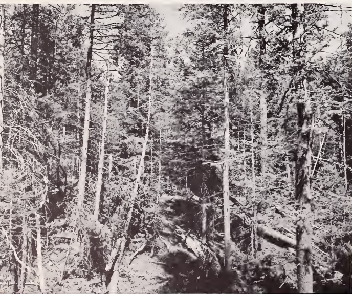
Figure 3.--Mixed conifer stand at the head of Workman Creek. Dense shade restricts herbaceous understory.

The major park is found on the Middle Fork of Workman Creek, in the mixed conifer vegetation type (fig. 4). Deep, fine soils and high rainfall contribute to a diverse flora. Clearings are bordered by dense stands of ponderosa pine, white fir, and Douglas-fir, interspersed with quaking aspen and Gambel oak. Clumps of Arizona walnut ( Juglans major ) are scattered within the park. Arroyo willow ( Salix lasiolepis ) forms dense colonies along washes. Thickets of Gambel oak, mountain snowberry, and roses ( Rosa spp. ) and the apple orchard (at the deserted Peterson Ranch) provide good wildlife cover.