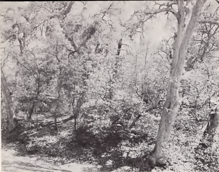
Figure 6.--Dense oak-woodland community near Headquarters. Dominant tree is Quercus arizonica .