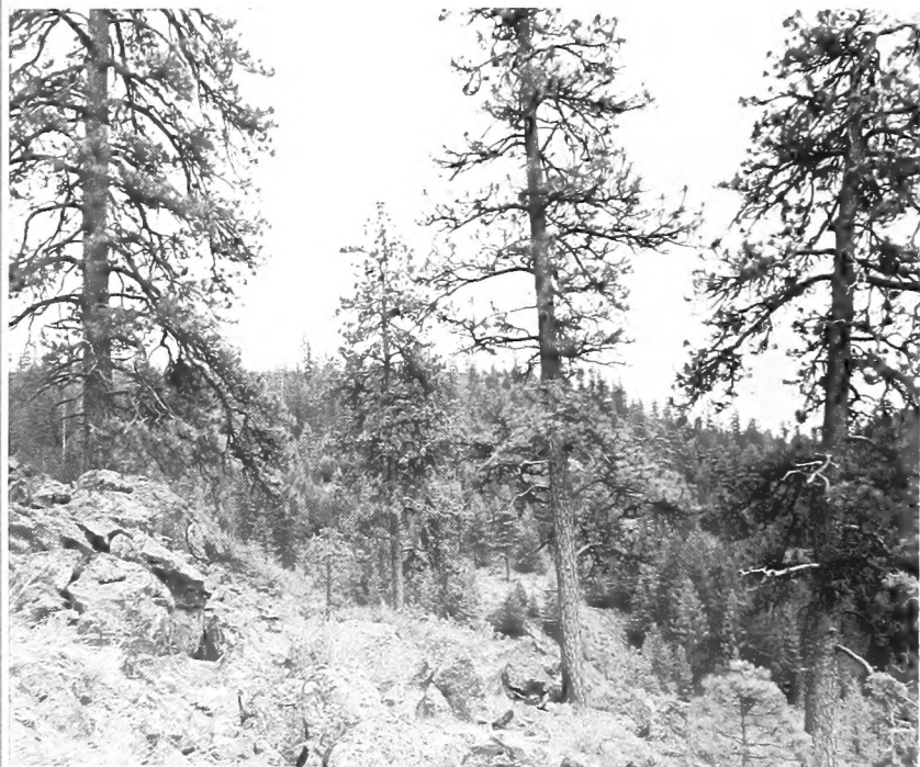
Figure 2.--These large rocks on the Warm Springs Indian Reservation severely restrict stocking capacity. The site index is 60 and the total basal area is 45 square feet per acre or 26 percent of "normal."

Stocking standards also typically rest on the assumption that all acres with a given site index are equally productive--at least within a forest type. Present growing stock--usually expressed as basal area or number of trees per acre--is compared to a stocking standard that is often derived from normal yield tables. This comparison provides an indication