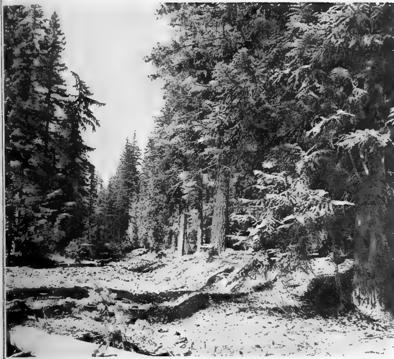
Figure 4.--It is reasonable to assume that this creek bed is nonstockable.

Learning to recognize sites that grow trees but are limited in stocking capacity is a complex problem. If we accept the premise that undisturbed stands tend toward equilibrium (Franz 1967), we can seek out such stands and compare their basal areas with those predicted by a normal yield table for the same stage of development. Those stands with less than "normal" stocking (including recent mortality) can be assumed to have a stocking restriction. By measuring such stands, we could build