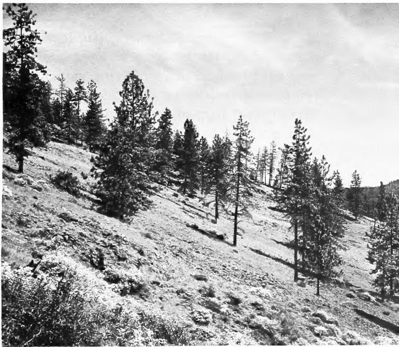
Figure 3.--Jeffrey pine growing on serpentine (peridotite soil) north of Grants Pass, Oregon. The stocking capacity of this area is severely limited. Although the site index is 95, the basal area is only 24 square feet per acre--about 11 percent of "normal" stocking.

Under what conditions are the procedures described above inappropriate? One such situation occurs when small patches of nonforest land, usually avoided by the makers of normal yield tables, are included in the forest land sample. Such patches may be deliberately combined with forest land because they fail to meet some previously defined minimum area standard, or they may be patches of scabland--nonforest inclusions incapable of growing trees--that have been mistaken