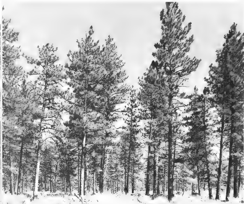
Figure 5.--This uncut ponderosa pine stand, near Bend, Oregon, is growing in a pine/bitterbrush/fescue plant community. Although the site index is 70, basal area per acre is only 85 square feet--about 42 percent of "normal." The growth rate has slowed from six rings per inch to 30 rings per inch, indicating that the stand is probably overstocked.

Forest Survey field plots sample approximately an acre with a cluster of 10 points. In eastern Oregon, each stockable point on each commercial forest plot was placed in one of the 13 plant communities. On spots where the soil was too shallow to support tree growth, we found grasses and herbs that identified nonforest habitat types in Hall's key. Points falling on such spots were classed as nonstockable, as were those falling on bare rock, water, or any other nonstockable condition. The 10 discount factors--one for each point in the 10-point cluster--were then averaged to provide a discount factor for the entire plot. Productivity was estimated for the plot by obtaining the mean annual