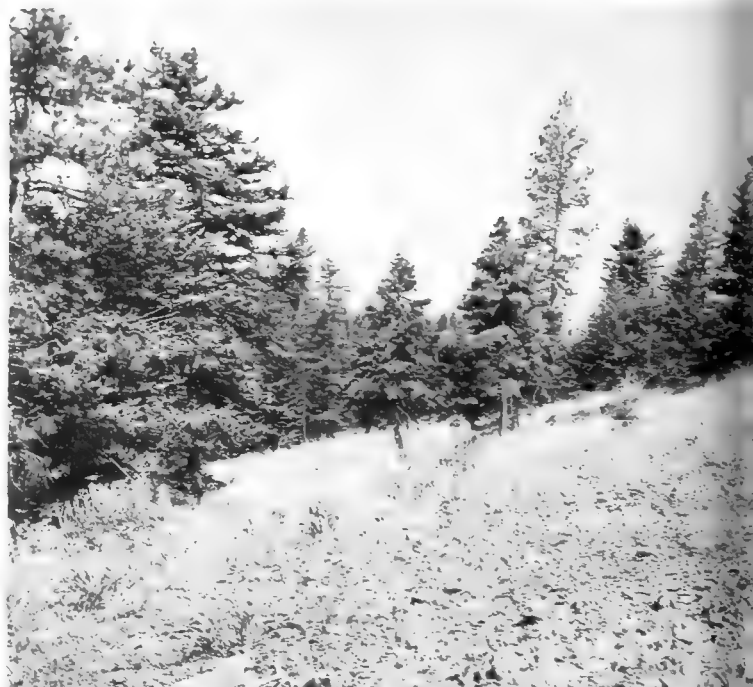
Figure 6.--Nonforest ( Poa-Danthonia ) scabland in Oregon's Blue Mountain area. The forest land in the background is a pine/wheatgrass community with a stocking capacity limited to about 20 percent of "normal" basal area.