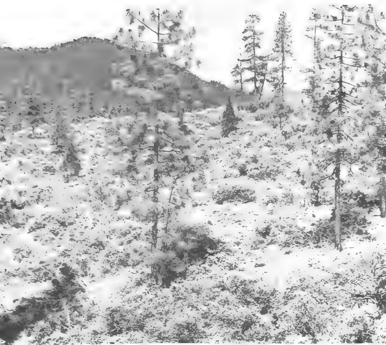
Figure 8.--Natural sparse stand of Jeffrey pine near Weaverville, California. This is a serpentine area with a site index of 95. Although the stand has only about 28 percent of "normal" basal area, low growth rates indicate that the stocking level is at or near capacity.

used for the study except that the data were gathered from special temporary plots instead of the regular inventory field plots (fig. 9). Since lists of indicator species like that developed by Griffin (1967) did not exist for these areas, we recorded all the vascular plant species that were present and identifiable on each plot at the time of our visit. Since we were able to visit each plot only once, species that were not generally identifiable throughout the growing season were subsequently dropped from our list of potential indicators. Development of equations for the three areas prior to regular fieldwork made plant identification much easier for Forest Survey field crews, since they needed to identify only the relatively few plants appearing in the final equation--a much easier task than identifying the 172 plants required for Shasta and Trinity Counties.