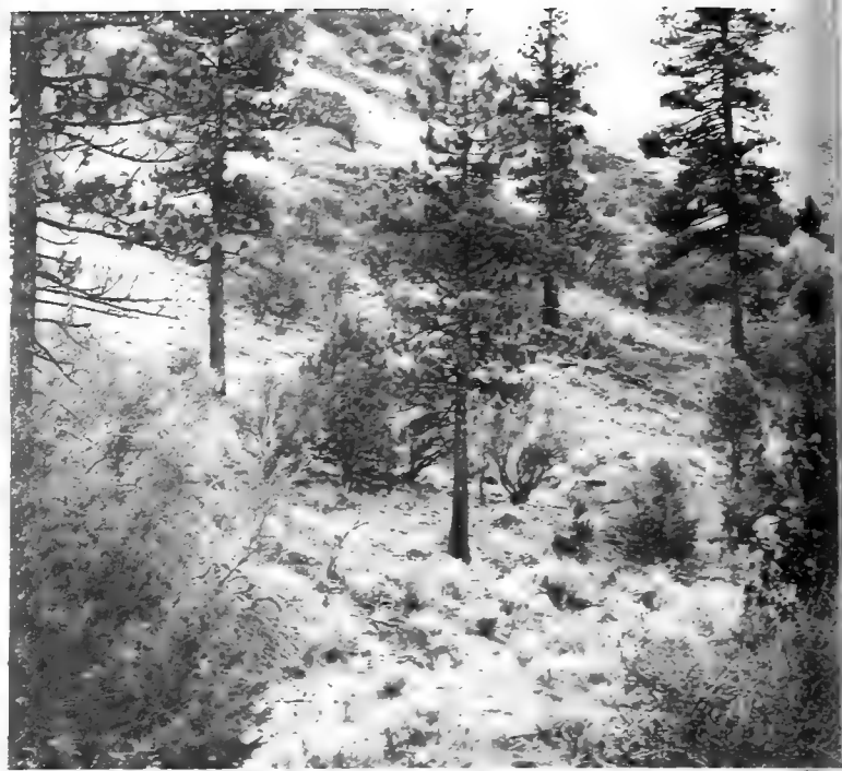
Figure 9.--A low density stand of Jeffrey pine near Aden, California. Scattered stands such as this are common on the Modoc plateau in northeastern California. There is no evidence that they have ever supported "normal" stocking levels.

used for the study except that the data were gathered from special temporary plots instead of the regular inventory field plots (fig. 9). Since lists of indicator species like that developed by Griffin (1967) did not exist for these areas, we recorded all the vascular plant species that were present and identifiable on each plot at the time of our visit. Since we were able to visit each plot only once, species that were not generally identifiable throughout the growing season were subsequently dropped from our list of potential indicators. Development of equations for the three areas prior to regular fieldwork made plant identification much easier for Forest Survey field crews, since they needed to identify only the relatively few plants appearing in the final equation--a much easier task than identifying the 172 plants required for Shasta and Trinity Counties.