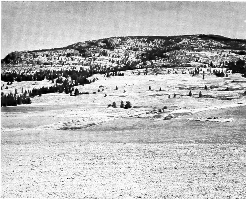
Figure 1.-- Ponderosa pine on the Colville Indian Reservation growing near the lower limits of tree occurrence. Stands such as this are naturally sparse.

Naturally sparse stands may also occur where physical obstructions inhibit tree growth over part of an area. Trees may be growing in pockets of deep soil or cracks in the bedrock, interspersed with small areas where the soil is too shallow to grow trees. Such stands also often appear understocked when, in fact, the site may be fully occupied.