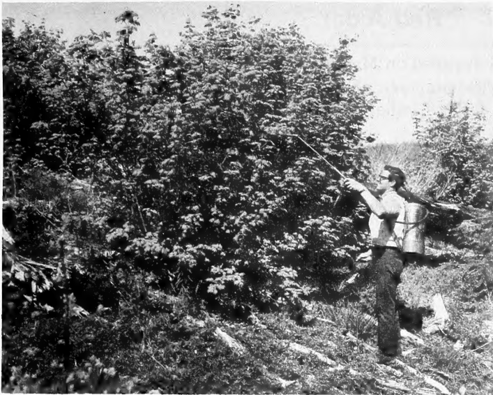
Figure 1.--Vigorous plants such as this vine maple were treated with knapsack sprayers.

Herbicides such as 2,4-D, 2,4,5-T, silvex, amitrole-T, MSMA, and combinations of these are known to be selective at certain rates and stages of plant development. These were tested for possible use as release sprays for conifers. Less selective herbicides such as picloram, dicamba, and bromacil were tested for use in site preparation sprays.