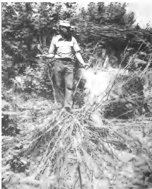
Figure 4.--Vine maple shrubs killed by picloram broke during the second winter after treatment.

Bud-break sprays of 2,4,5-T at 2 lb ae per acre in an oil carrier are presently recommended for vine maple control. This treatment is more effective on vine maple and less damaging to conifers than early foliar sprays. However, results from this study suggest that control adequate for conifer release can be obtained with early foliar sprays of 3 lb per acre of 2,4,5-T or silvex if conifers are protected from direct application. For site preparation, best control can be obtained with picloram if applied after full leaf development while vine maple shrubs are actively growing.