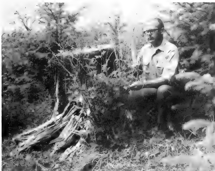
Figure 3.--Basal sprouts on live salmonberry shrubs were limited in number and size 24 months after spraying with 2,4,5-T.

2/ Plants dead at beginning of third growing season.