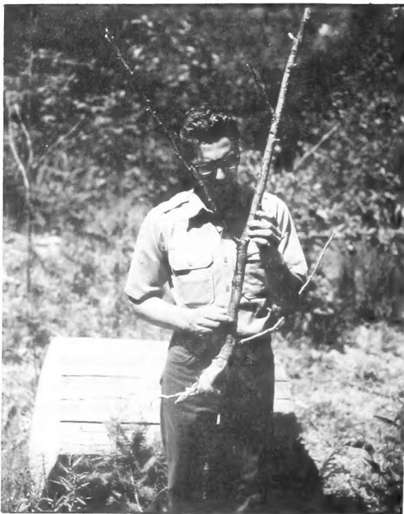
Figure 2.--This red alder had fallen by the end of the second summer after treatment.

An early application of 2,4-D is often recommended for releasing conifers from red alder if conifers are shielded from spray by the alder foliage. However, conifers are actively growing during this period and may be damaged by sprays if exposed. In contrast, conifers are more resistant by midsummer after growth ceases and buds are set (Gratkowski 1961). Results from this study suggest that late foliage sprays of either 2,4-D or 2,4,5-T at 2 lb ae per acre applied in a water carrier will produce good control of red alder with minimum damage to conifers. Early or late applications of either herbicide should be effective for site preparation in pure red alder brush types. These herbicides are also more selective and less expensive than the others tested.